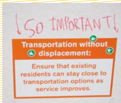
“Ensure that existing residents can stay close to transportation options as service improves.”

What if public transportation was free for youth and elders?