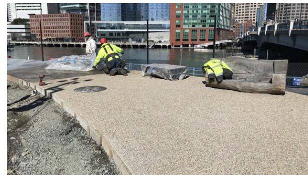
Log seating area