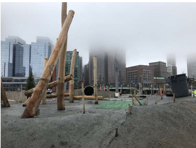
Play surfacing sub structure under log climber