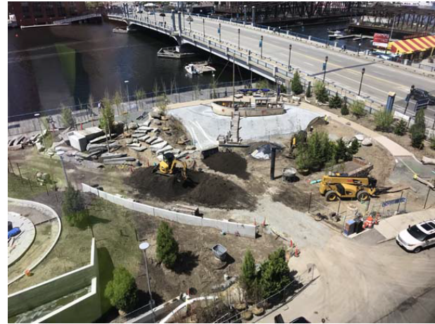
North side view from adjacent building