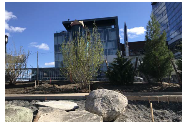
Beginning tree planting