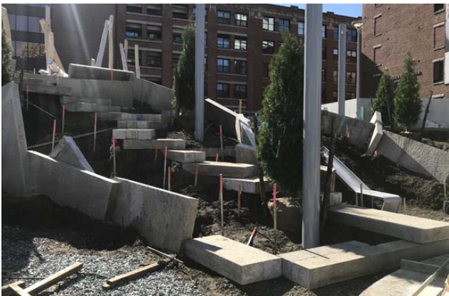
Boston Public Library granite and slide hill