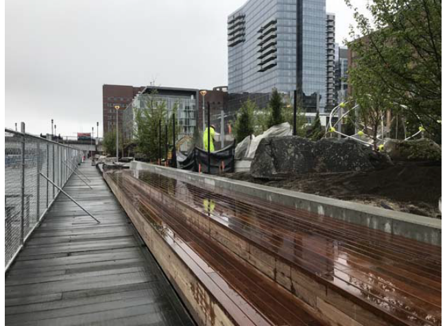
Harborwalk seating complete