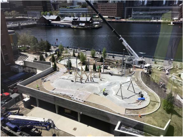
South side view from adjacent building