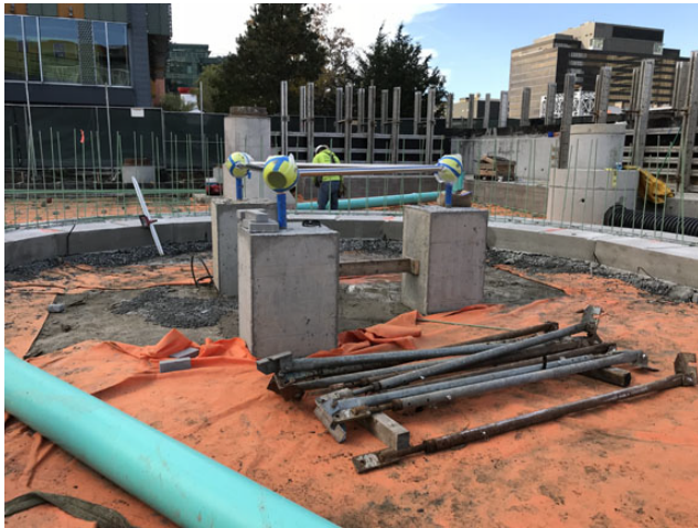
Foundation for net climber