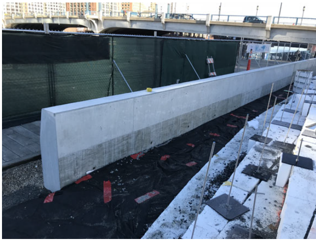
North Harborwalk wall poured