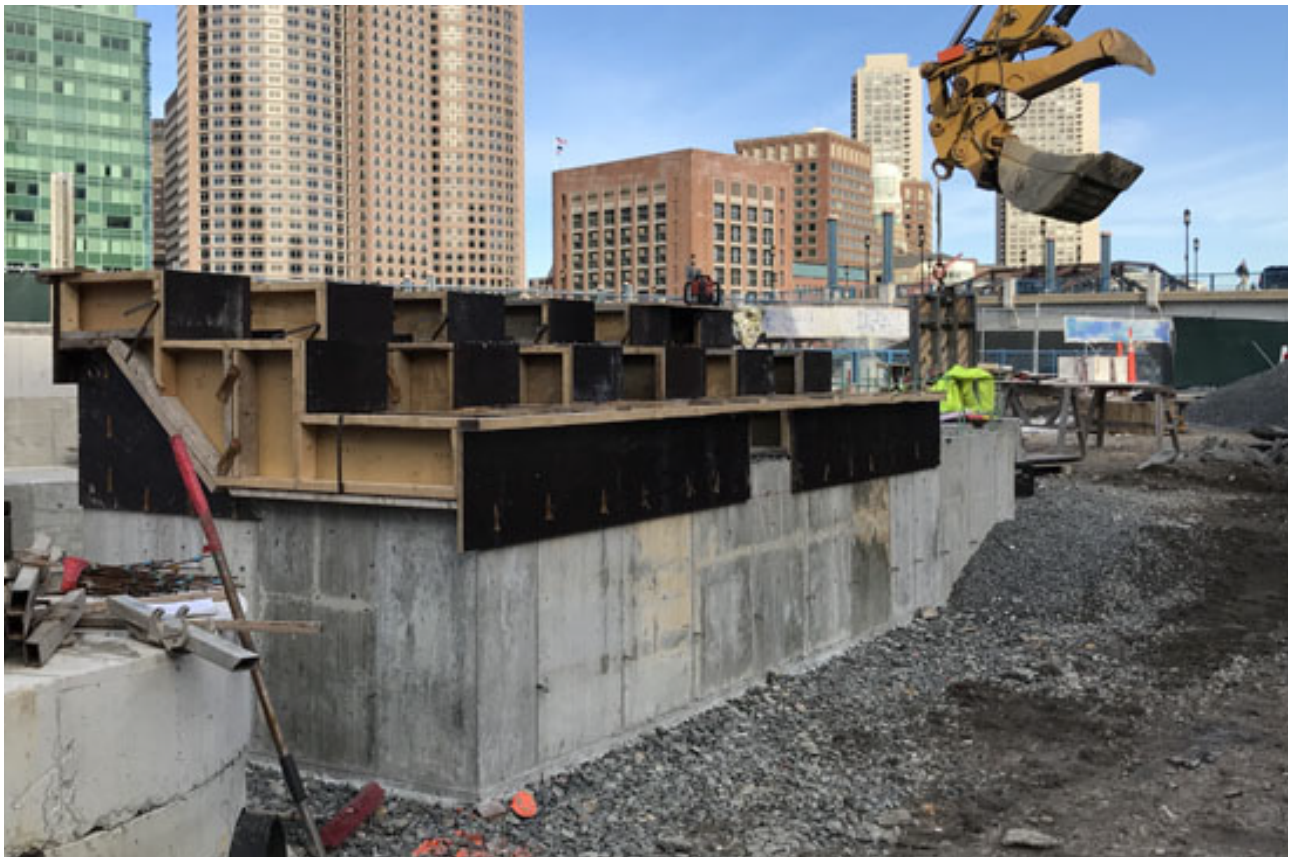
Amphitheater foundation installation