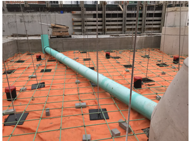
South site prepped for mud slab to be poured