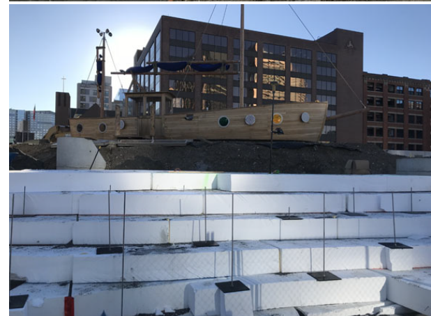
North geofoam installation