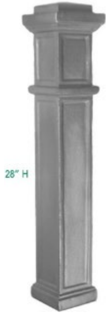
SQUARE POST LAWLER FOUNDRY CAST POST 9113-X