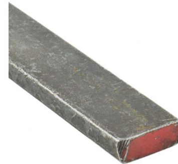
FLAT BAR \frac{1}{2} " x 1 \frac{1}{2} "