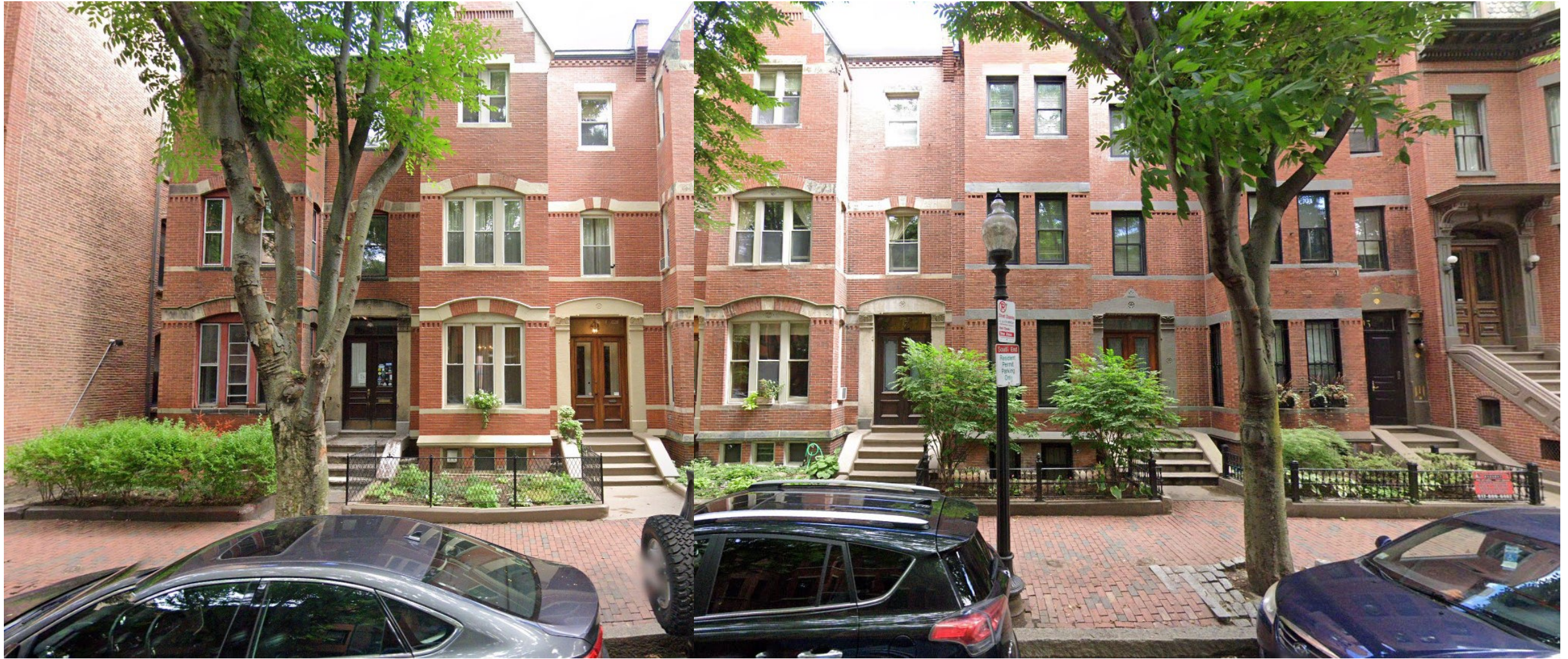
EXISTING NEIGHBORING FENCES