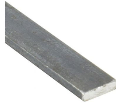
FLAT BAR \frac{1}{2} " x 2"