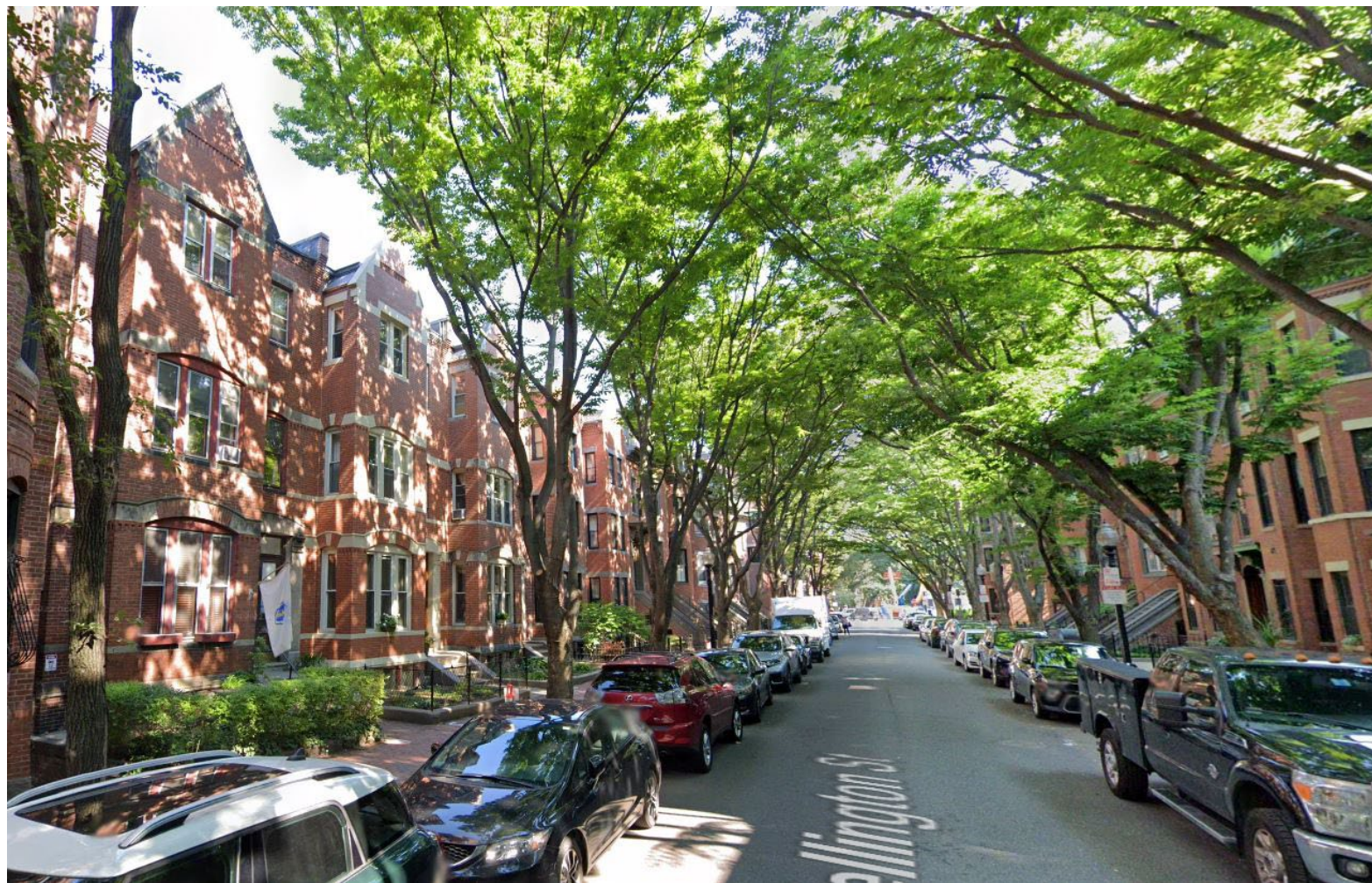
VIEW ALONG WELLINGTON STREET