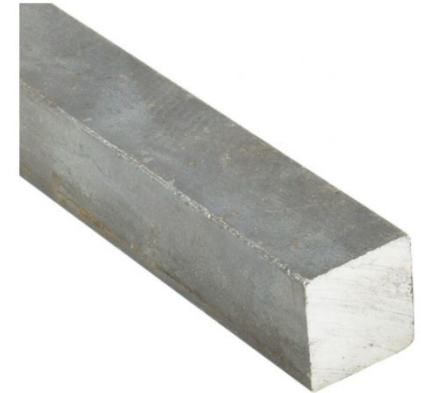
SQUARE BAR \frac{1}{2} "