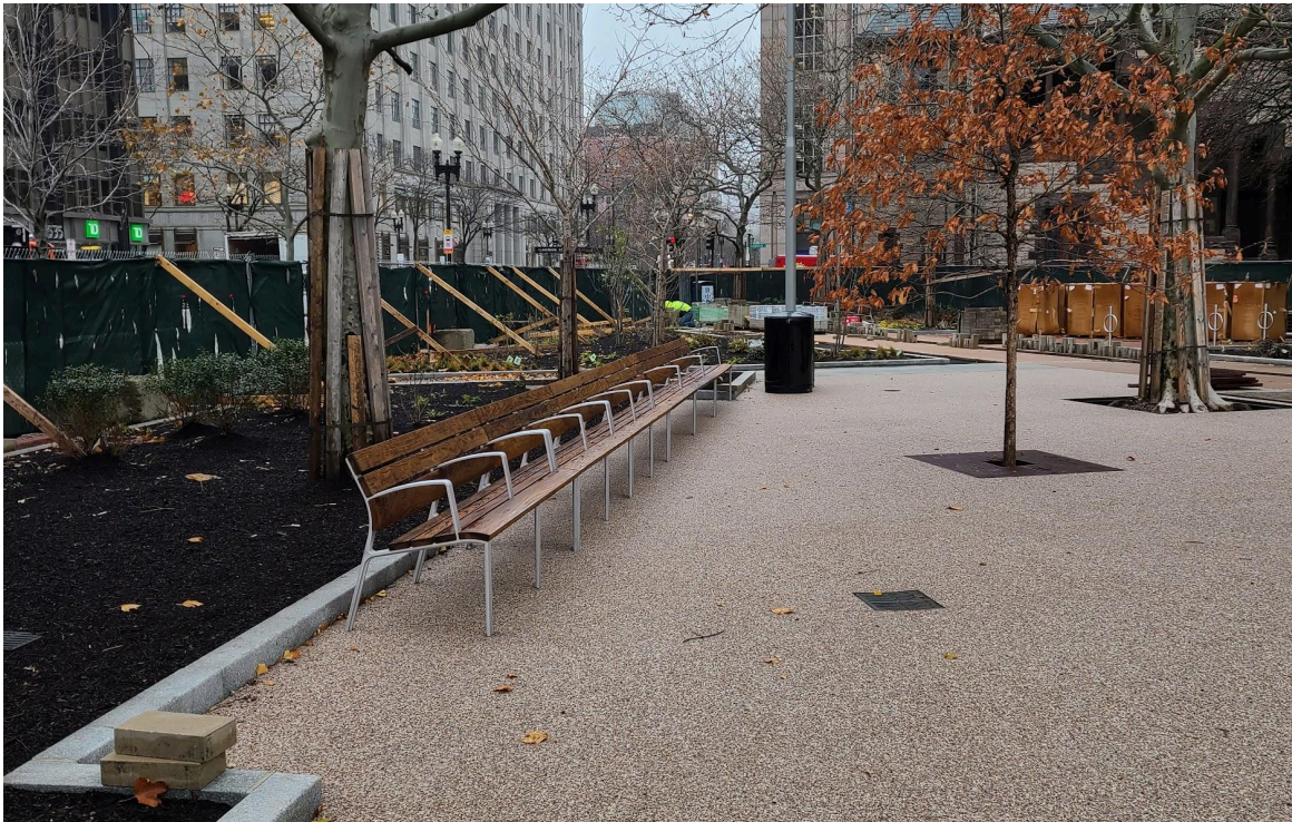
A row of benches with room for ADA “companion seating,” with their backs to Boylston Street, and new trash barrels nearby. The pervious paving in this area allows rainwater to percolate through, watering the trees.