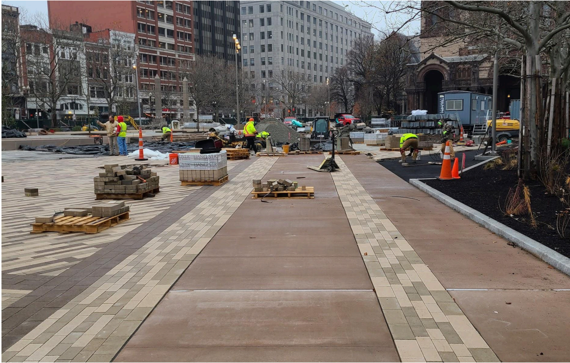
Standing at the corner of St. James and Dartmouth St., a view of the pavers along walkways and in the plaza, to the left. At the time of writing this report, the contractor has completed more of the plaza - but still not enough to open on 12/31/2024 unfortunately.