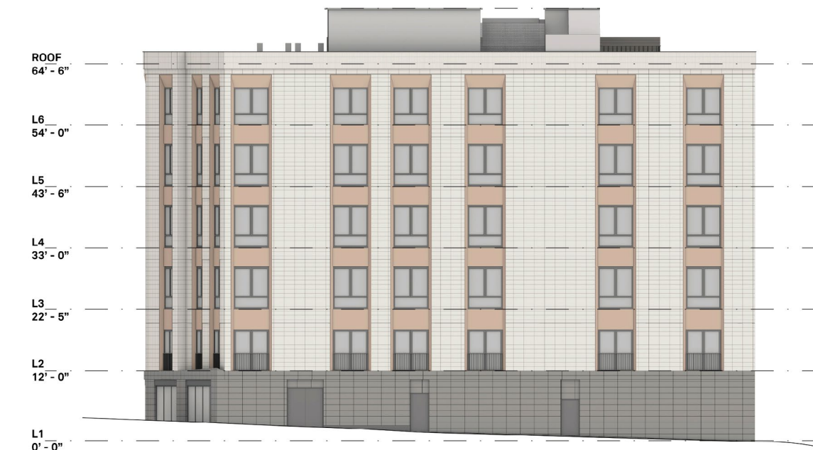
4 WEST ELEVATION