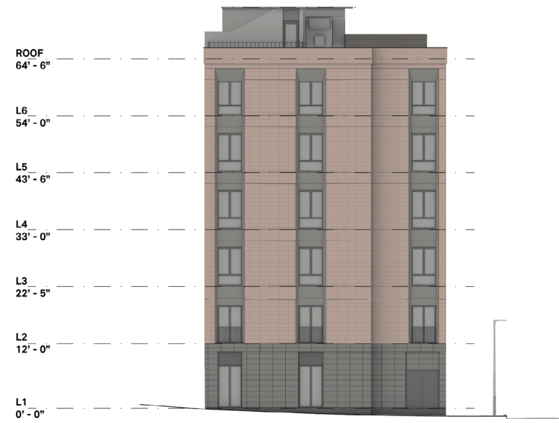
3 SOUTH ELEVATION