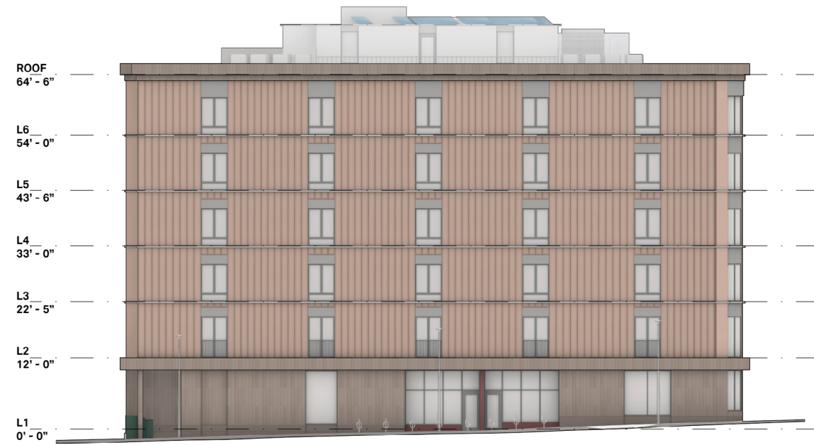
2 EAST ELEVATION