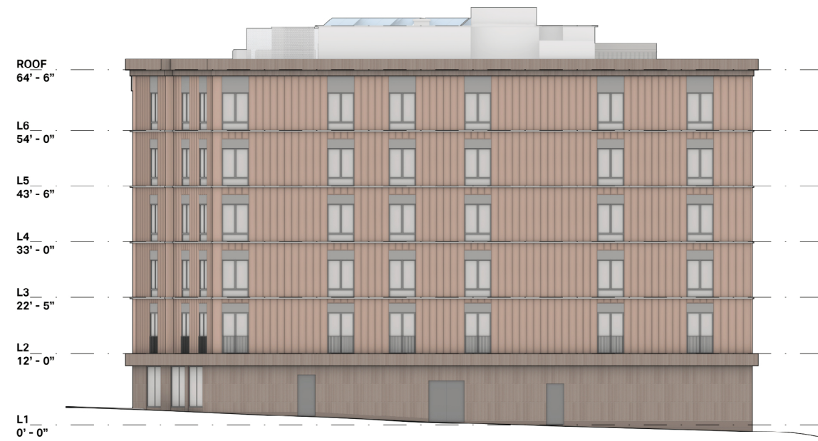
4 WEST ELEVATION