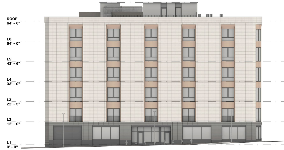
2 EAST ELEVATION