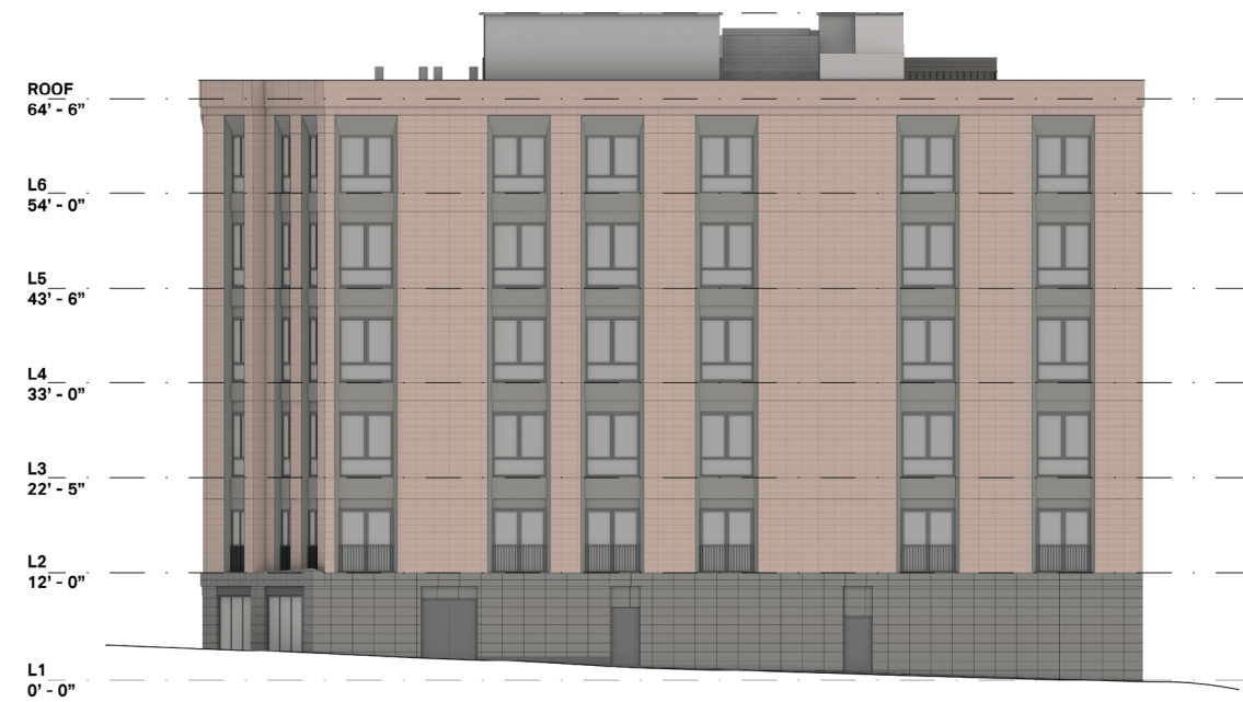
4 WEST ELEVATION