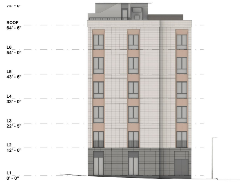
3 SOUTH ELEVATION