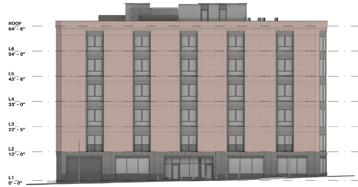
2 EAST ELEVATION