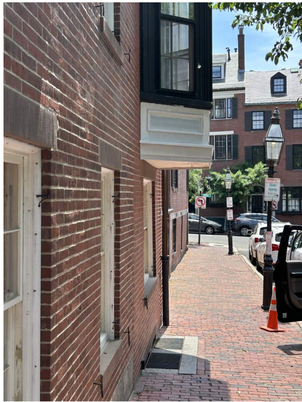
Existing bay with lower section primed to protect raw wood from recent repairs. Note how the primed section harmonizes with existing trim and sash.