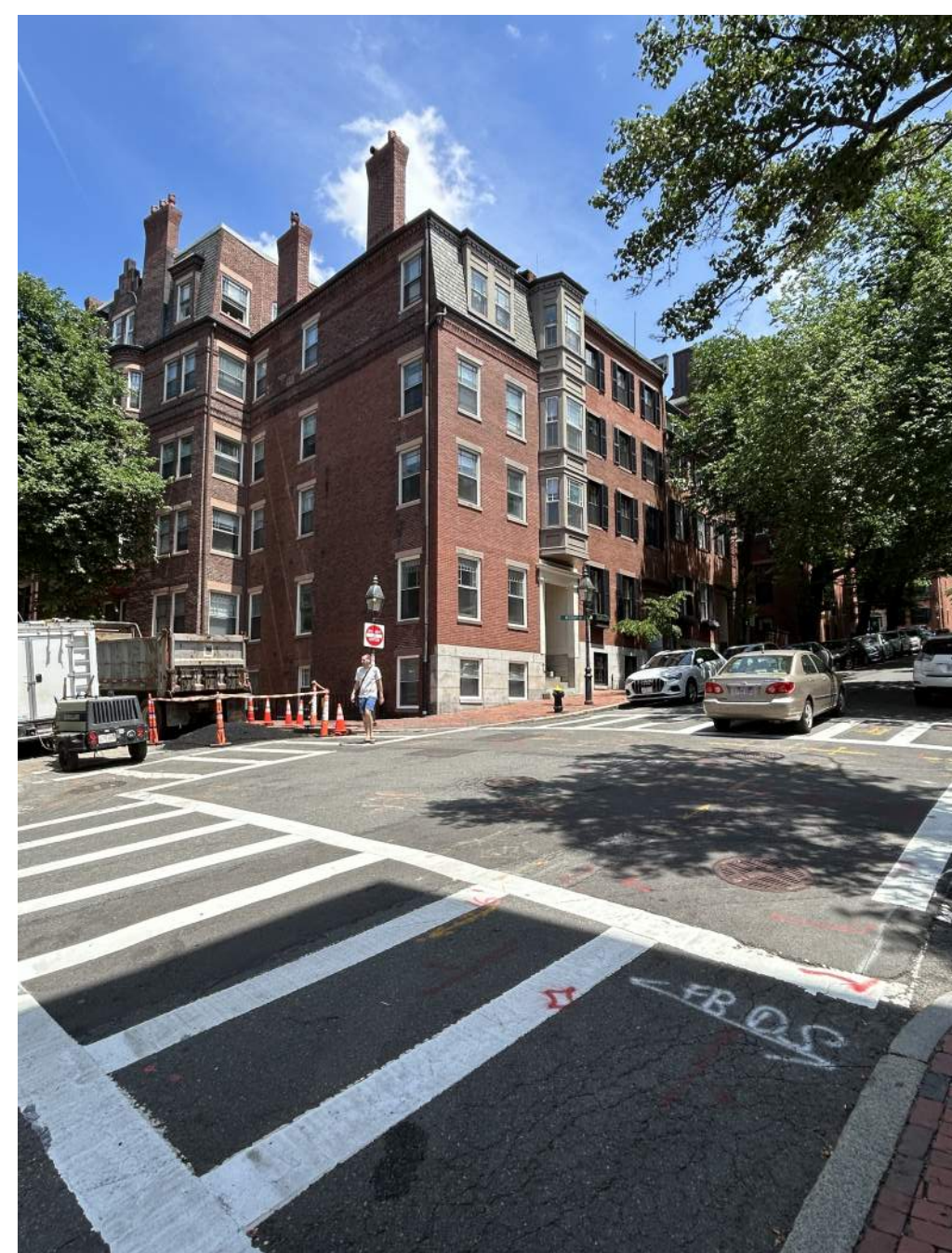
bays on 108 Mount Vernon Street are light-colored, matching the trim and sash.