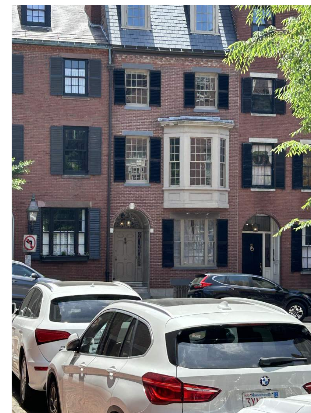
The bay matches the sash and trim at 62 Chestnut Street (where West Cedar ends).