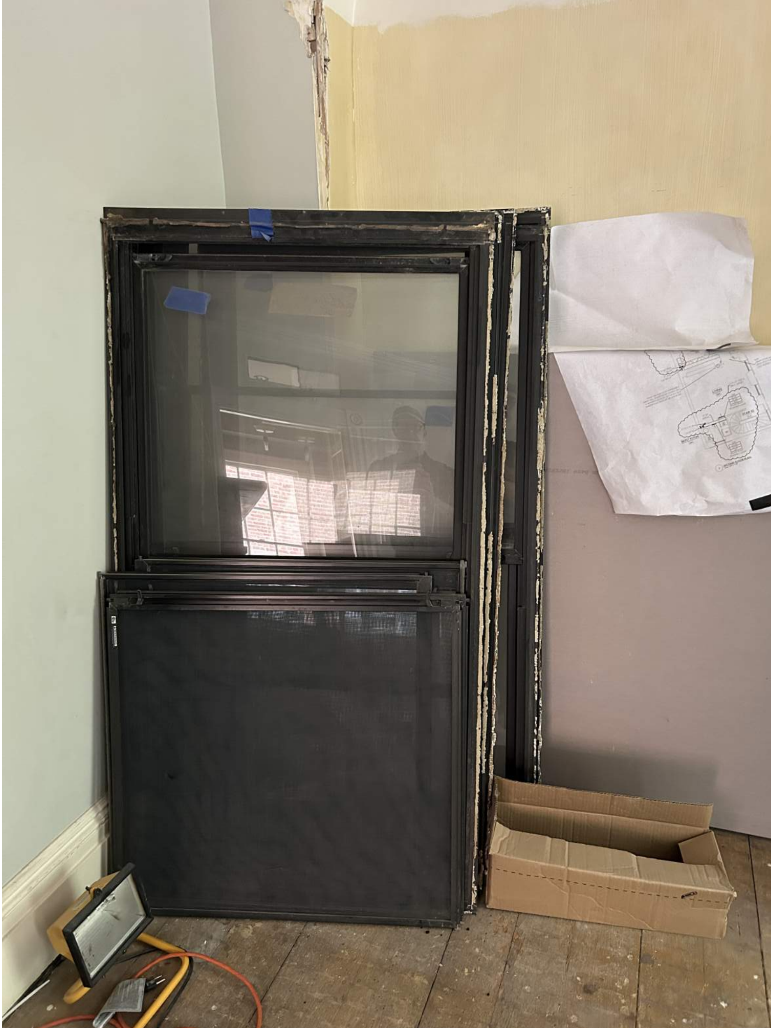
Existing black triple track storm windows.