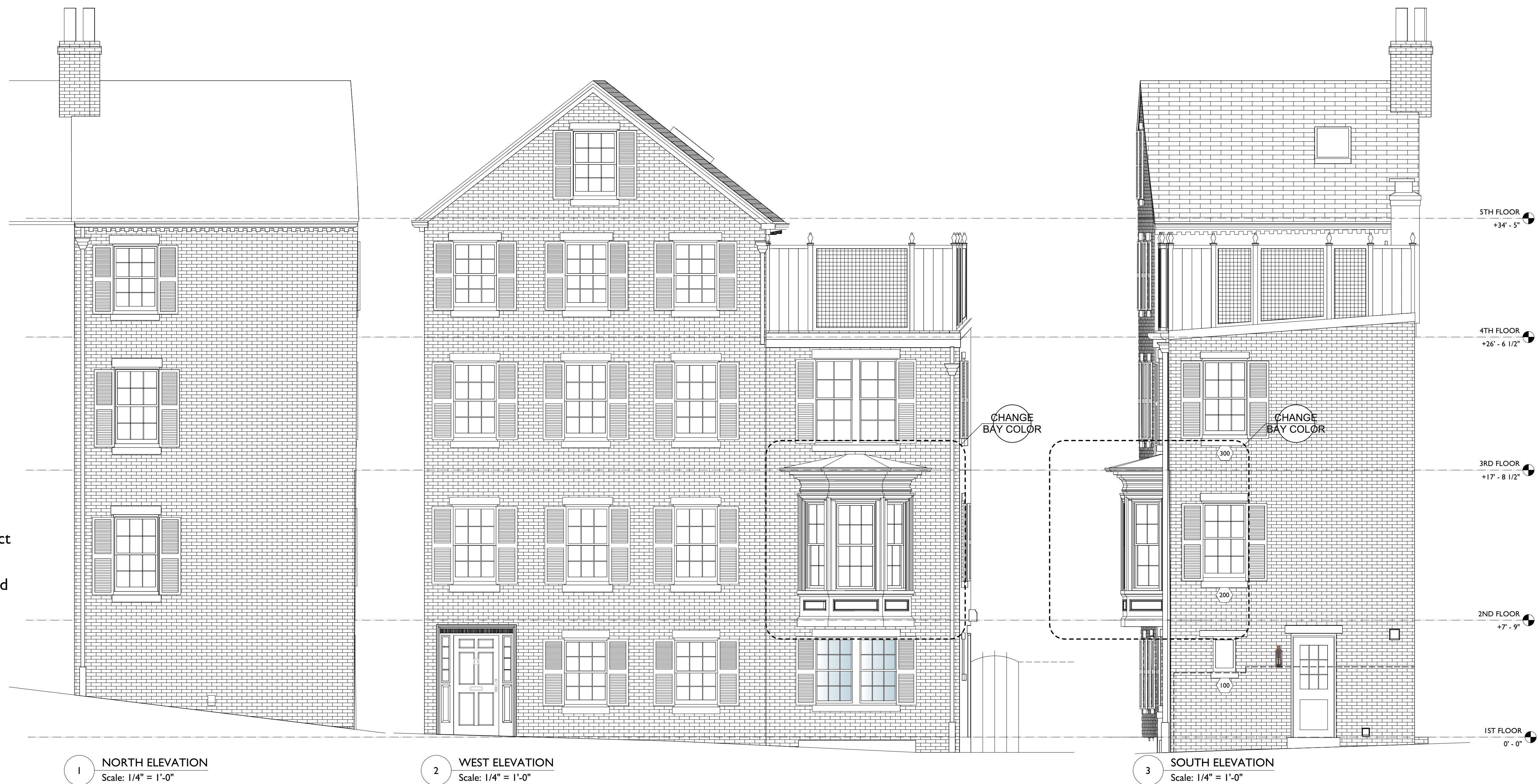
1 NORTH ELEVATION Scale: 1/4" = 1'-0"