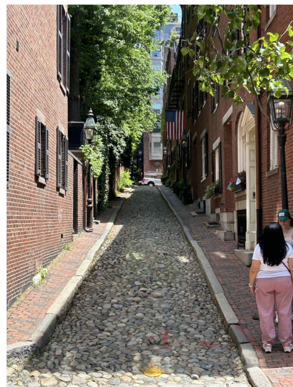
9 Willow Street at the upper end of Acorn Street from 5 West Cedar has the same light-colored bay and window combination.