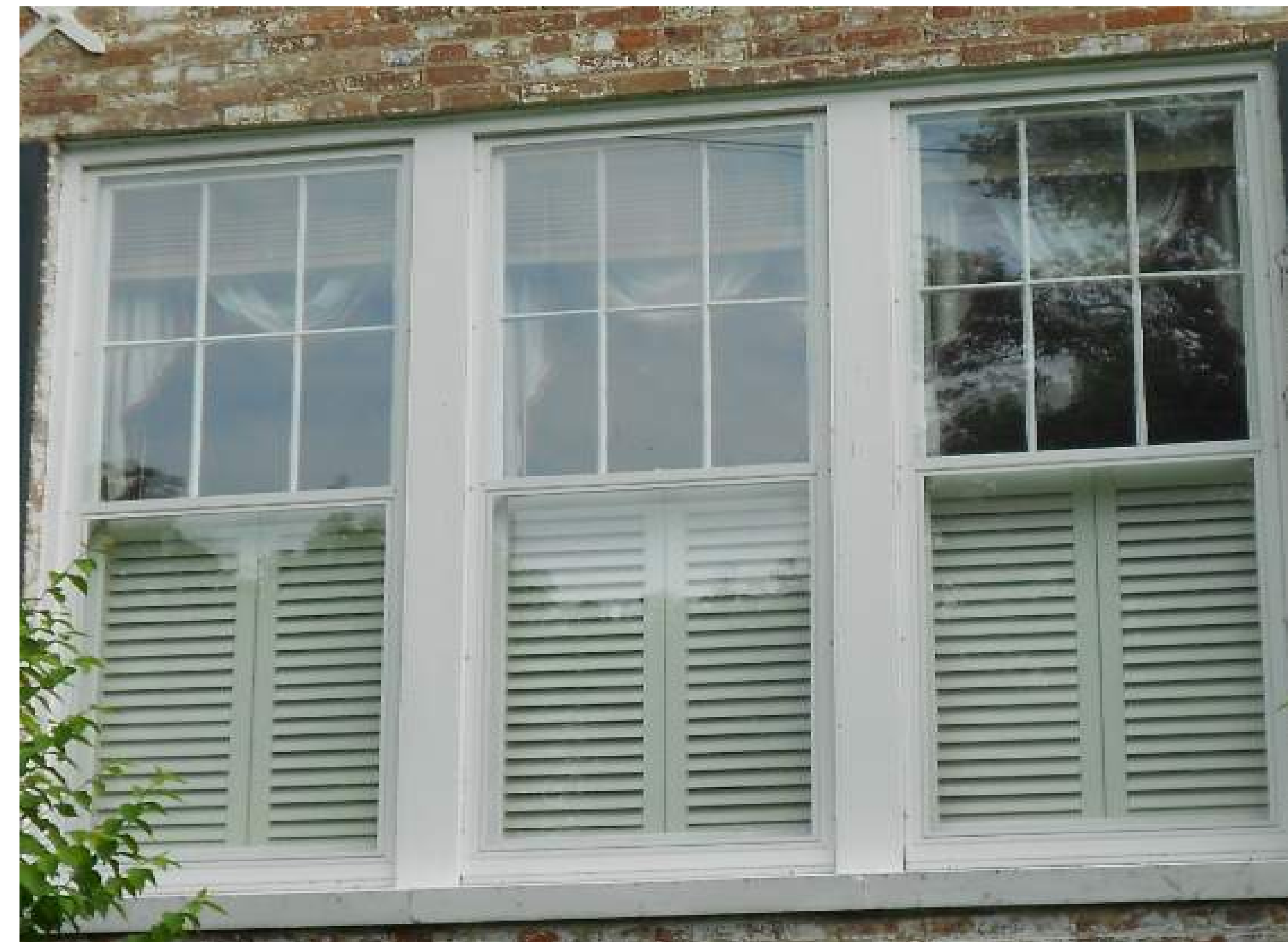
Photos from manufacturer of installed examples of the proposed replacement storm windows - Allied Windows Inc., Historic One Lite with removeable bottom sash. Colored like exterior trim and sash. Clear glass.