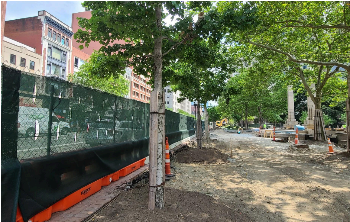
Boylston street trees are now inside the construction fence, and have mounds of soil to cushion their root zone as the contractor works around them to install structural soil and porous pavement.