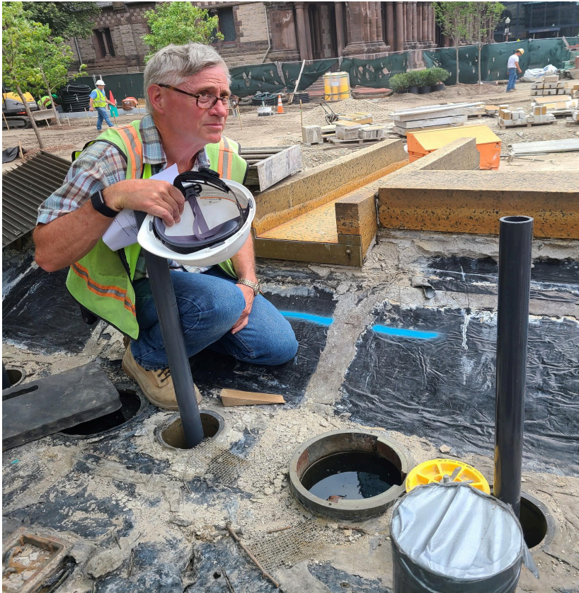
Our contractor indicates the blue line where the high water level should be, in the upper pool.