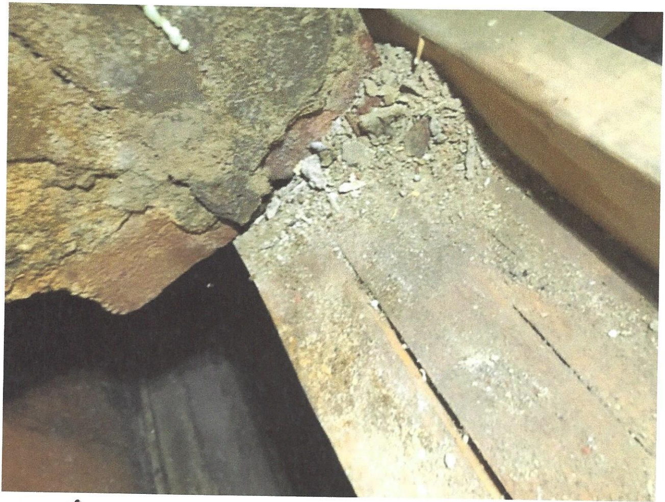
Chimney supported on LVL above Hall ceiling