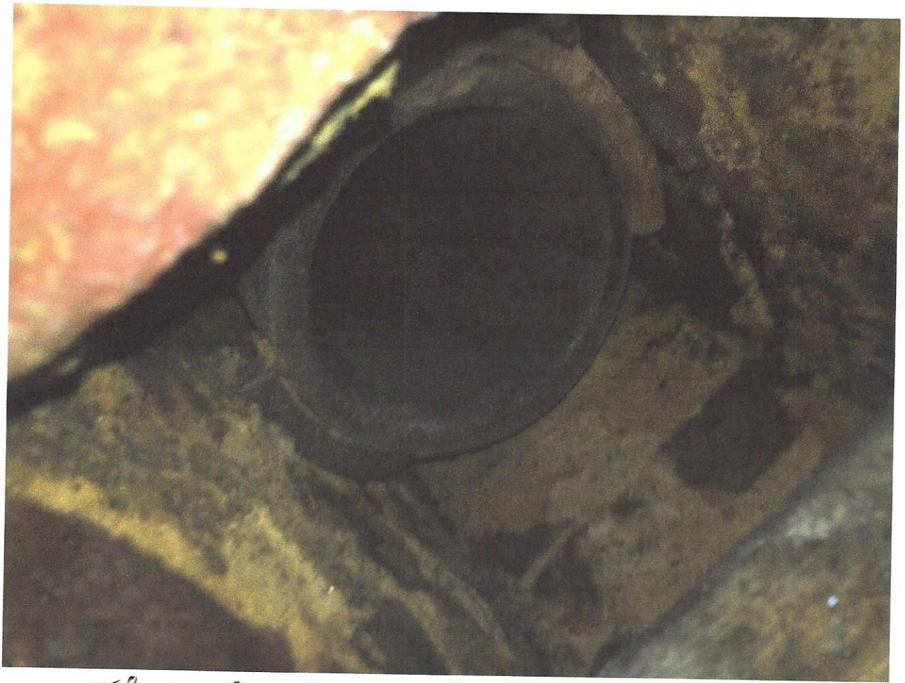
The Round Flue inside chimney has slipped down