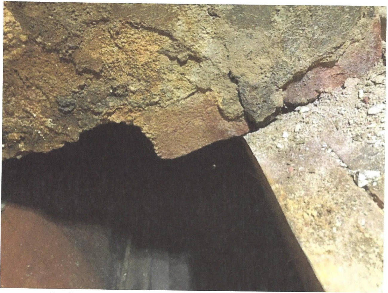
Looking at the Bricks of chimney on the LVL supports