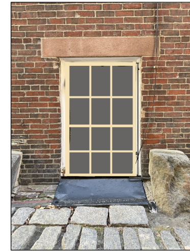
ALLEY FACING WINDOW GRILLE

NEW WINDOW SECURITY GRILLES WILL HAVE LAYOUT TO MATCH EXISTING SASH. GRILLES WILL BE PAINTED WHITE TO MINIMIZE VISIBILITY