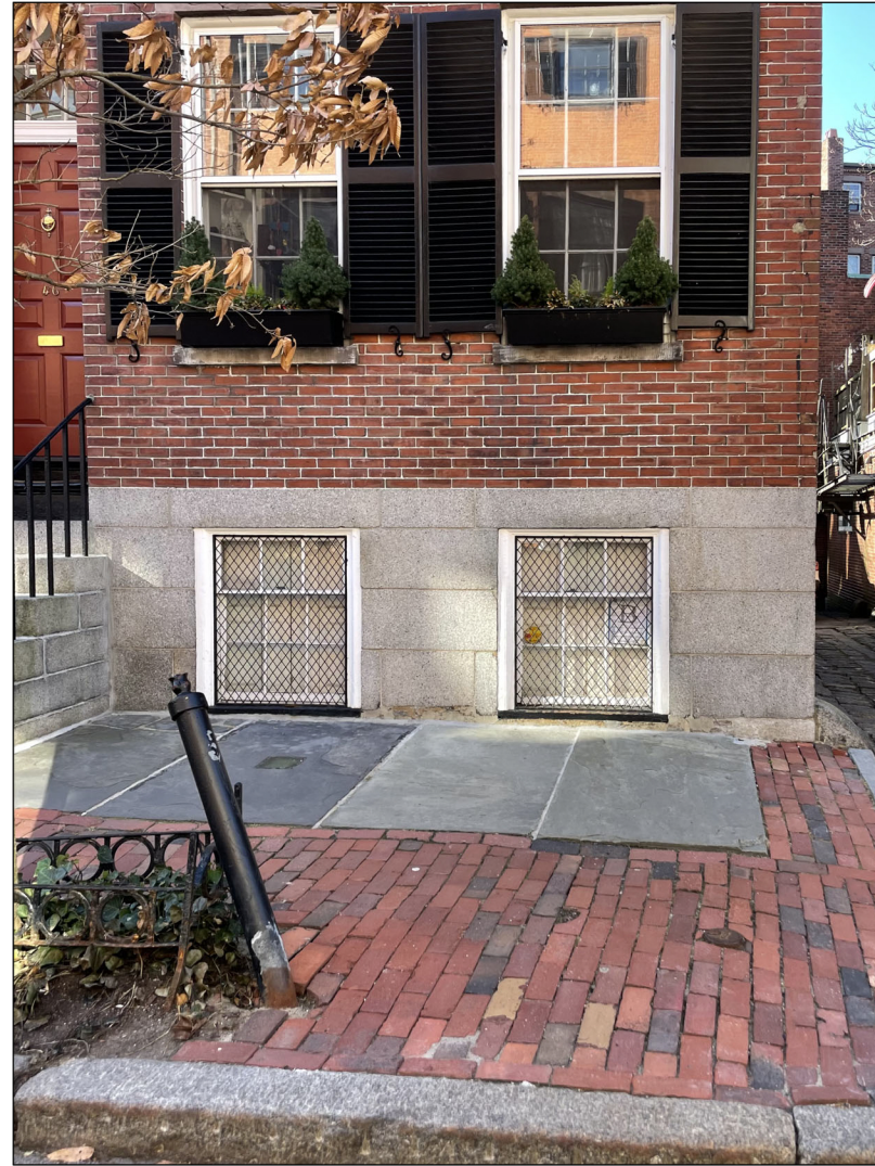
EXISTING FRONT WINDOWS