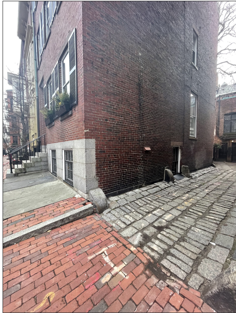
EXISTING FRONT AND ALLEY WINDOWS SEEN FROM PINCKNEY STREET