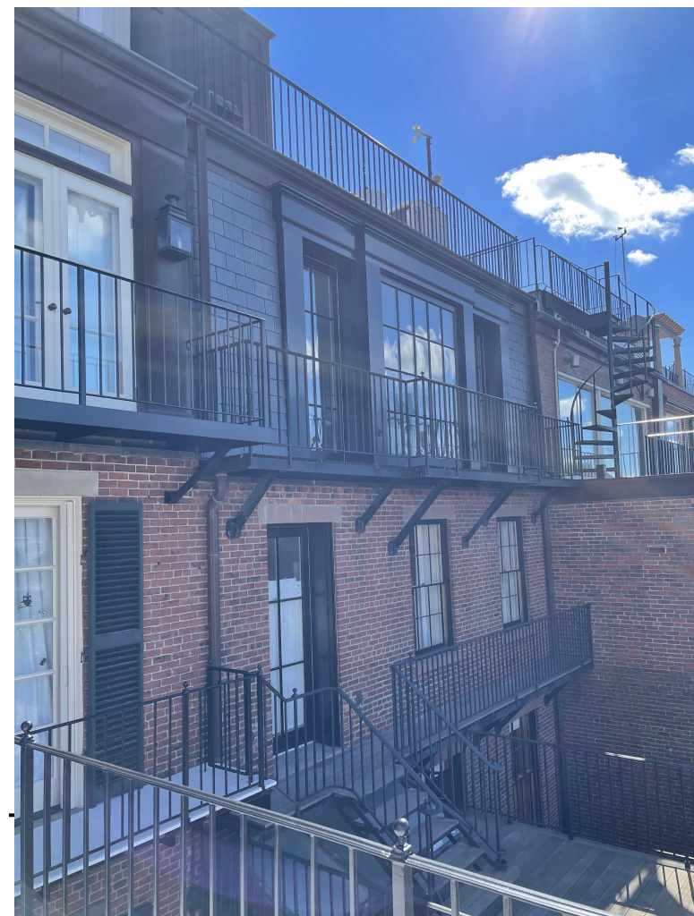
VIEW LOOKING SOUTHEAST FROM ROOF DECK