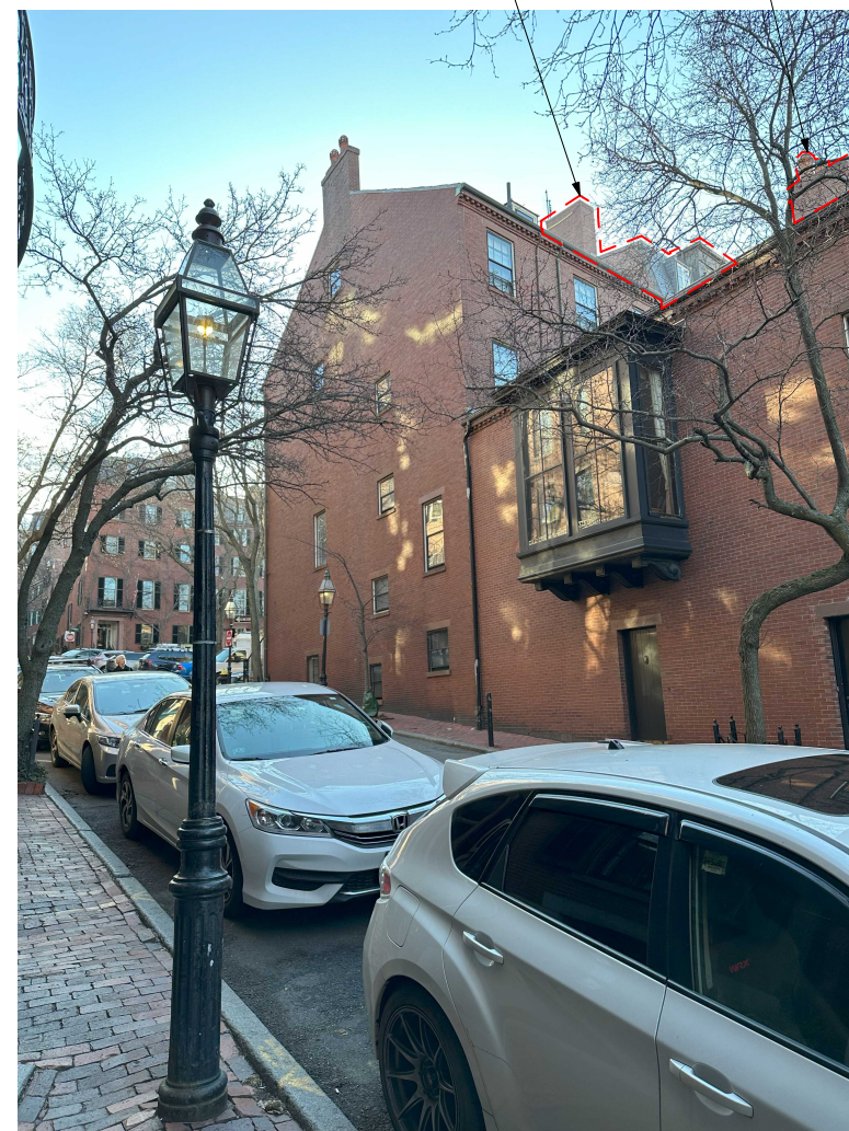
VIEW LOOKING SOUTHEAST FROM PINCKNEY ST.

THIS VISIBLE PORTION OF CHIMNEY IS NOT SUBJECT TO PROPOSED CHANGES THE DASHED LINE INDICATES BUILDING AREA VISIBLE FROM PINCKNEY STREET