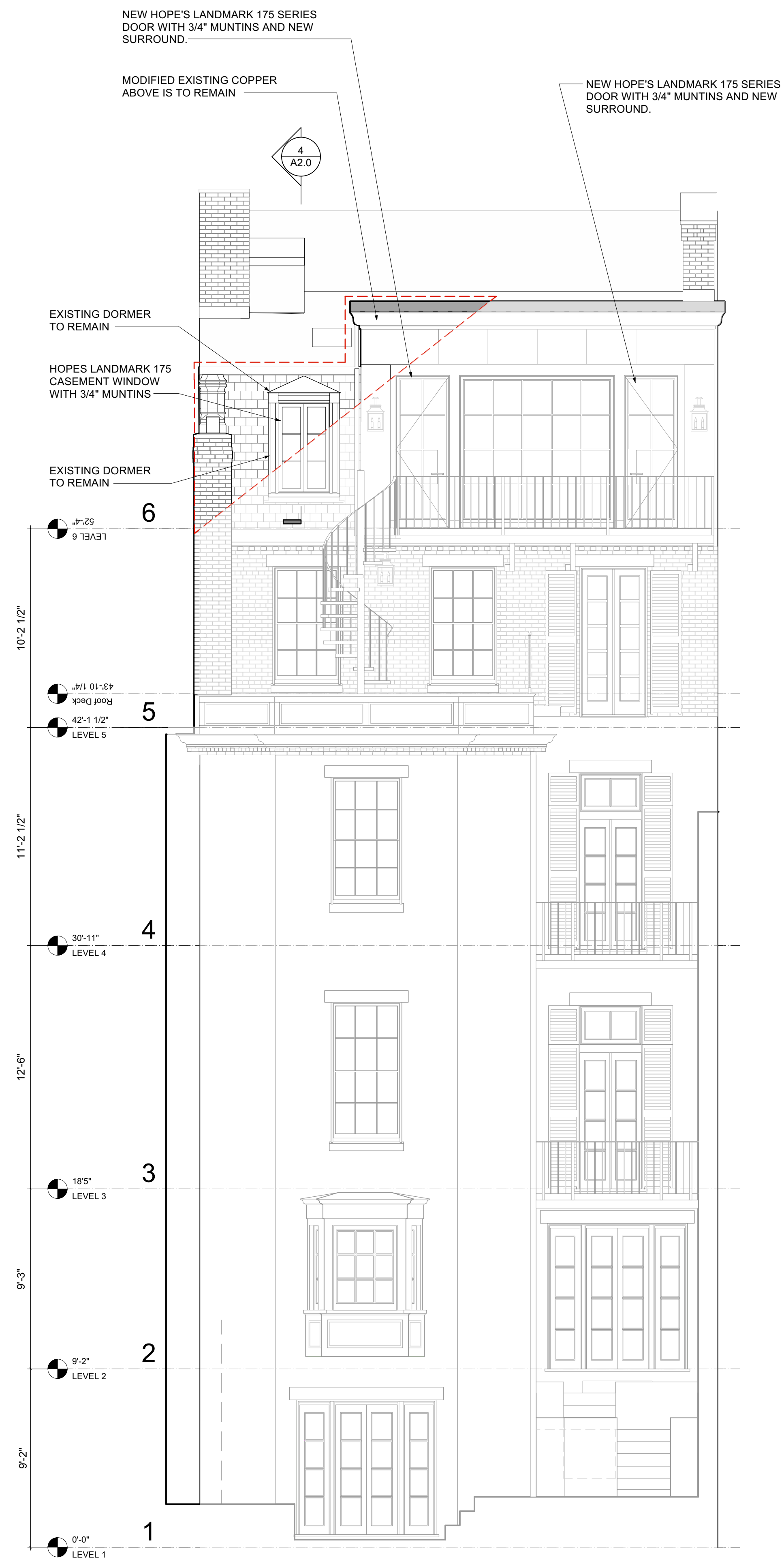
3 PROPOSED REAR ELEVATION - VISIBLE NEW WORK Scale: 1/4" = 1'-0"

Mellows & Paladino inc. Architects 63 South Street / Suite 280 Hopkinton, Massachusetts 01748 508.625.1371