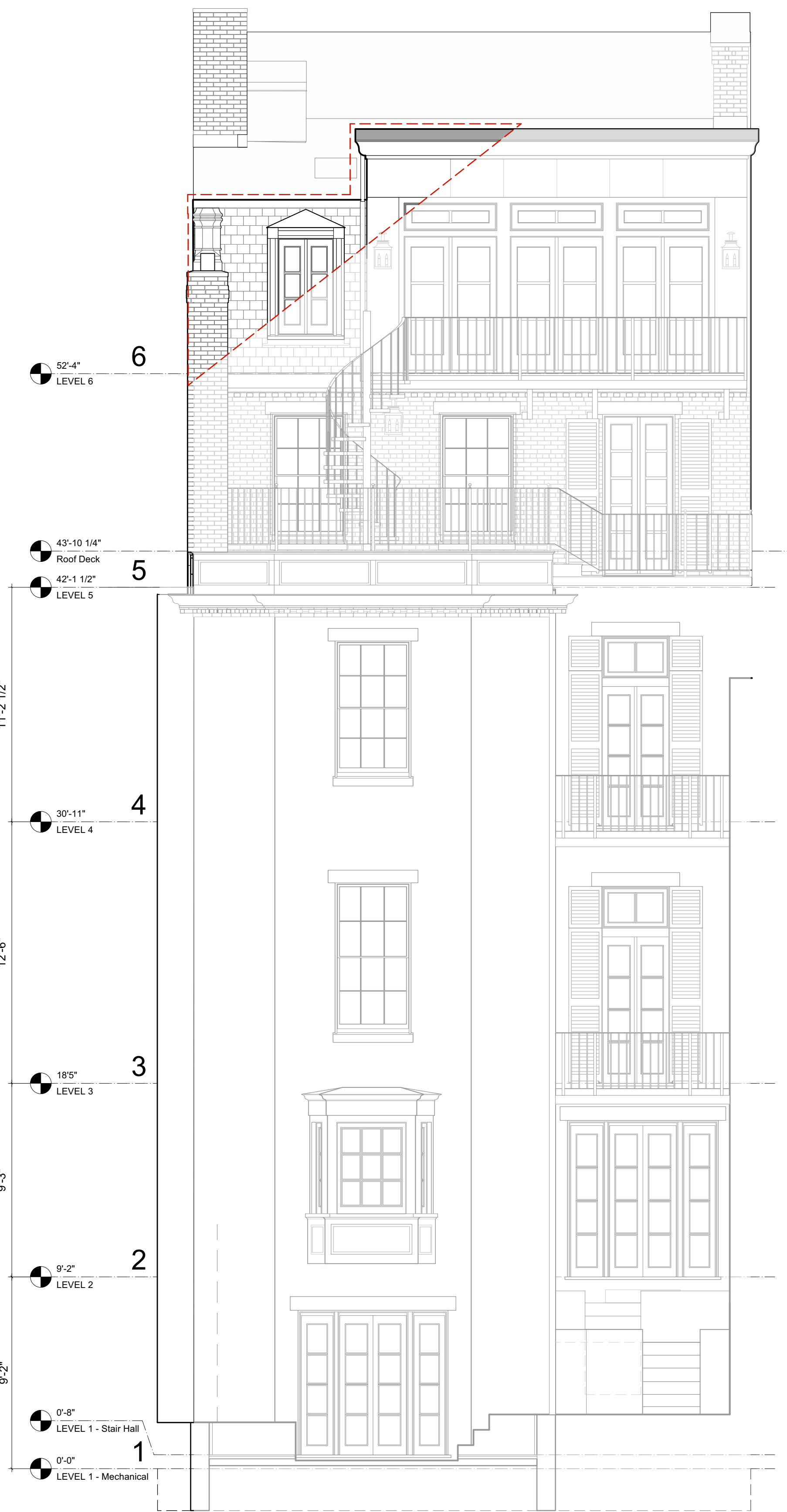
1 EXISTING REAR ELEVATION - VISIBLE WORK AREA Scale: 1/4" = 1'-0"

THIS VISIBLE PORTION OF CHIMNEY IS NOT SUBJECT TO PROPOSED CHANGES THE DASHED LINE INDICATES BUILDING AREA VISIBLE FROM PINCKNEY STREET