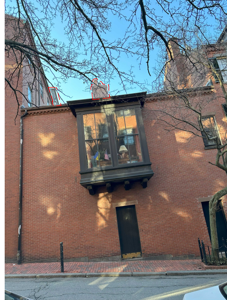
VIEW LOOKING SOUTH FROM PINCKNEY STREET