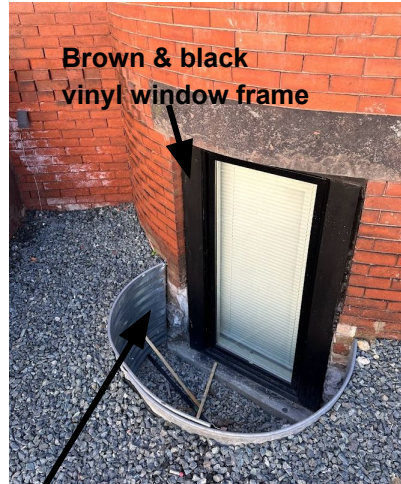
Metal sheet retainer in gravel