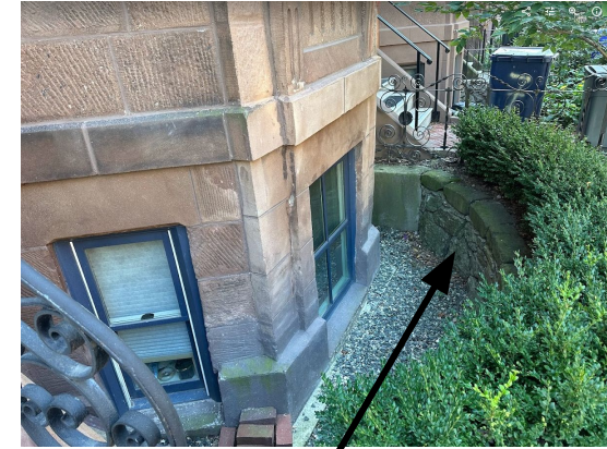
Brick and rocks wall

Note 1: These photos are all from the same street as the applicant. Each house has a unique well design.