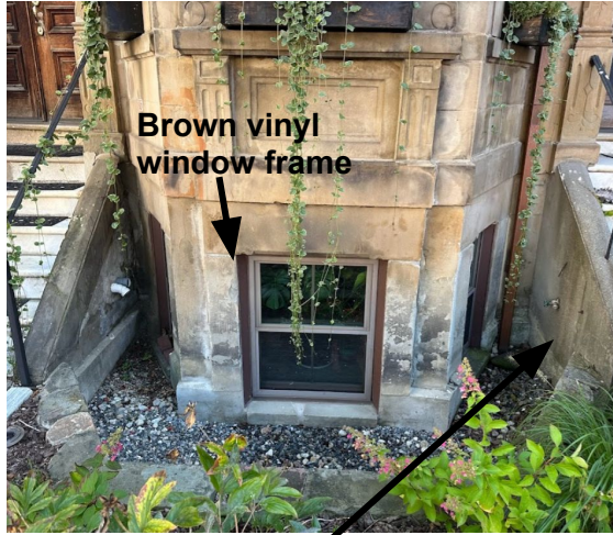
Rock and poured cement wall