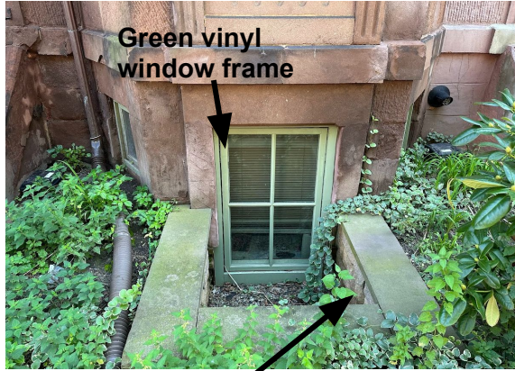
Center block retaining wall