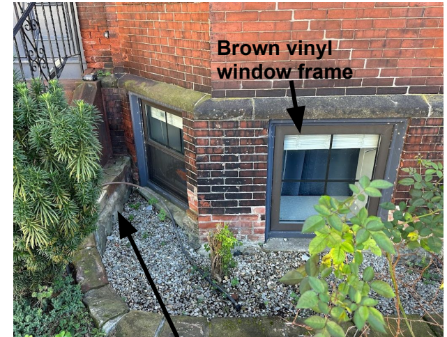
Rock retainer wall

Note 1: On the same street, some of the row houses are red brick and others are brown stone