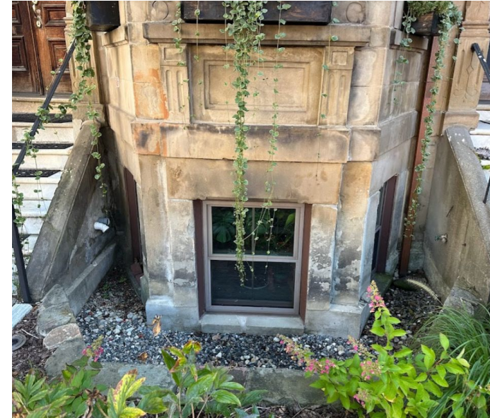
Example: 21 Wigglesworth Street