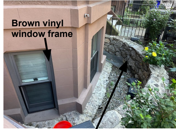
Natural stone wall