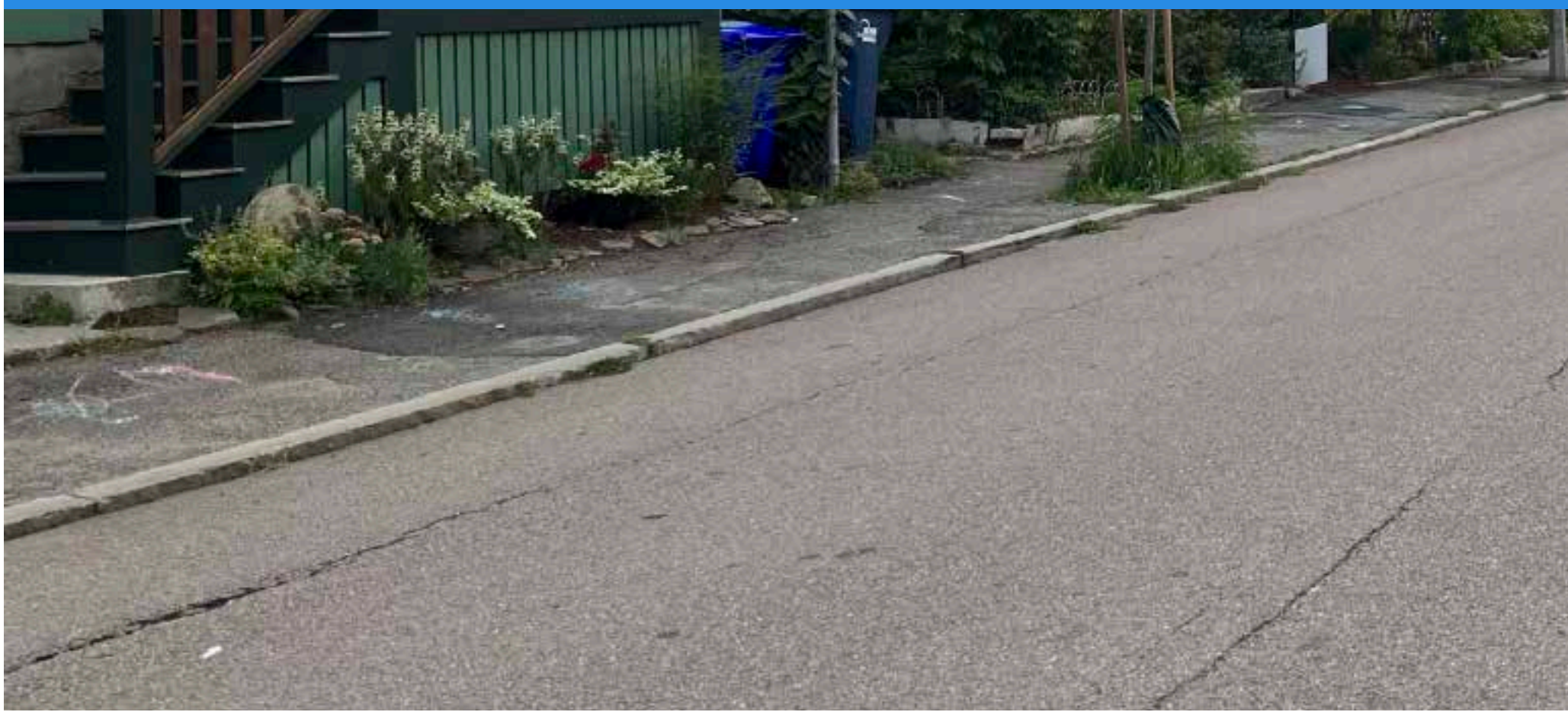
Condition of existing asphalt sidewalks on McBride Street

People are already biking contraflow on McBride Street. 1 in 4 bicyclists on McBride Street ride contraflow.