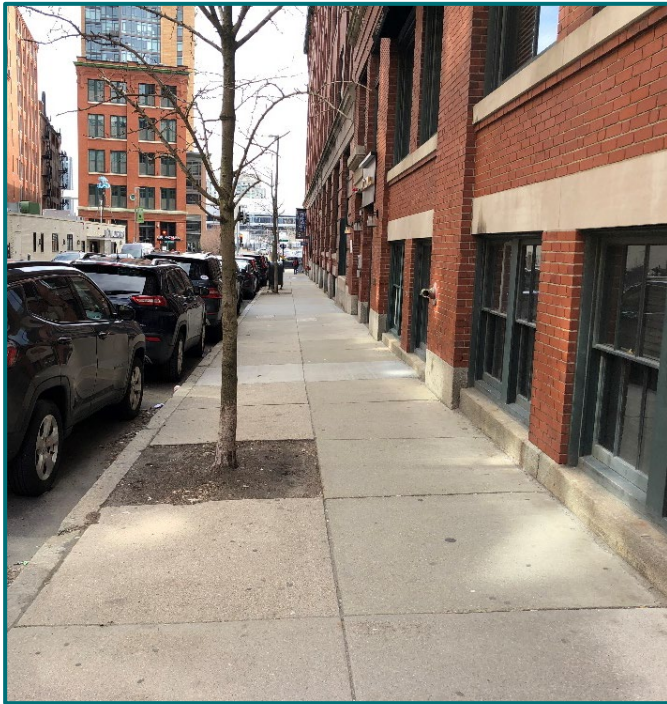
Existing Melcher Street tree pits.