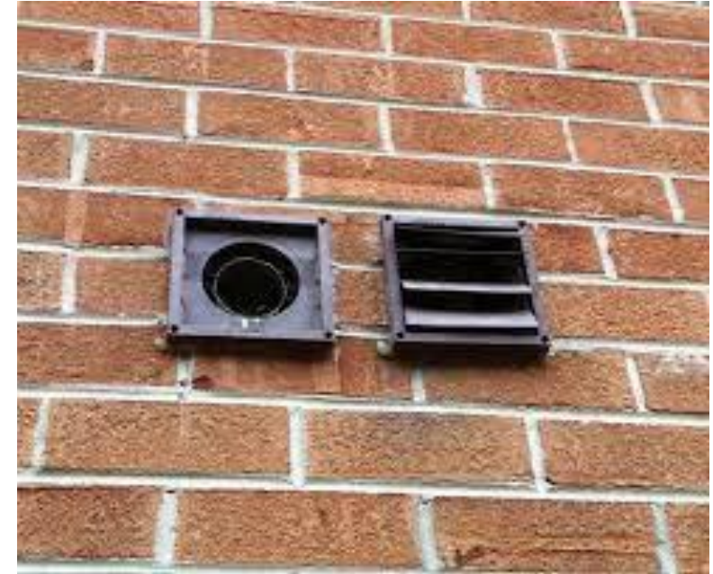
VENT TYPE/STYLE ALTERNATIVES