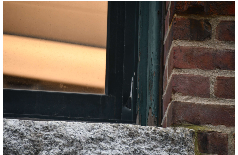
Close-up of existing wood molding. Front Elevation left and Rear Elevation right.