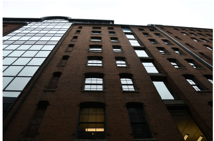
Rear Alley Elevation