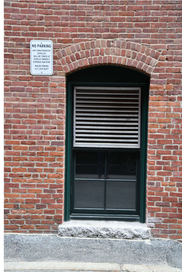
Aluminum window panning trim installed over original wood trim; Window Mockup