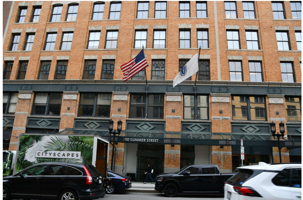
Front Elevation (Summer Street)