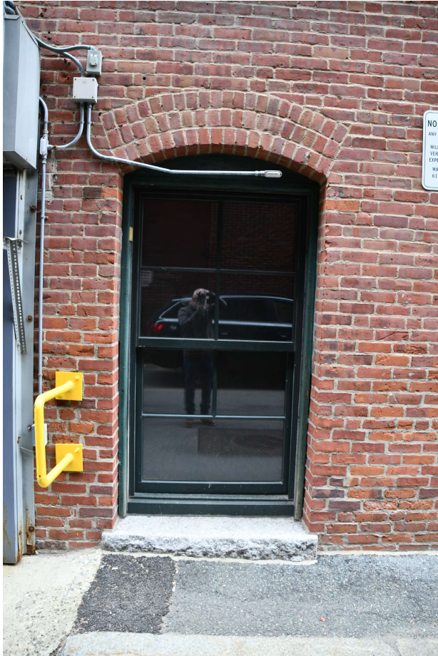
Existing wood trim surrounding the aluminum window systems.