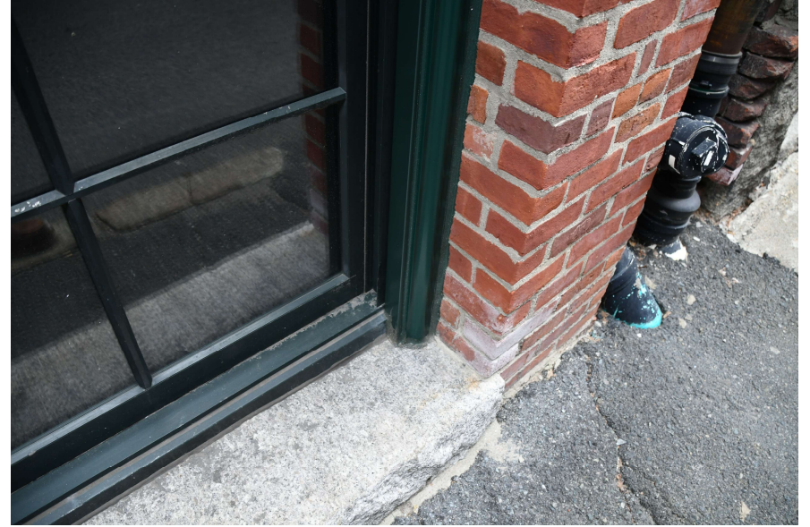
Close-up photograph of aluminum trim mockup