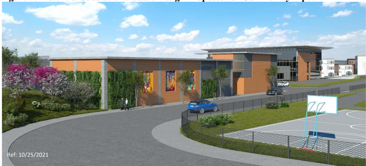
Figure 2: Potential Substation Facade Design Proposed for Community Input

Note: This is a Design concept only. The final design will be chosen in collaboration with the community and may vary.