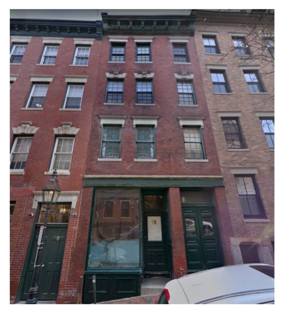
EXISTING FRONT FACADE