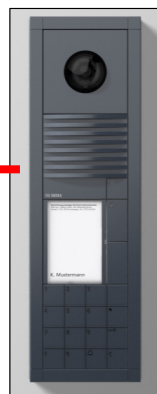
SIEDLE INTERCOM/CAMERA HOUSING 5.25" x 17" x 1 3/8" 'MICACEOUS DARK GREY COLOR (DB 703)