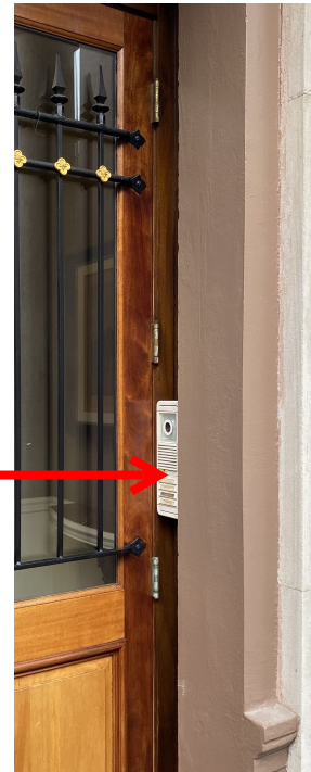
#23 MARLBOROUGH STREET Existing Intercom