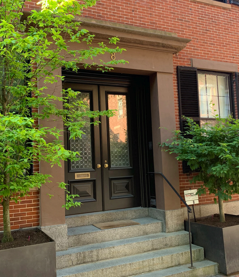
EXISTING PAINTED DOOR PRECEDENCE: with Benjamin Moore Black 2132-10