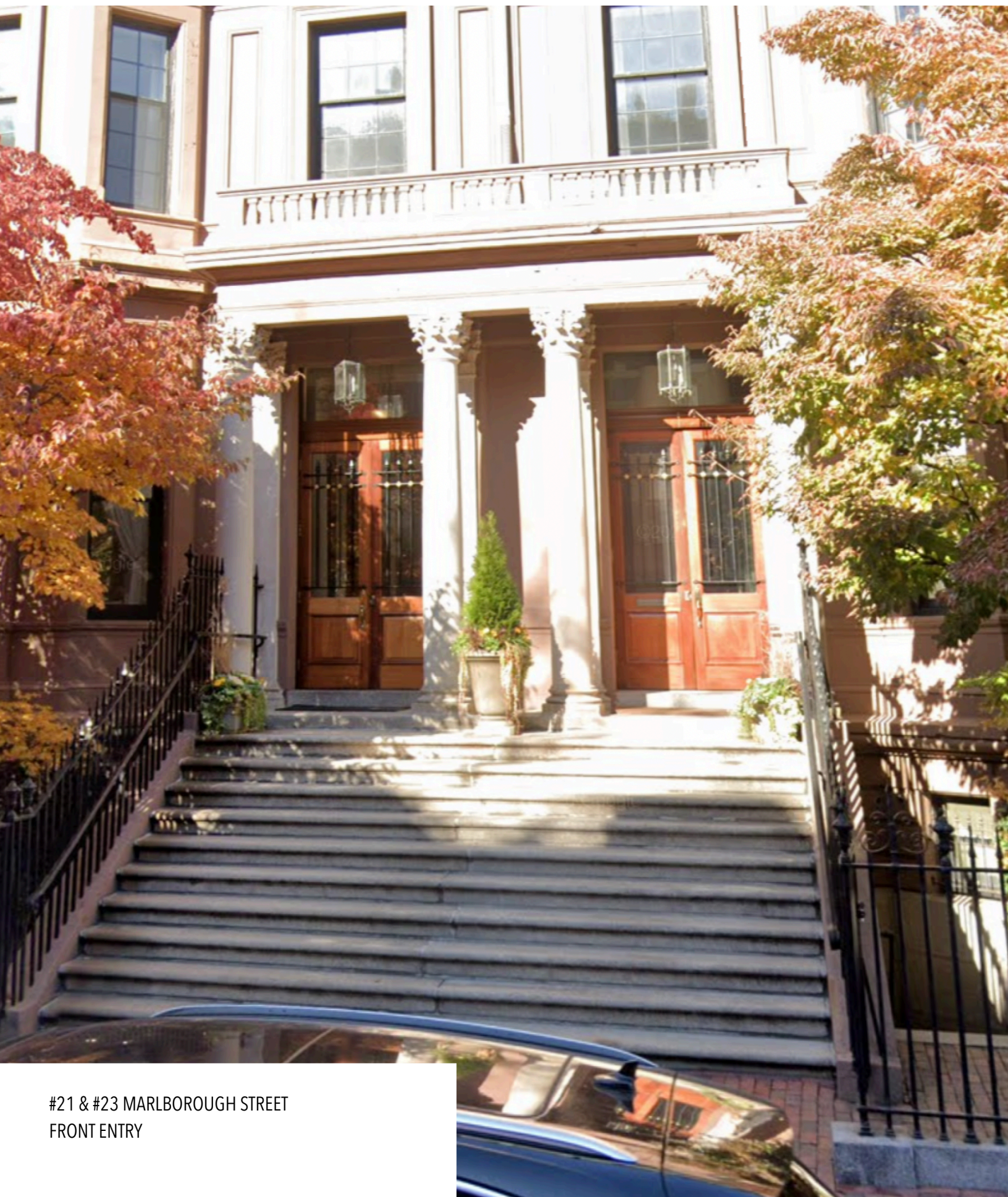
#21 & #23 MARLBOROUGH STREET FRONT ENTRY