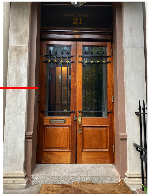
#21 MARLBOROUGH STREET Front Entry Intercom Replacement Location (Siedle Info next page)