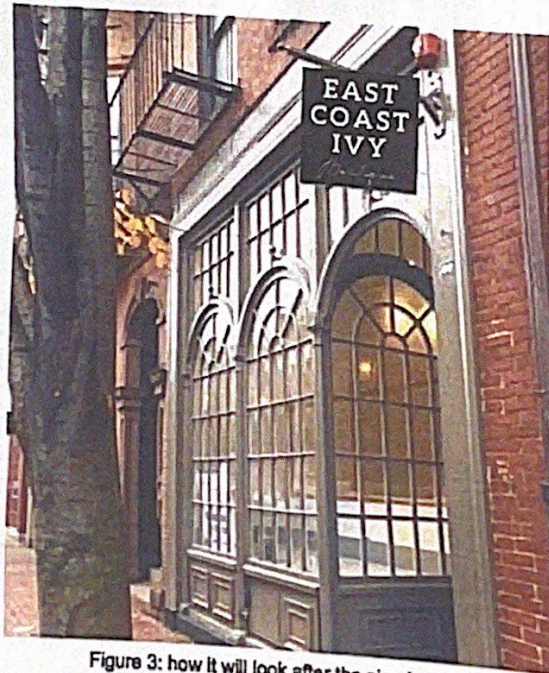
Figure 3: how it will look after the sign is hung (This will be before July 10th 2021 because that is the grand opening date of the store)