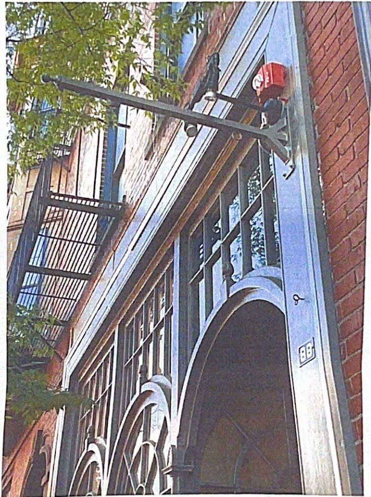
FIGURE 4: close up picture of the sign including the lights that were already there

Greta Belsole x East Coast Ivy Boutique x 88 Charles Street Boston MA 02114