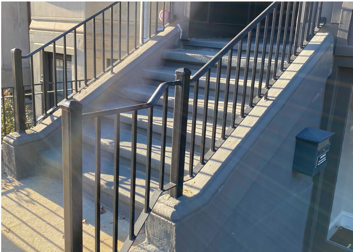
EXISTING RAILING @ 555 COLUMBUS AVE