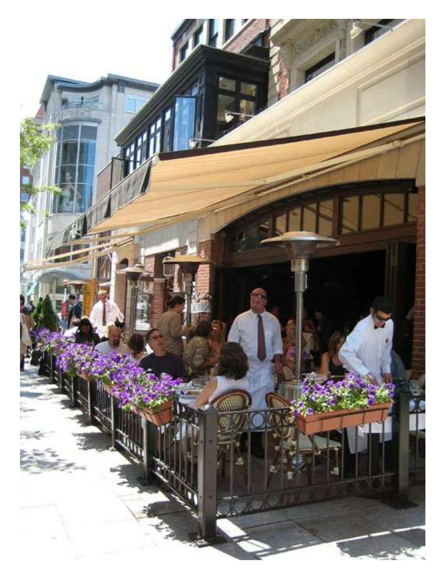
ABE & LOUIE'S 793 BOYLSTON ST, BOSTON, MA 02116