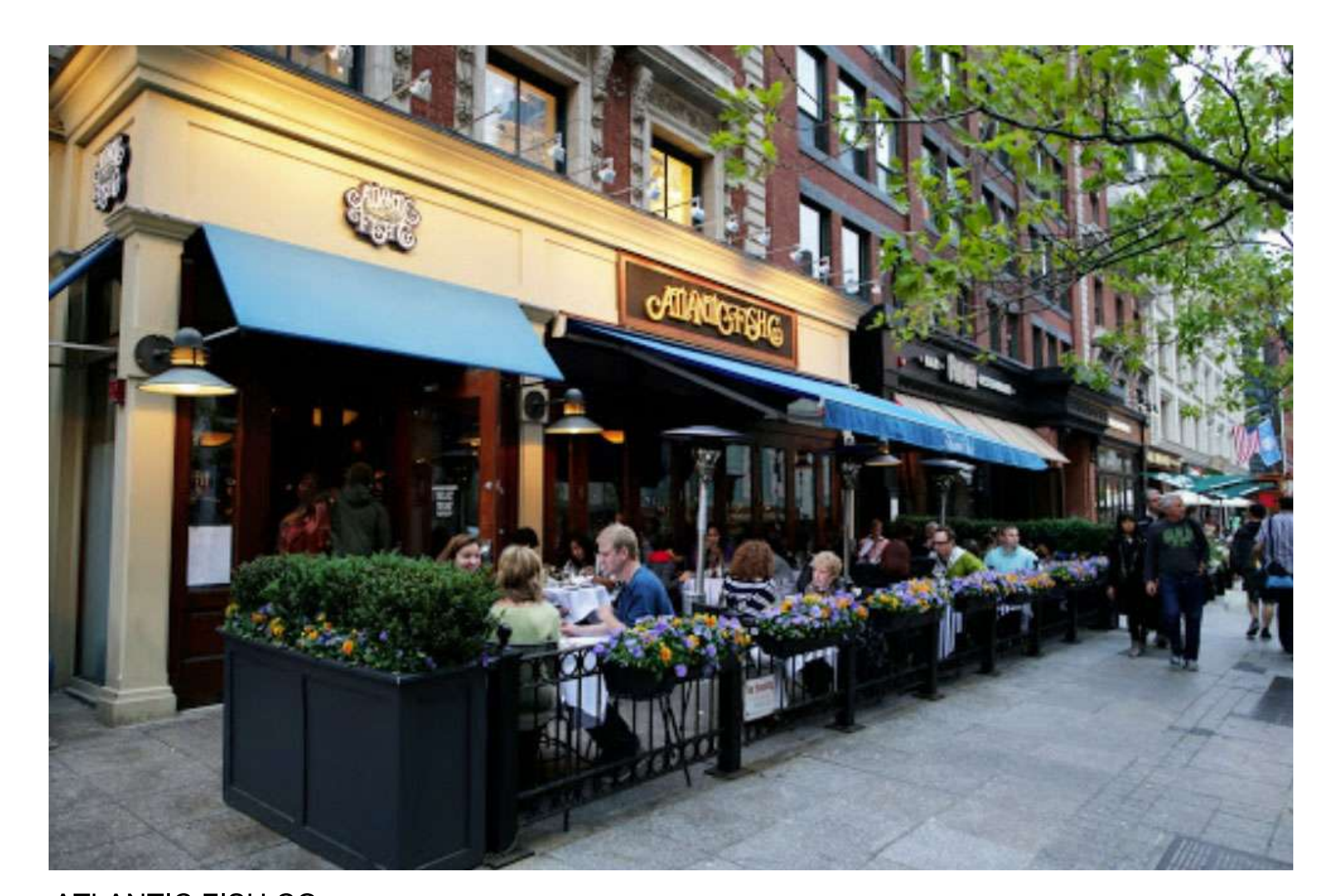
ATLANTIC FISH CO 761 BOYLSTON ST, BOSTON, MA 02116