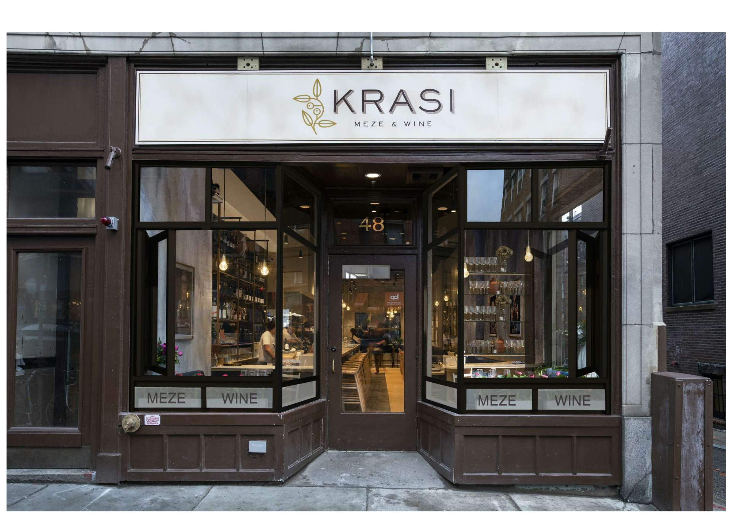
STOREFRONT OPEN RENDERING