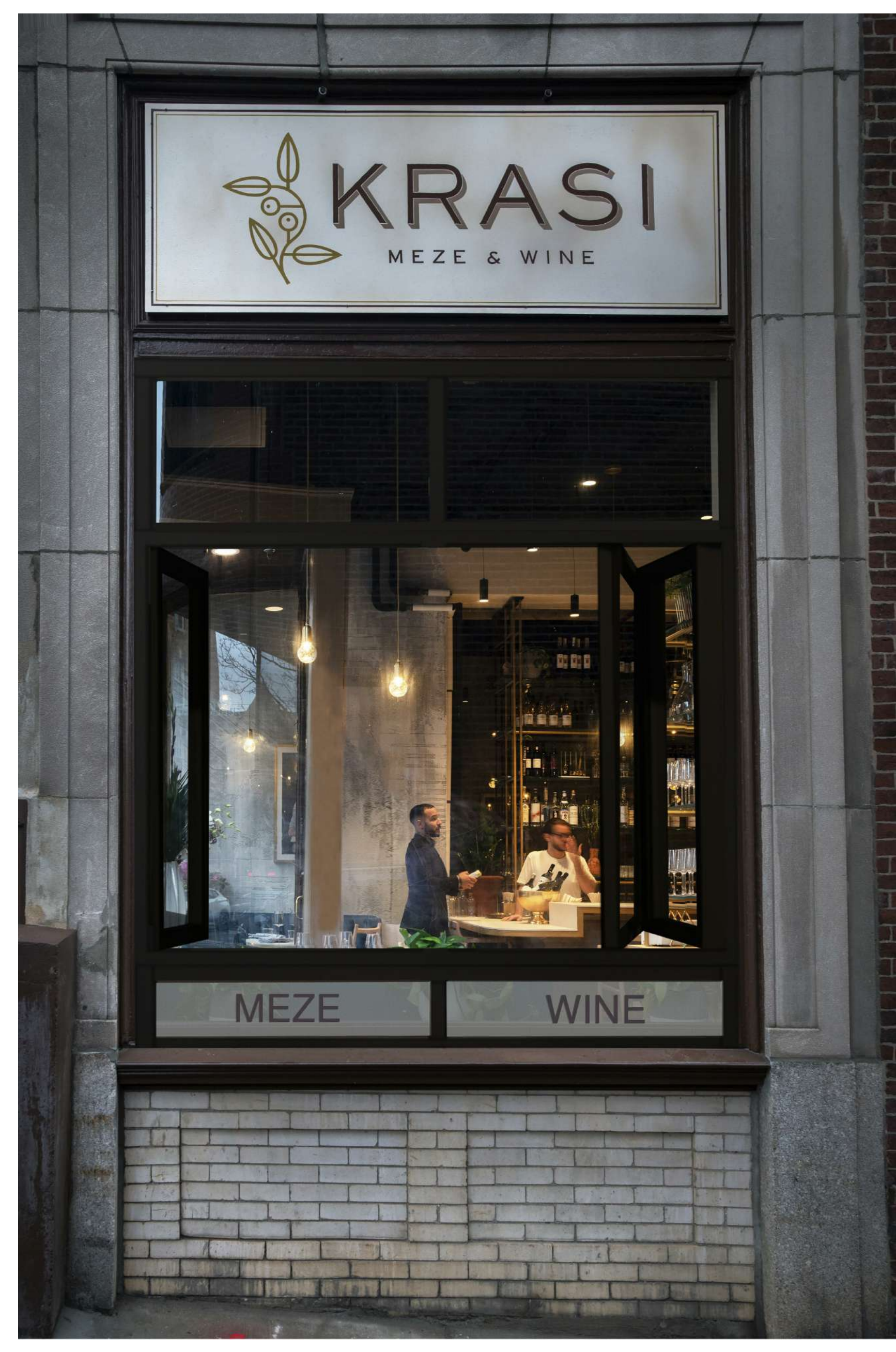
SIDE VIEW OPEN RENDERING