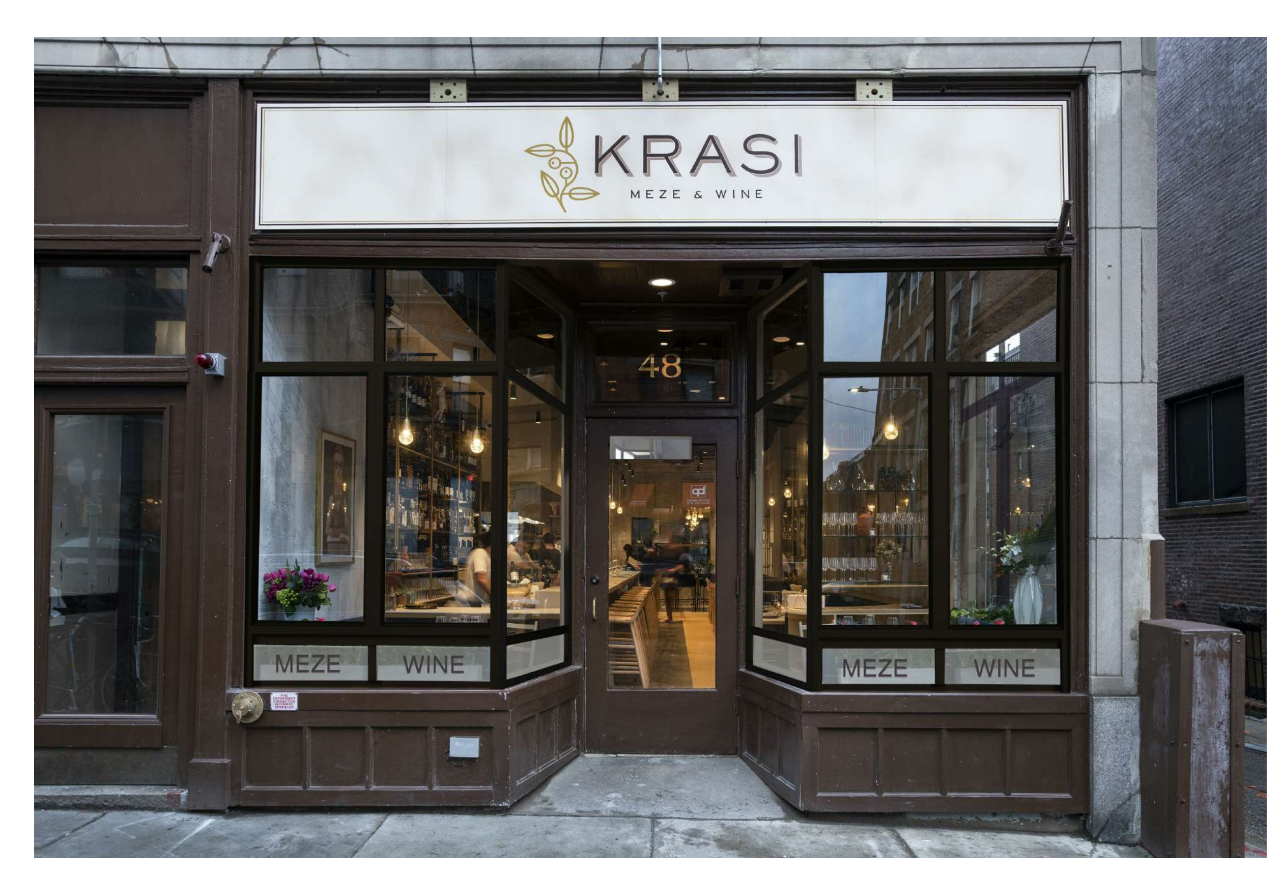
STOREFRONT CLOSED RENDERING