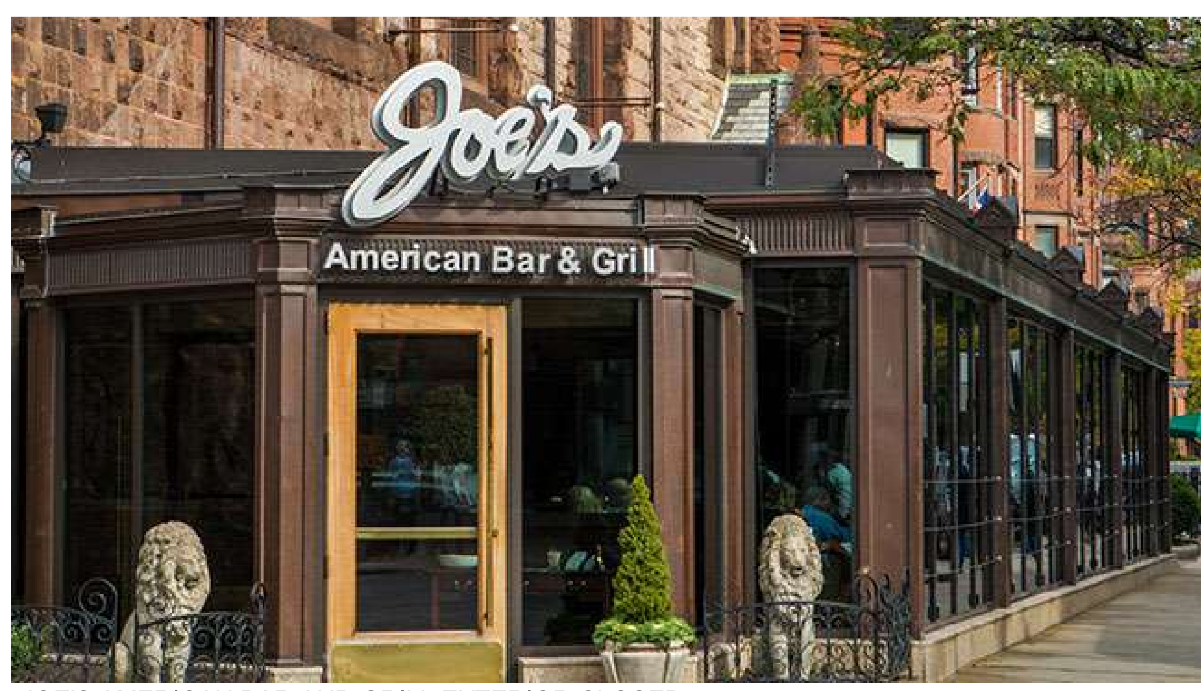
JOE'S AMERICAN BAR AND GRILL EXTERIOR CLOSED 181 NEWBURY ST, BOSTON, MA 02116