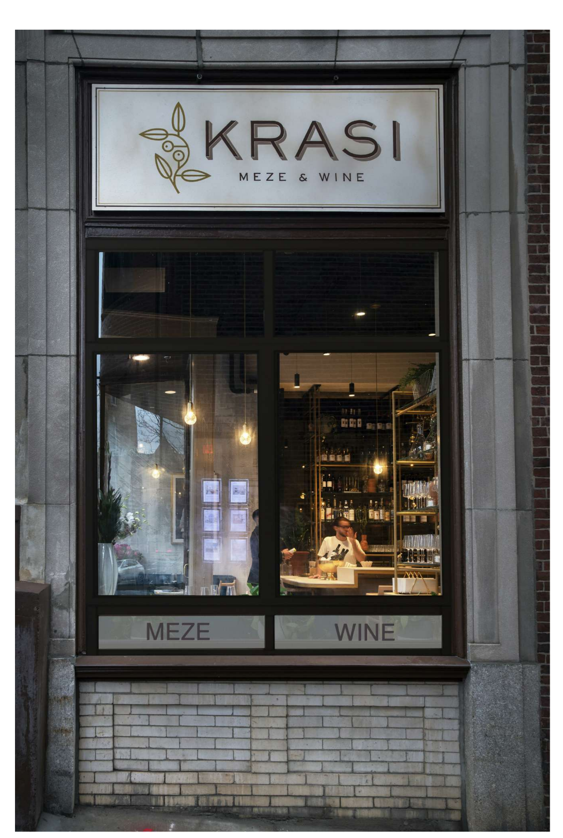
SIDE VIEW CLOSED RENDERING