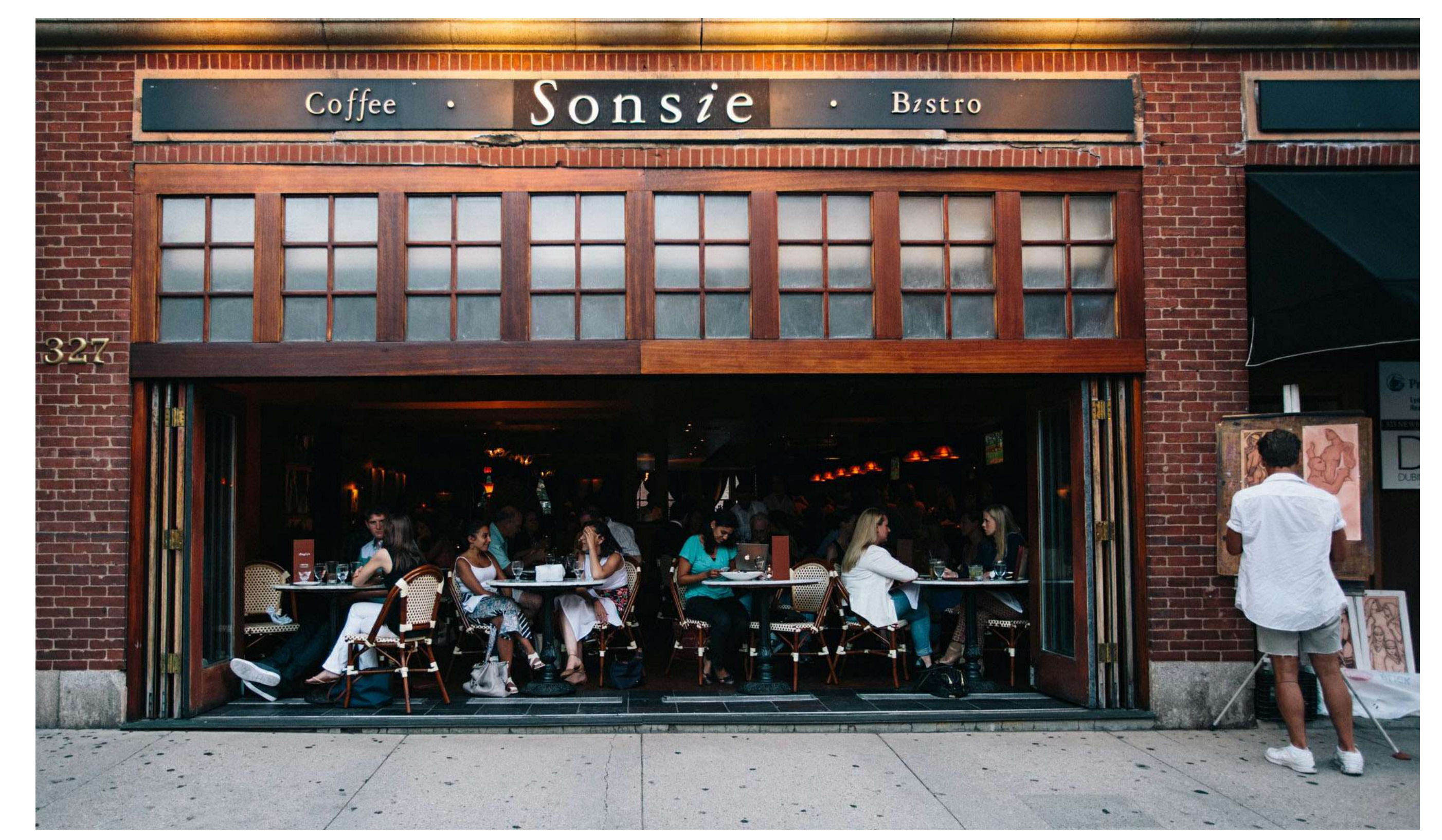
SONSIE EXTERIOR OPEN 338 NEWBURY ST, BOSTON, MA 02115