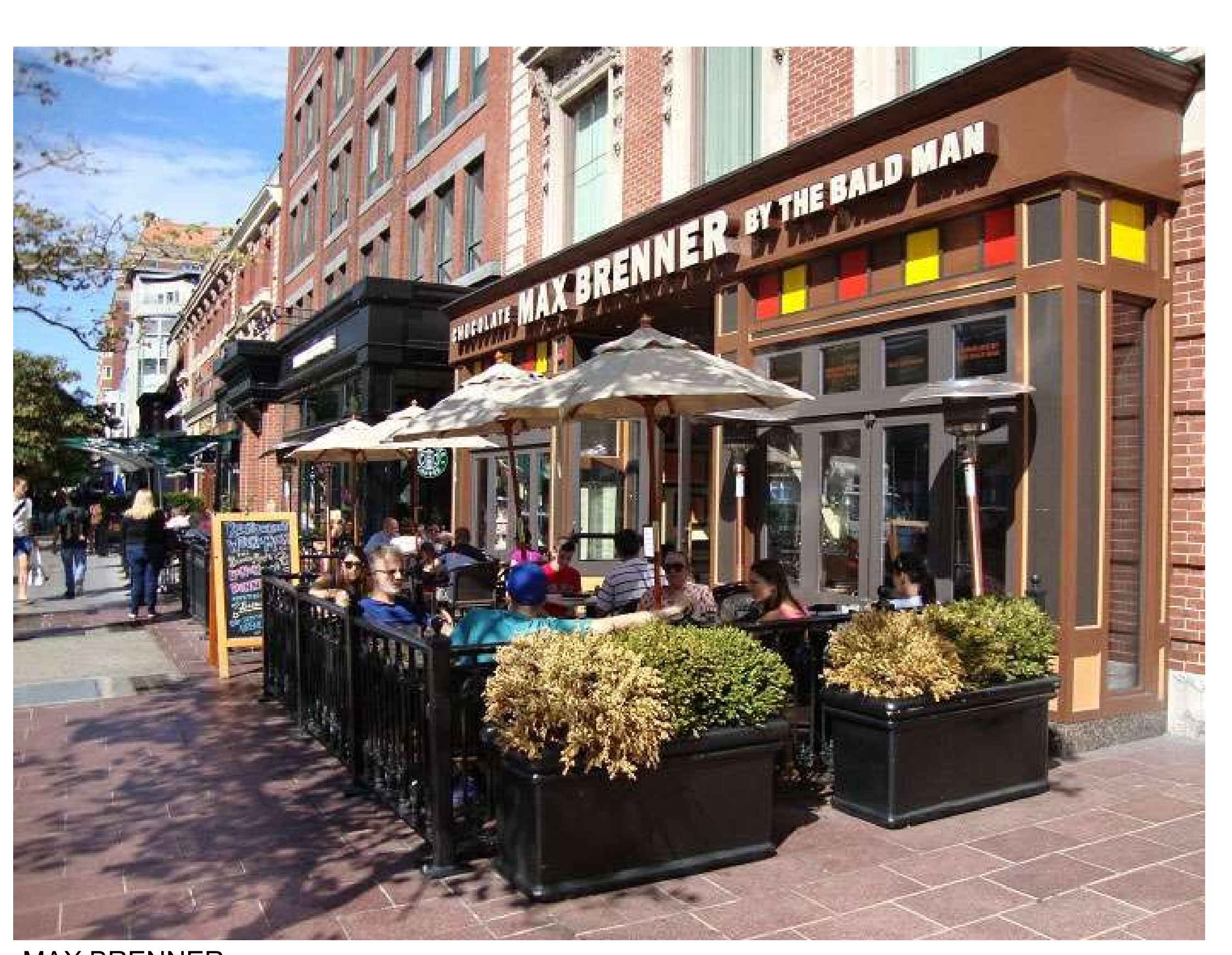
MAX BRENNER 745 BOYLSTON ST, BOSTON, MA 02116