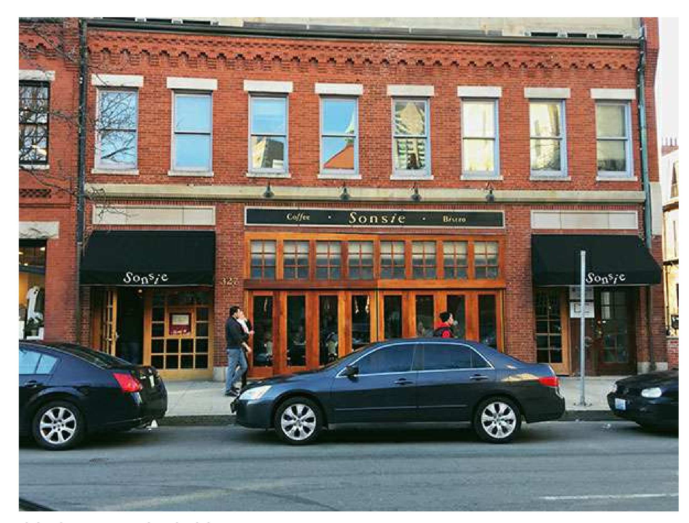
SONSIE EXTERIOR CLOSED 338 NEWBURY ST, BOSTON, MA 02115