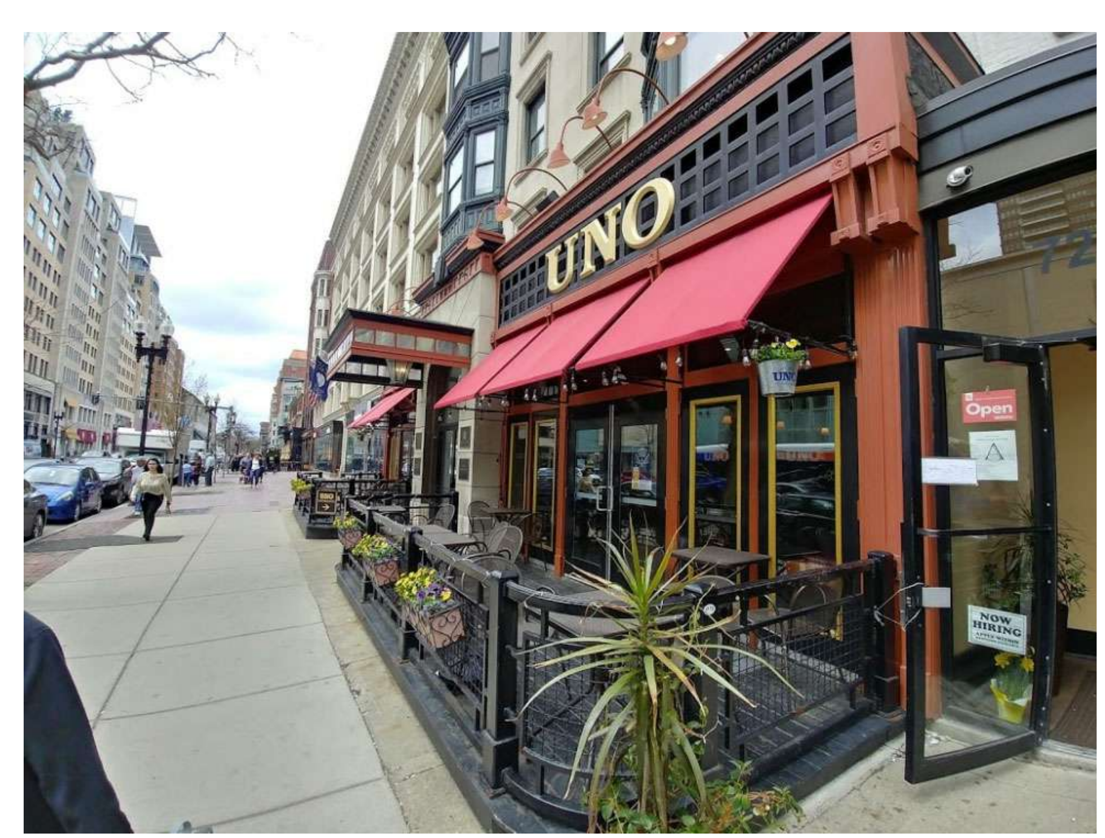
UNO PIZZERIA & GRILL 731 BOYLSTON ST, BOSTON, MA 02116