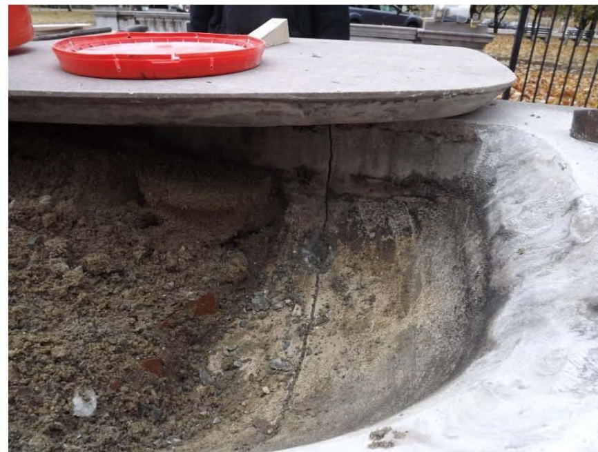
2013: CONSERVATORS REMOVED THE EXISTING GRANITE COVER OF THE HORSE TROUGHS AND RESEALED THE JOINTS.