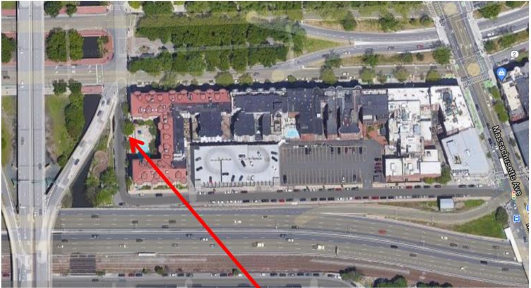
Proposed location of meter on Charlesgate East