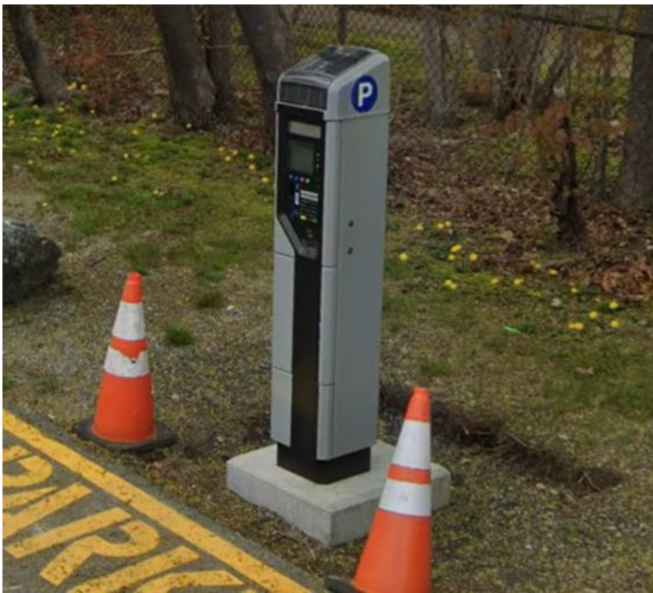
Proposed parking meter design