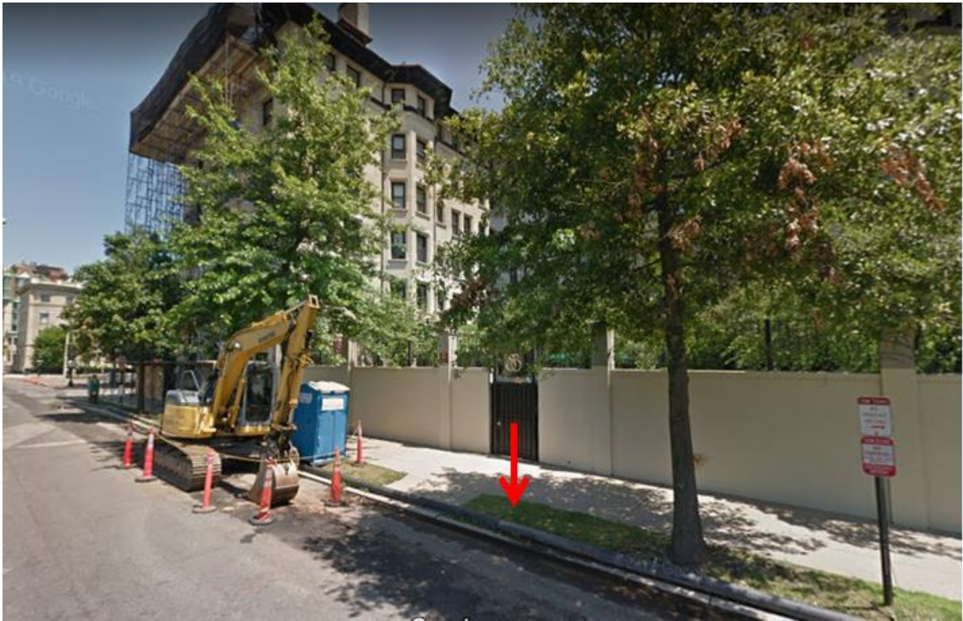
Proposed location of parking meter on Charlesgate East, looking northeast