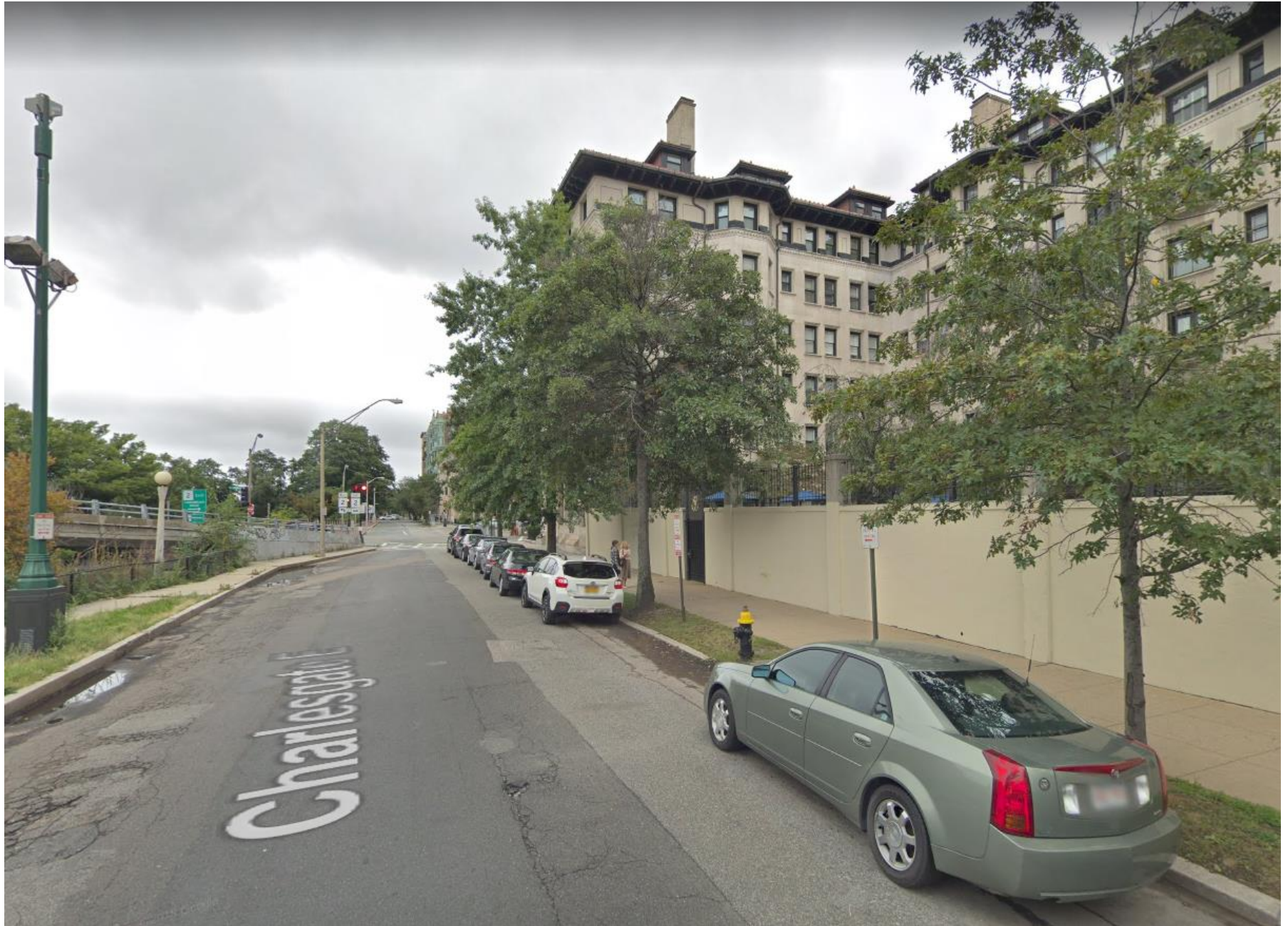
Context view of Charlesgate East, looking north