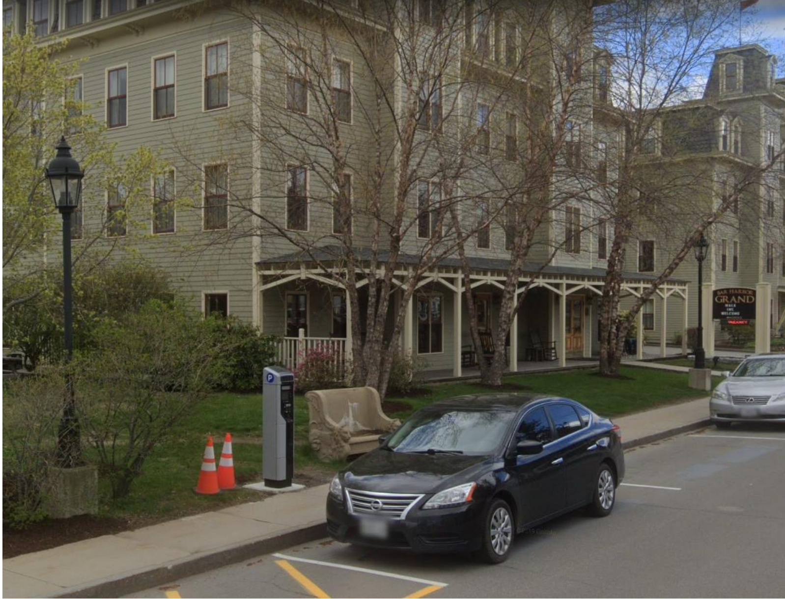
Example of identical meter installed in Bar Harbor, Maine