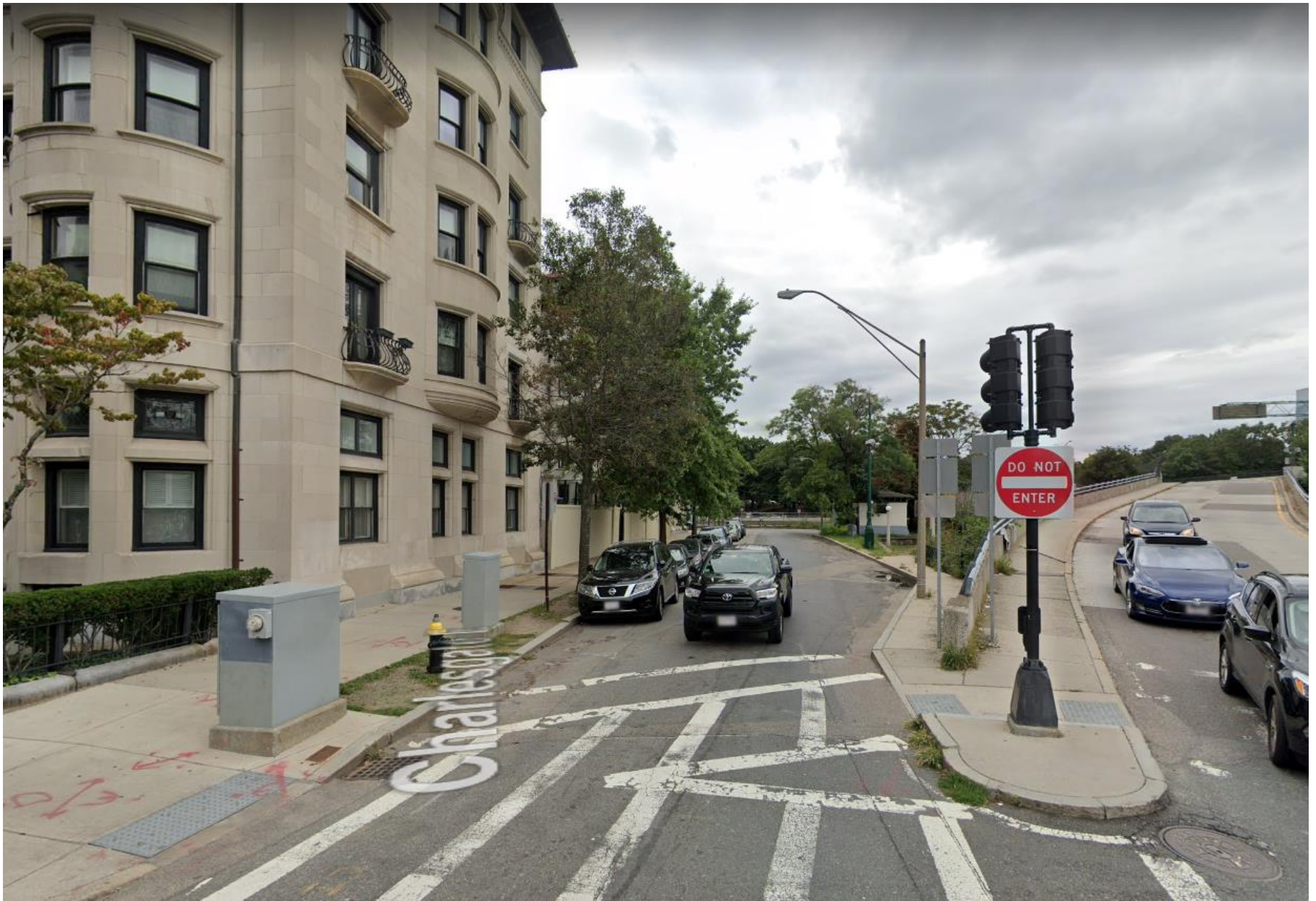
Context view of Charlesgate East, looking south