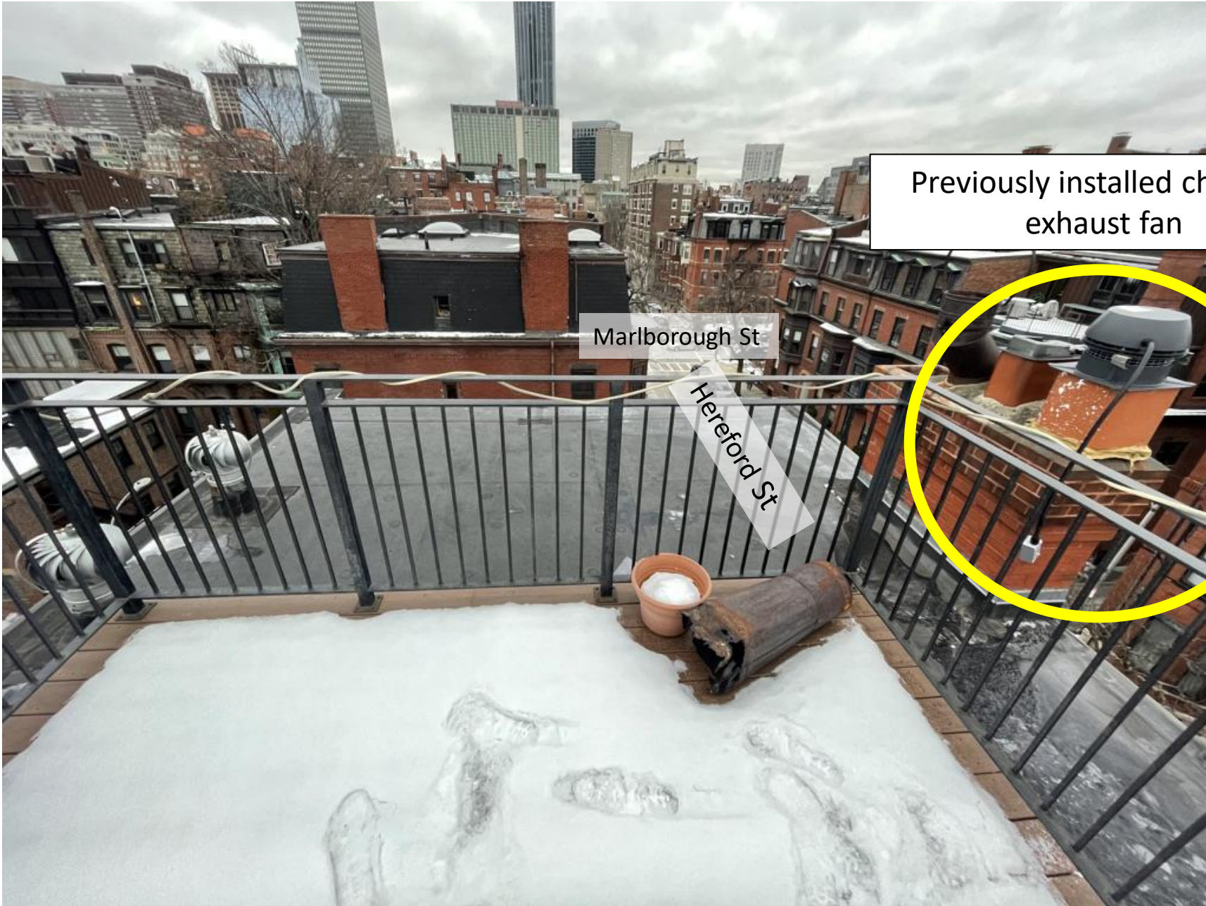
Previously installed chimney exhaust fan