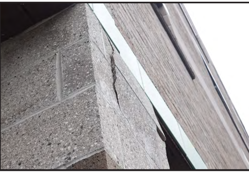
STEEL LINTEL IS RUST JACKING THE MASONRY, OPENING THE BUILDING FACADE FOR WATER AND FREEZE THAW DAMAGE.