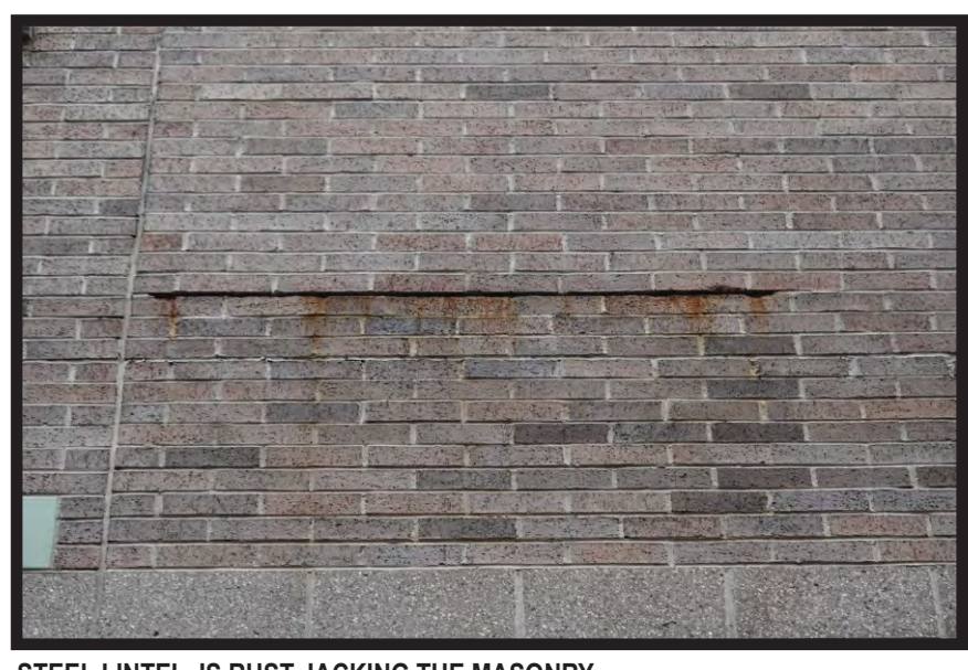
STEEL LINTEL IS RUST JACKING THE MASONRY, OPENING THE BUILDING FACADE FOR WATER AND FREEZE THAW DAMAGE.