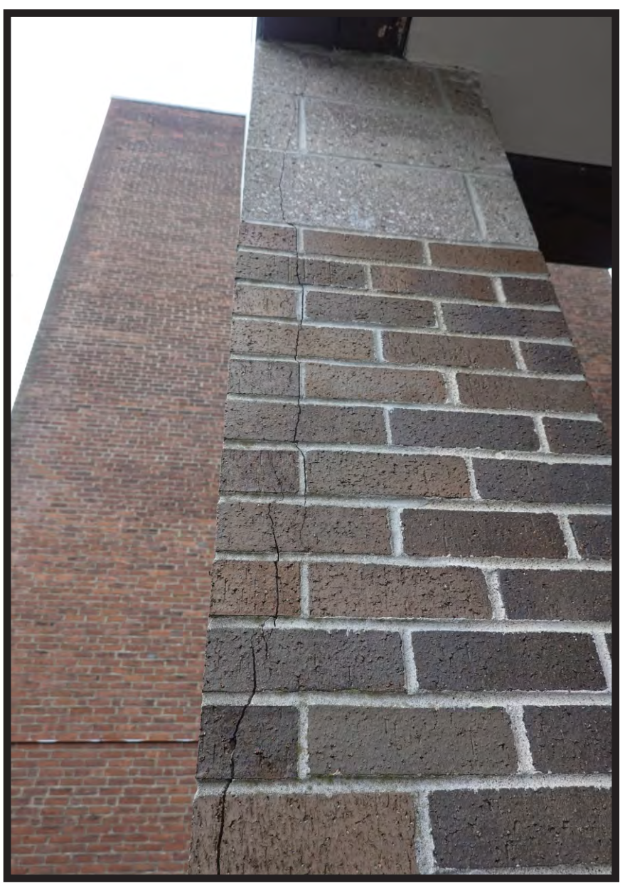
FREEZE THAW FROM ABOVE DAMAGE / RUSTING OF STEEL MEMBERS. OPENING THE BUILDING FACADE FOR WATER AND FREEZE THAW DAMAGE.