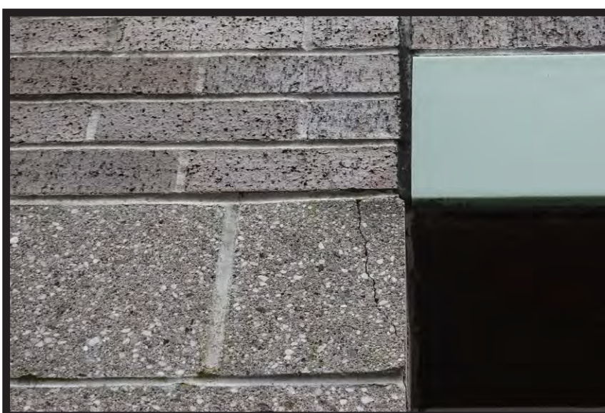
STEEL LINTEL AT WINDOW IS RUST JACKING THE MASONRY, OPENING THE BUILDING FACADE FOR WATER AND FREEZE THAW DAMAGE.

OPENING THE BUILDING FACADE FOR WATER AND FREEZE THAW DAMAGE.