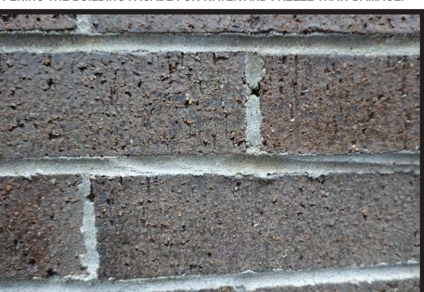
FAILED MORTAR JOINTS, OPENING THE BUILDING FACADE FOR WATER AND FREEZE THAW DAMAGE.