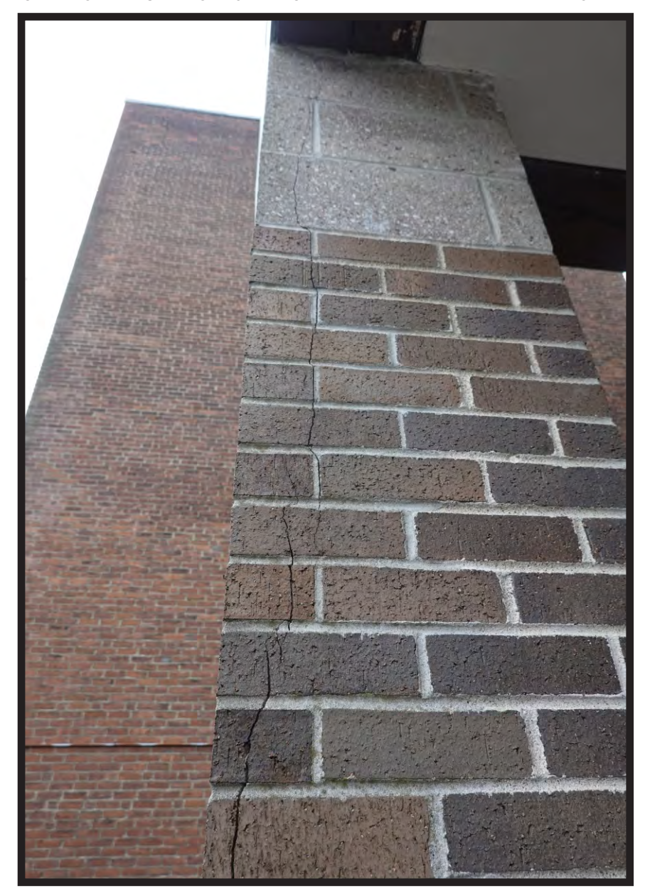
FREEZE THAW FROM ABOVE DAMAGE / RUSTING OF STEEL MEMBERS. OPENING THE BUILDING FACADE FOR WATER AND FREEZE THAW DAMAGE.