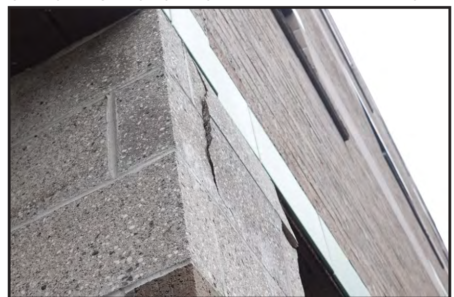
STEEL LINTEL IS RUST JACKING THE MASONRY, OPENING THE BUILDING FACADE FOR WATER AND FREEZE THAW DAMAGE.