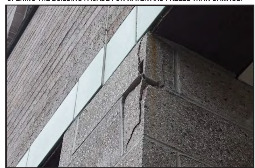
STEEL LINTEL IS RUST JACKING THE MASONRY, OPENING THE BUILDING FACADE FOR WATER AND FREEZE THAW DAMAGE.