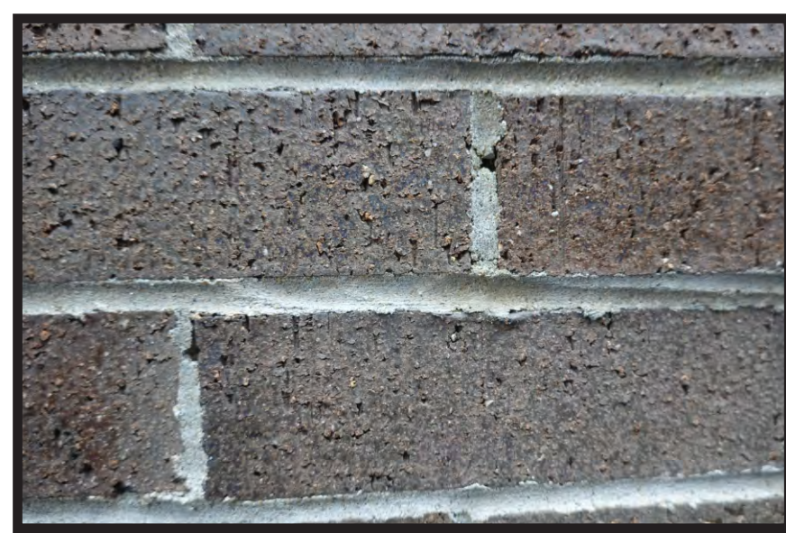
FAILED MORTAR JOINTS, OPENING THE BUILDING FACADE FOR WATER AND FREEZE THAW DAMAGE.