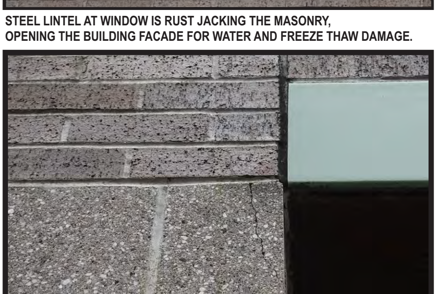
STEEL LINTEL AT WINDOW IS RUST JACKING THE MASONRY, OPENING THE BUILDING FACADE FOR WATER AND FREEZE THAW DAMAGE.