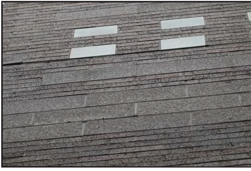
FAILED SEALANT JOINT, OPENING THE BUILDING FACADE FOR WATER AND FREEZE THAW DAMAGE.