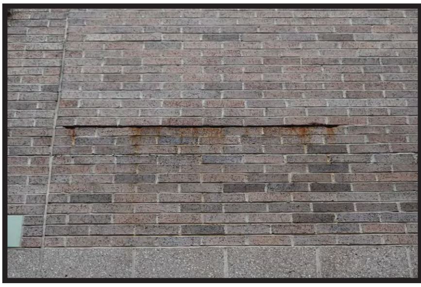
STEEL LINTEL IS RUST JACKING THE MASONRY, OPENING THE BUILDING FACADE FOR WATER AND FREEZE THAW DAMAGE.