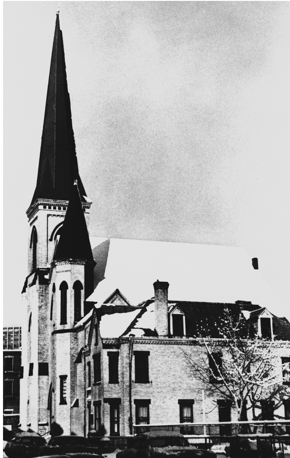
Parsonage and church (in snow) from West Newton St (date unknown)