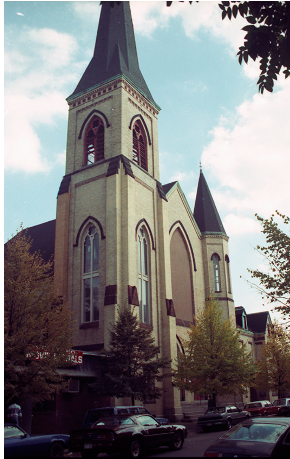
Northwest corner of church from Tremont St before mural painted (ca. 1988)