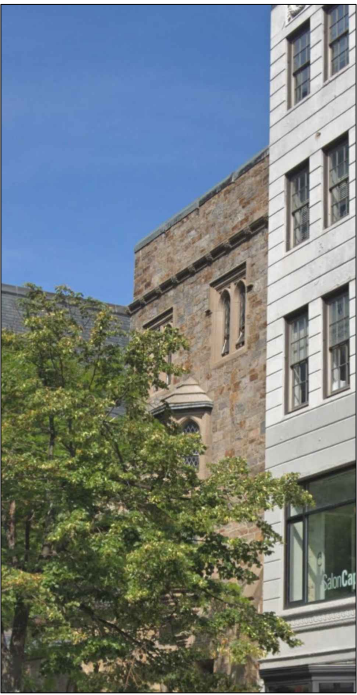
-- STREET VIEW - NO VISIBILITY NTS