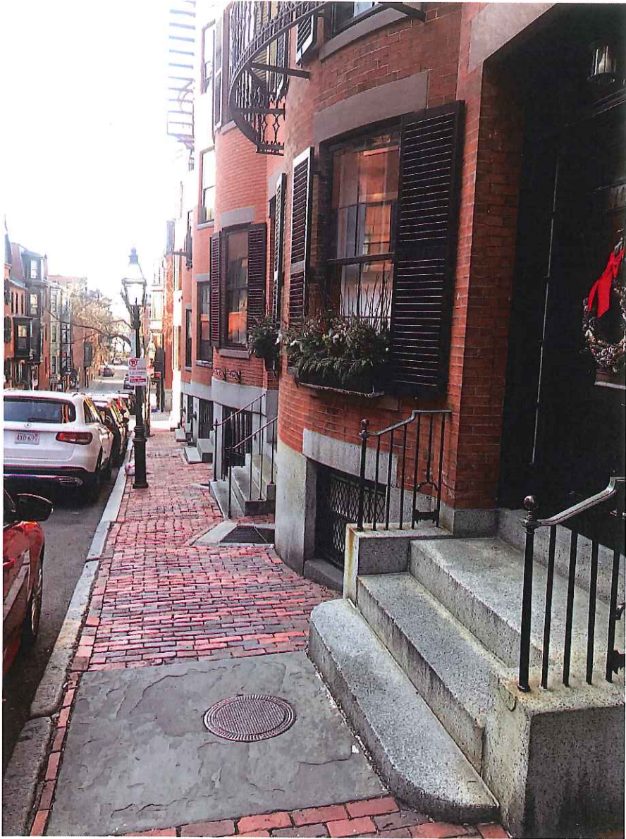
Railing examples at 101 and 103 Pinckney (neighboring properties)