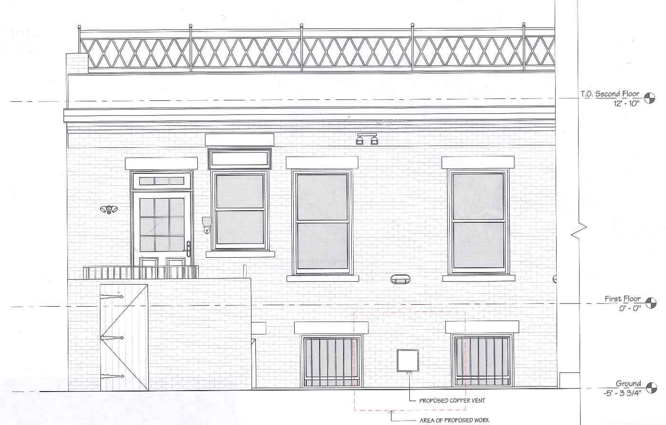
1 Proposed North Elevation 3/8" = 1'-0"