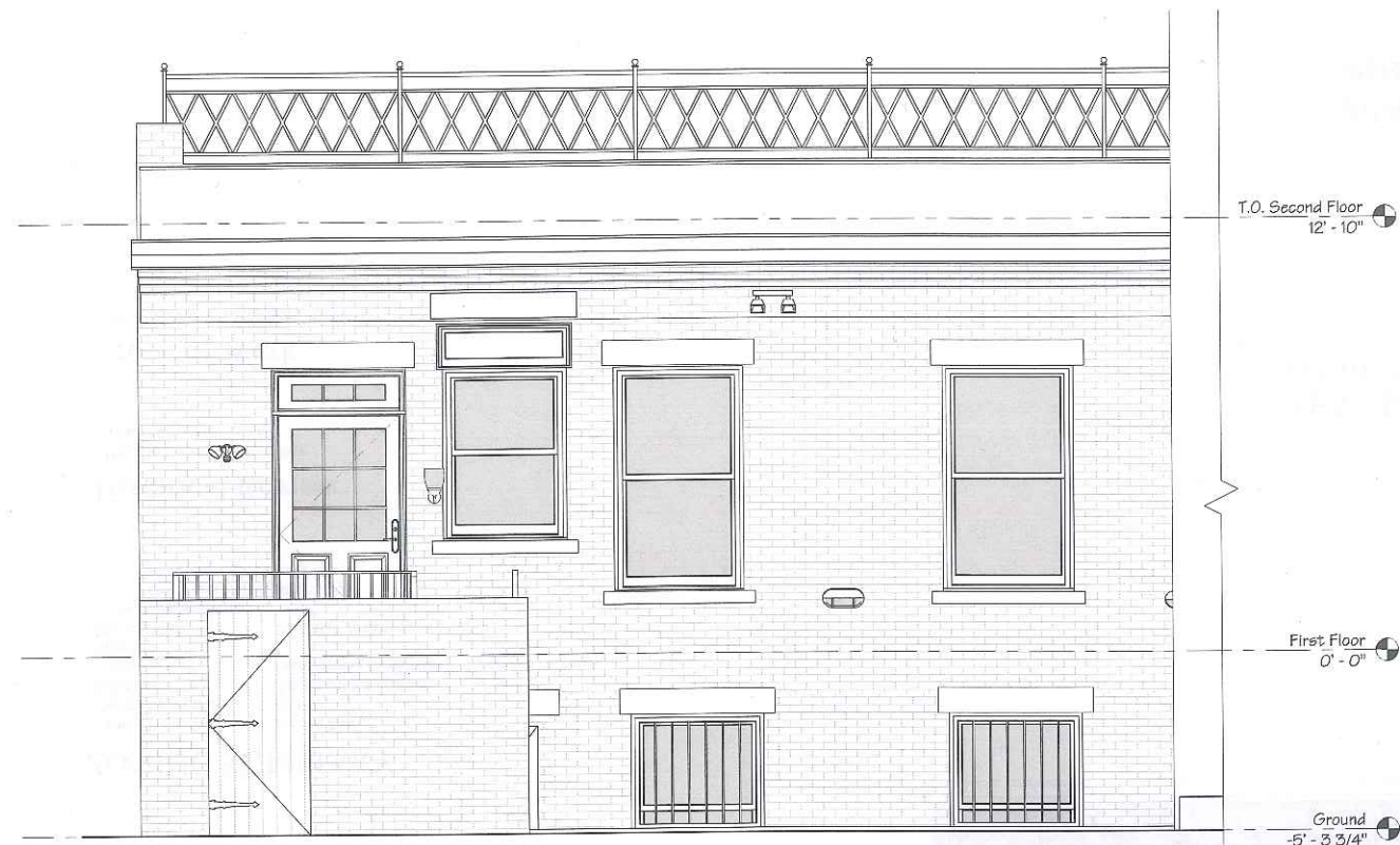
3 Existing North Elevation