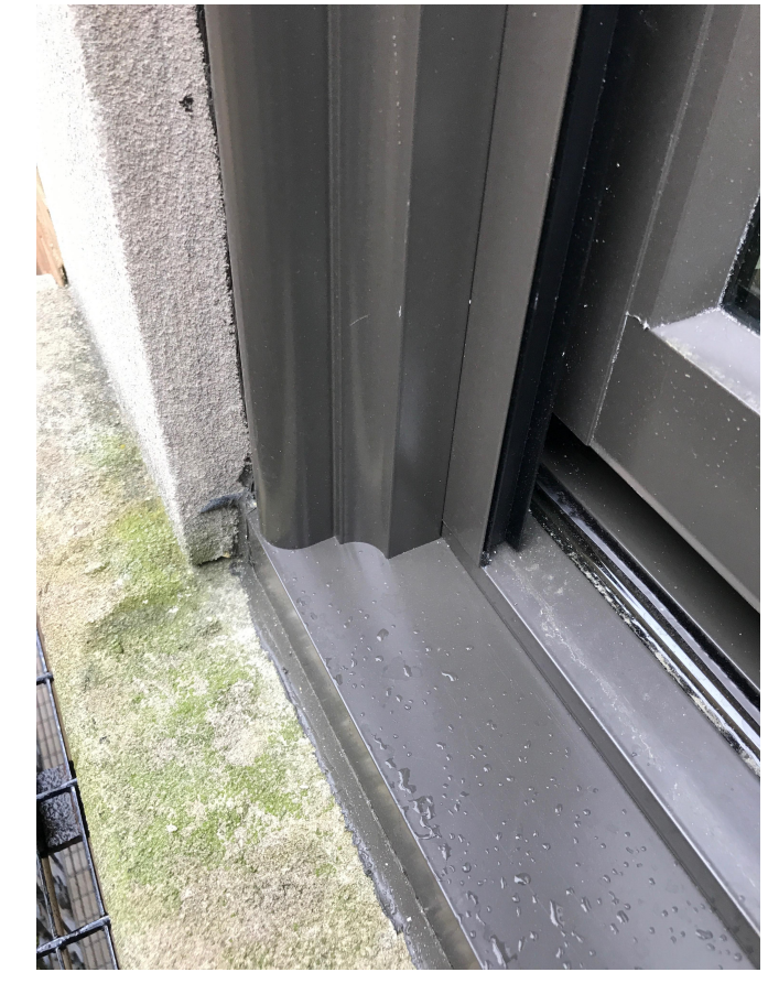
<u>DETAIL D</u> - PROPOSED WINDOW BRICK MOLD AT JAMB / SILL NOTE: SILL PANNING DETAIL MATCHES HISTORIC PHOTOGRAPH