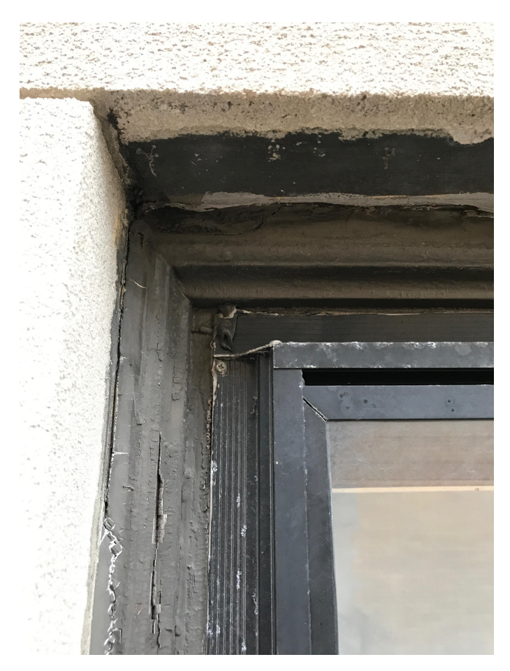
<u>DETAIL A</u> - EXISTING WINDOW BRICK MOLD AT JAMB / HEAD