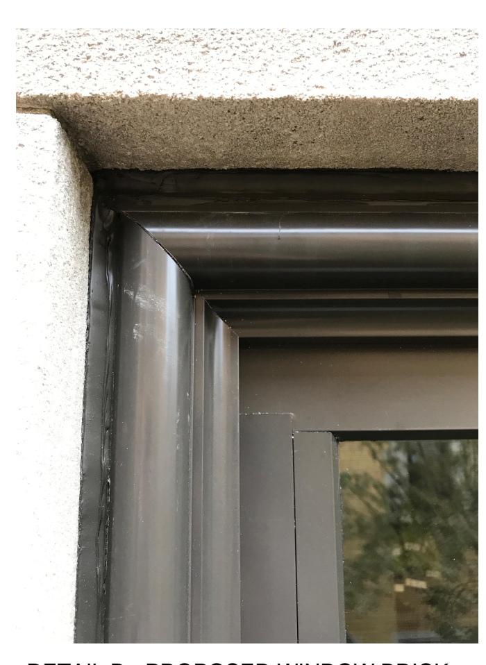
<u>DETAIL B</u> - PROPOSED WINDOW BRICK MOLD AT JAMB / HEAD