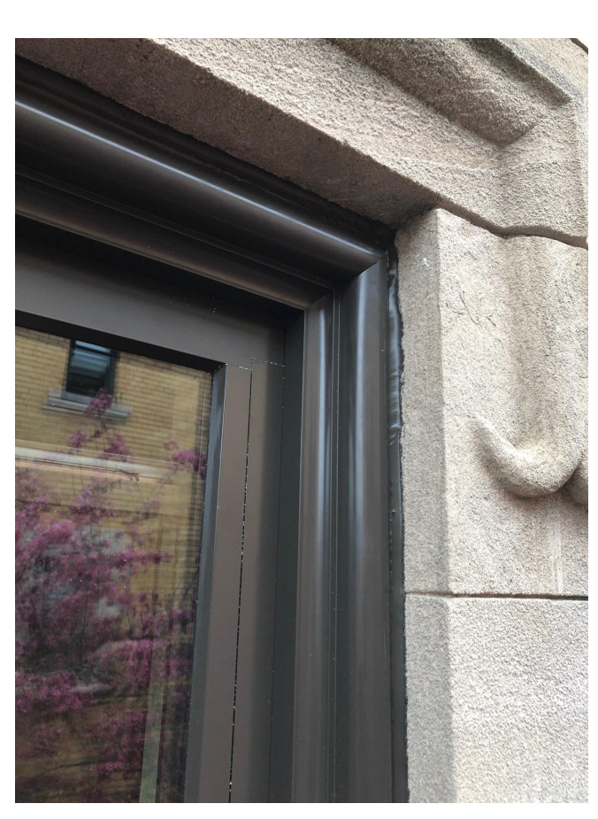
<u>DETAIL F</u> - PROPOSED WINDOW BRICK MOLD AT JAMB / HEAD