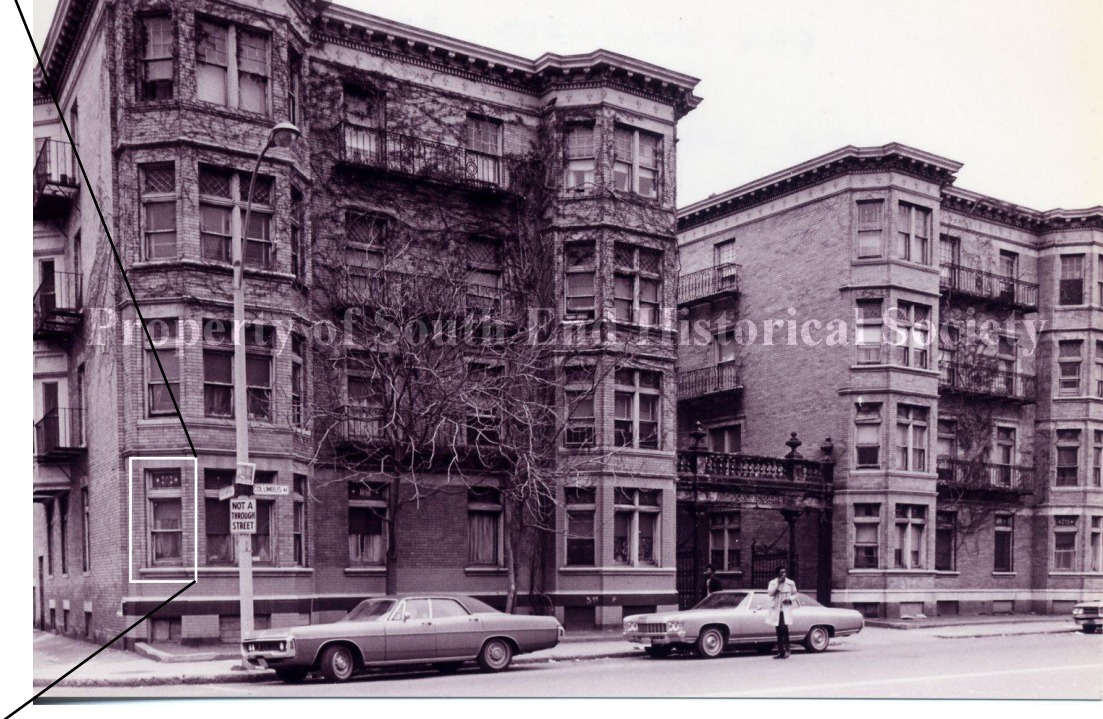
HISTORIC SILL PANNING. NEW ALUMINUM WINDOW TO MATCH. SEE DETAIL D