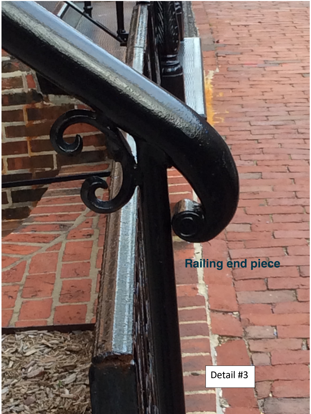
Railing end piece