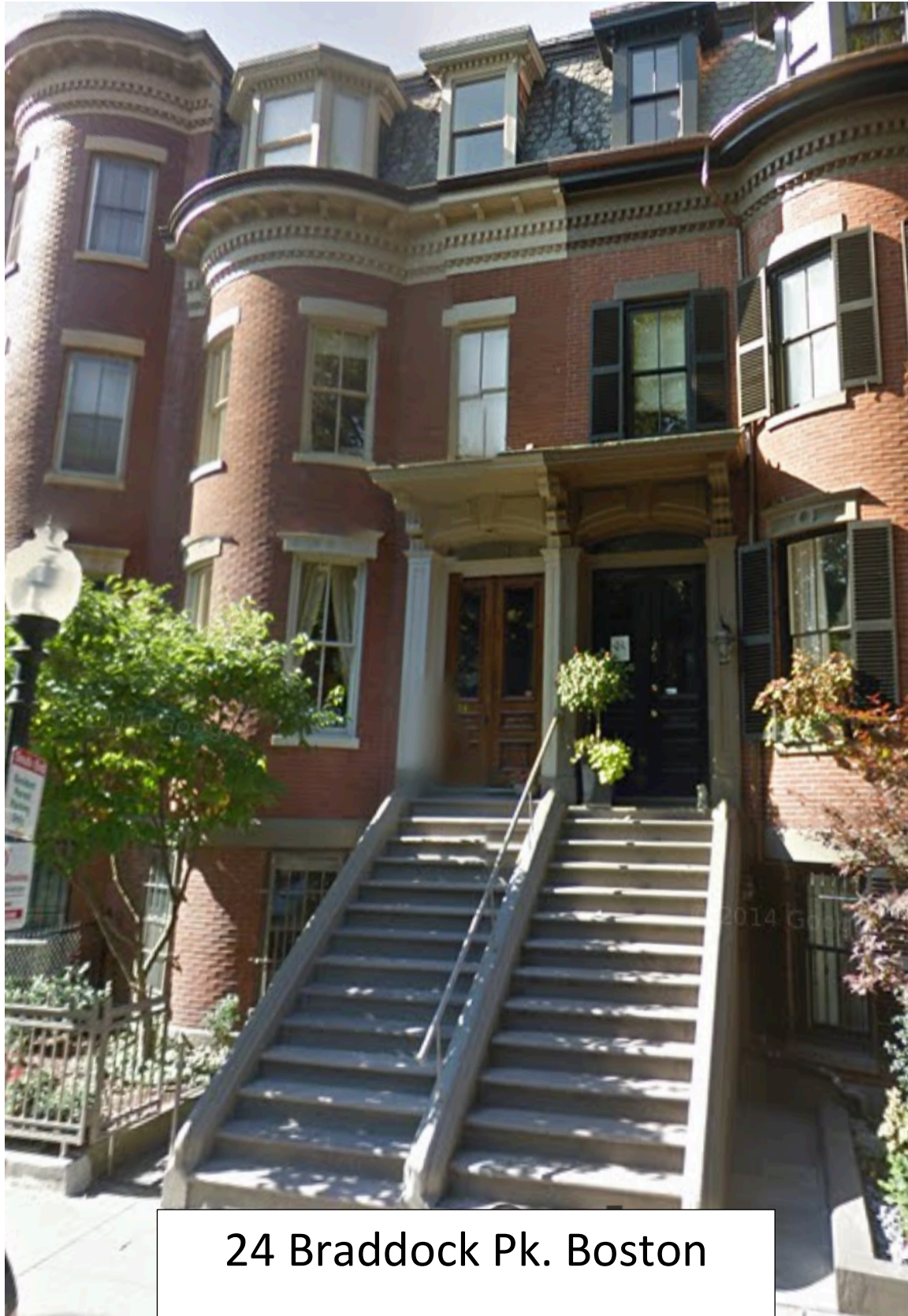
24 Braddock Pk. Boston Landmarks Application 18.1355 SE