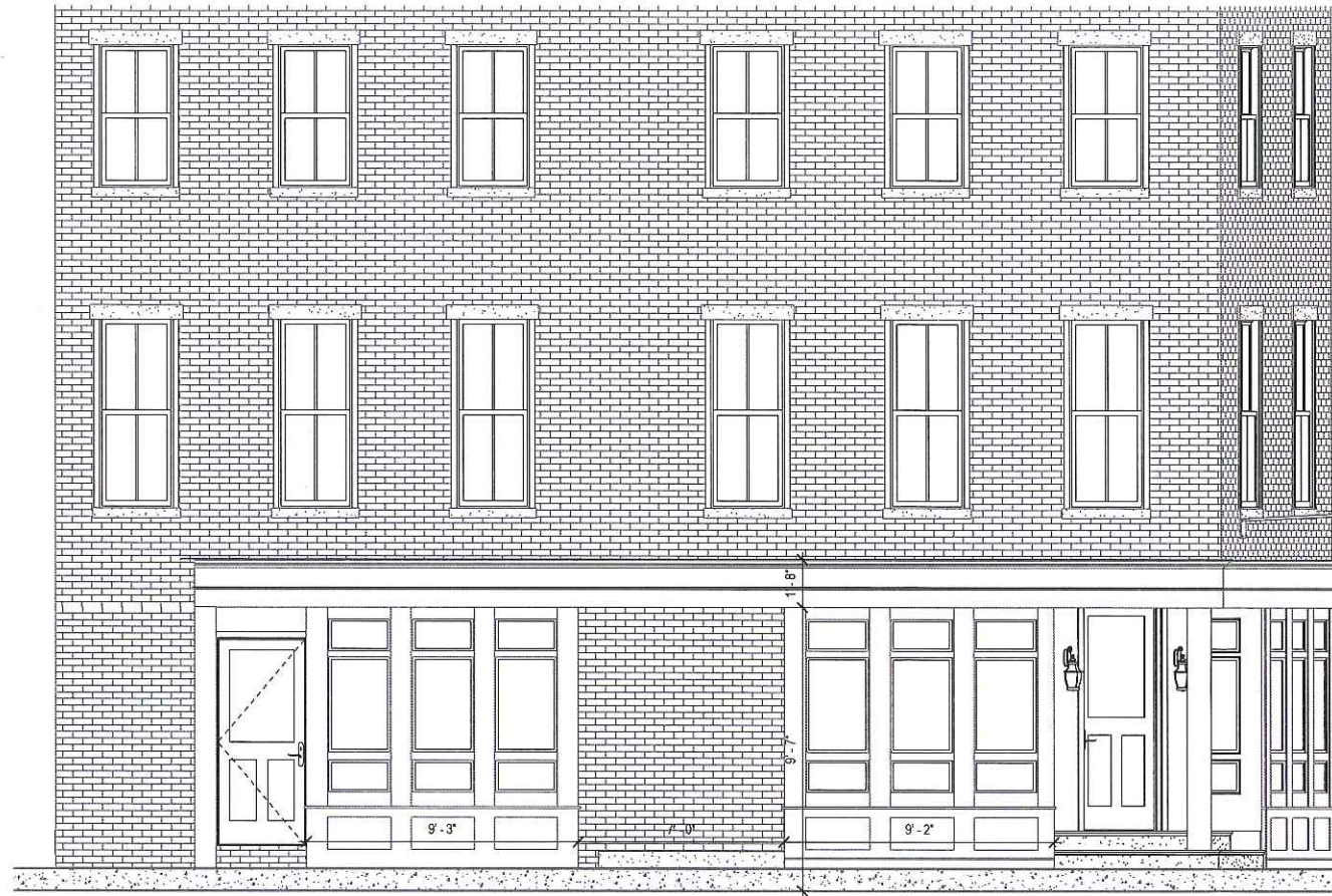
① Milford St Existing 3/8" = 1'-0"