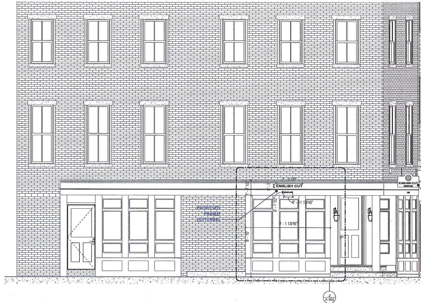
③ Milford St Proposed 3/8" = 1'-0"