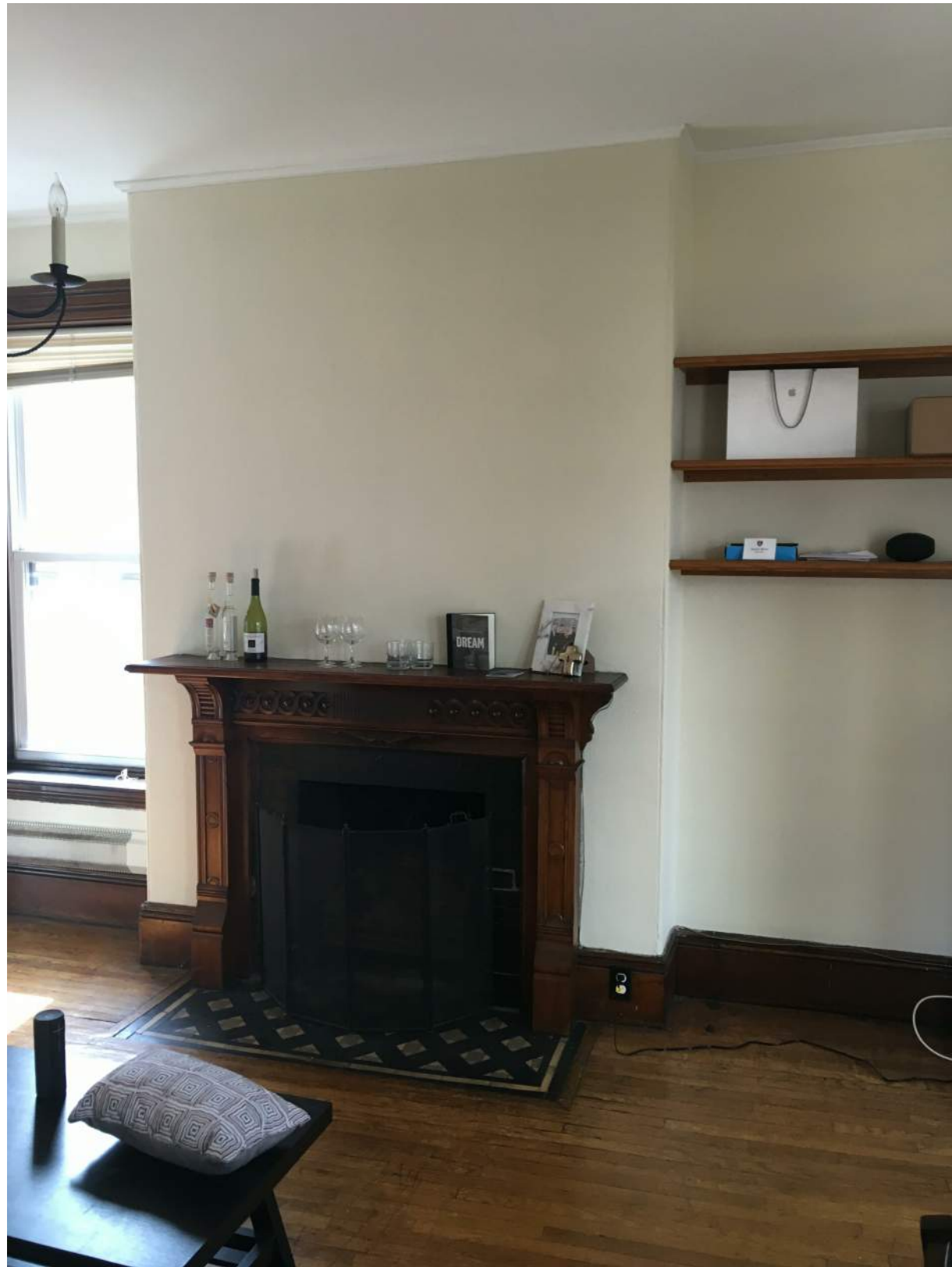
EXISTING CHIMNEY BREAST AT INTERIOR - SECOND FLOOR