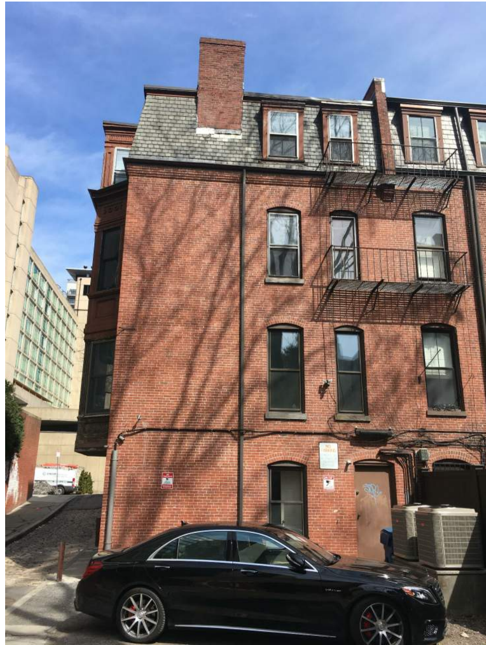
258 W NEWTON ST - REAR ELEVATION