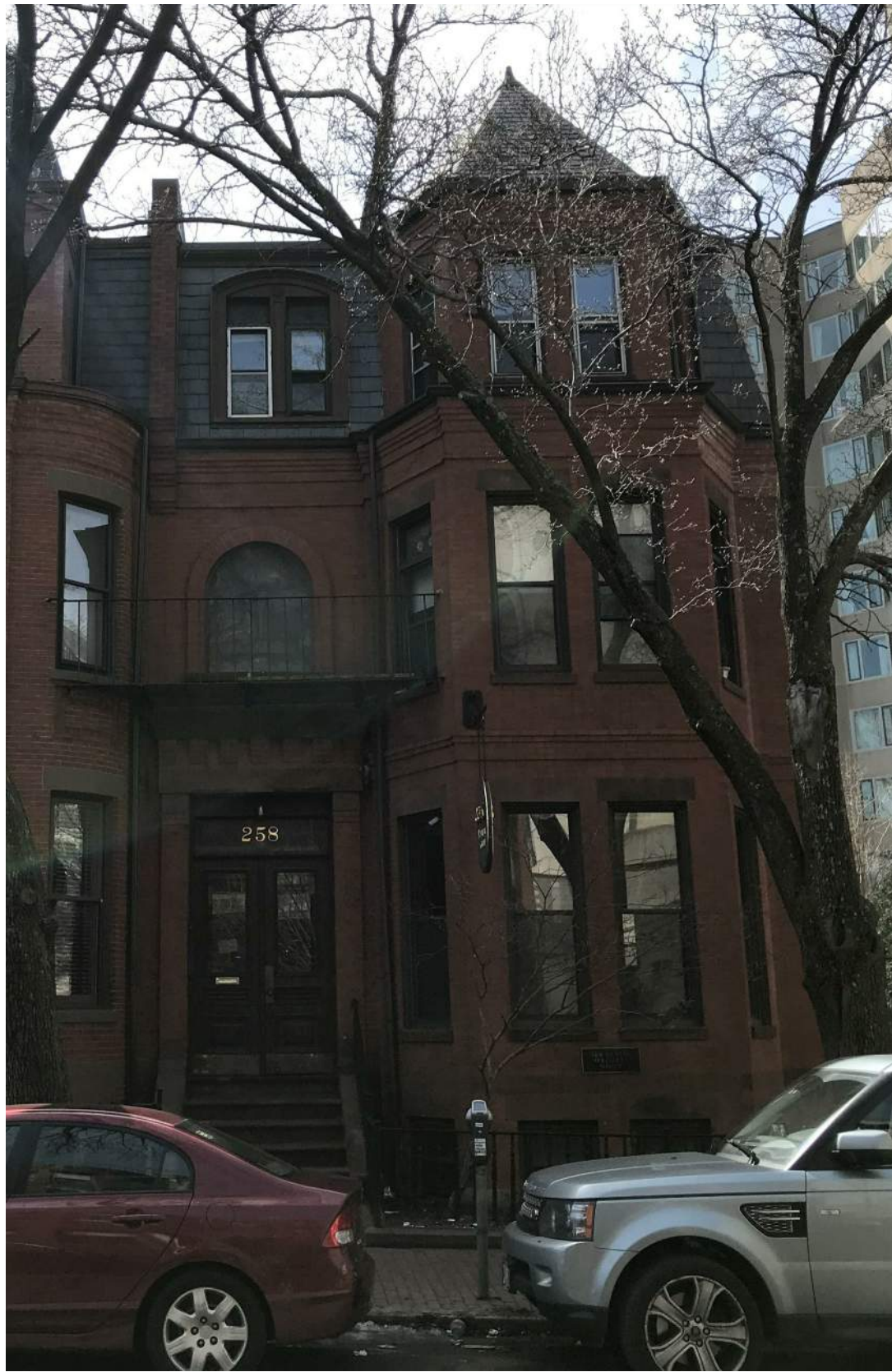
258 W NEWTON STREET