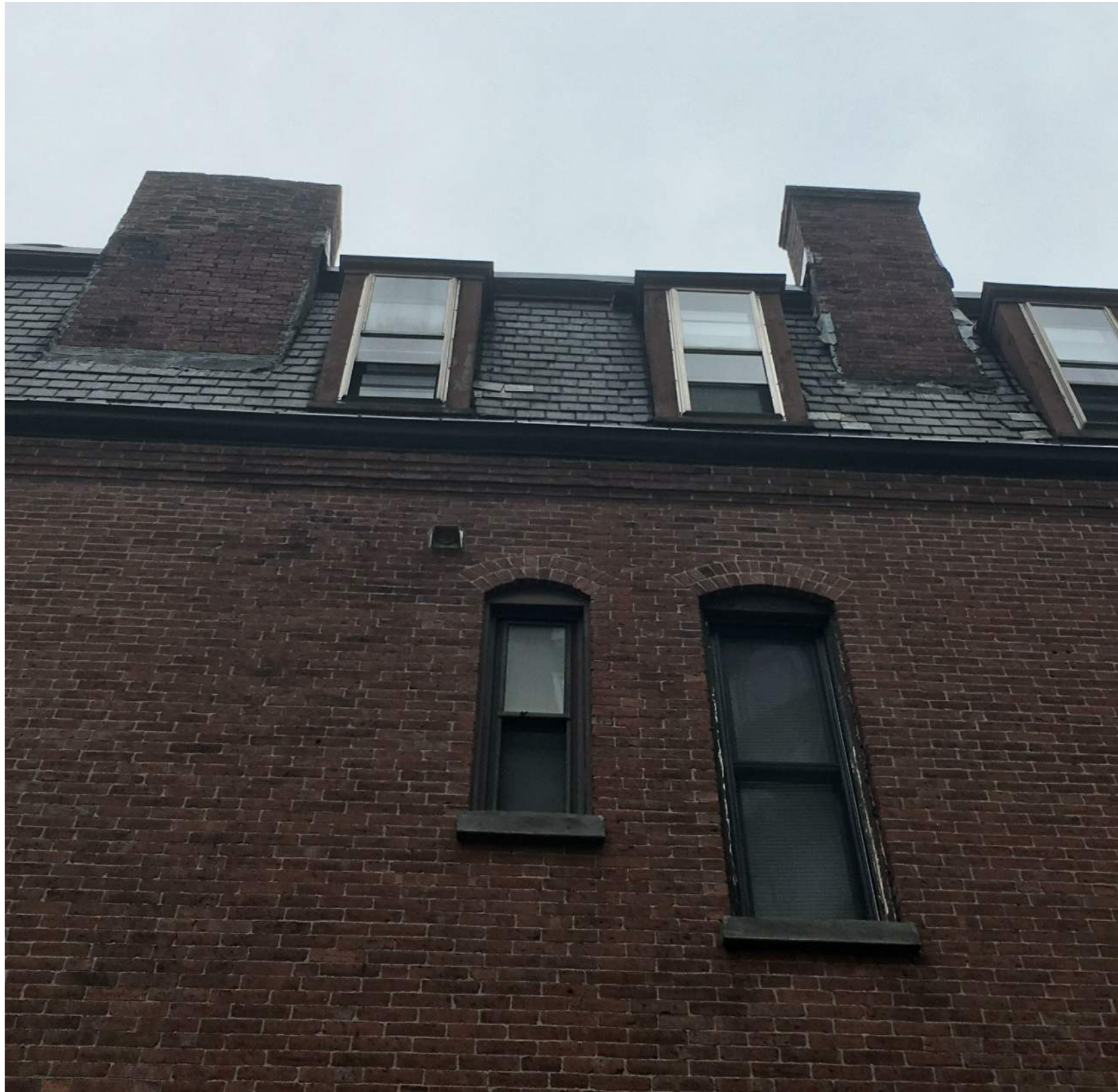
EXISTING CHIMNEYS AT ALLEY (NORTH) FACADE