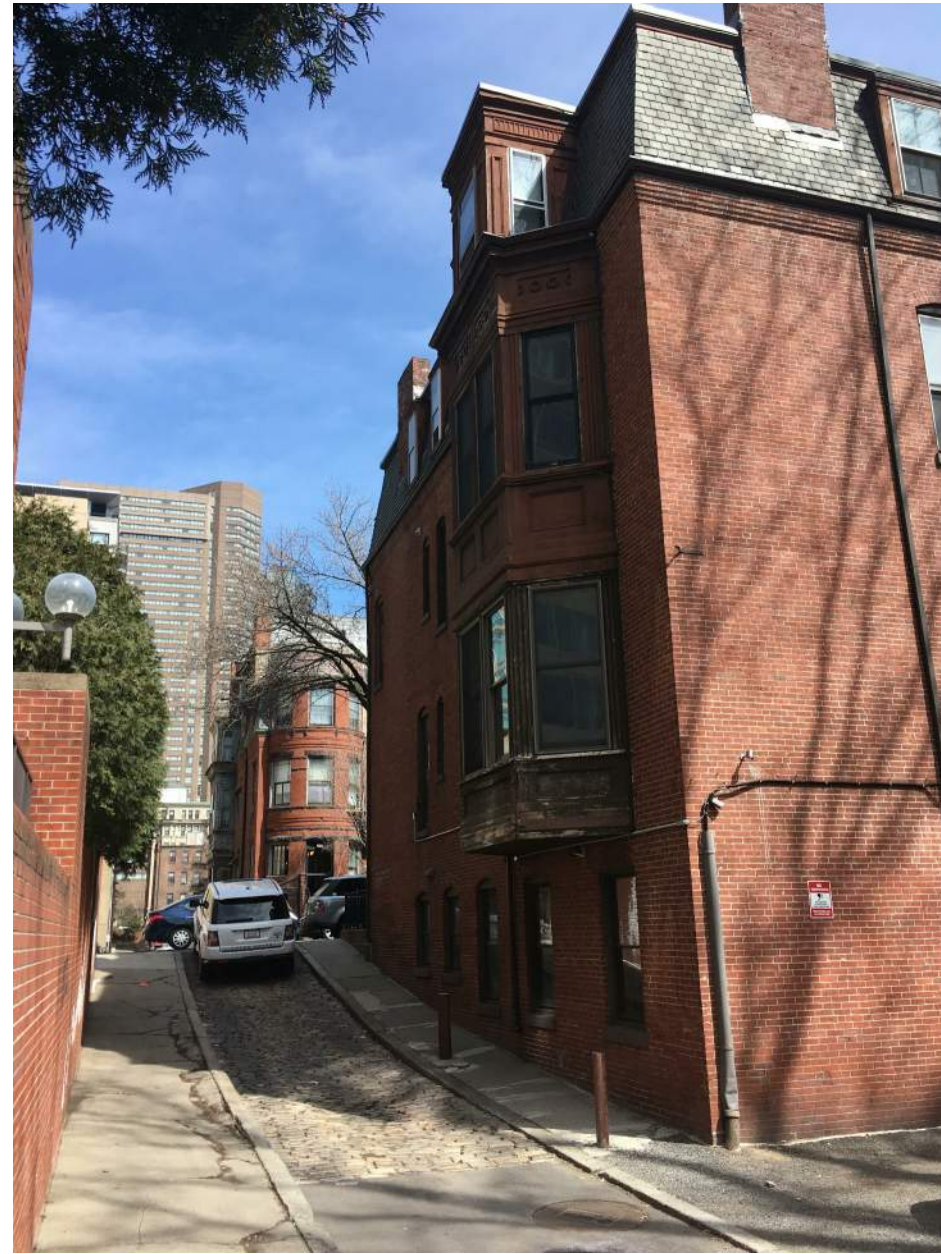
258 W NEWTON - SIDE ELEVATION (PUBLIC ALLEY 403)