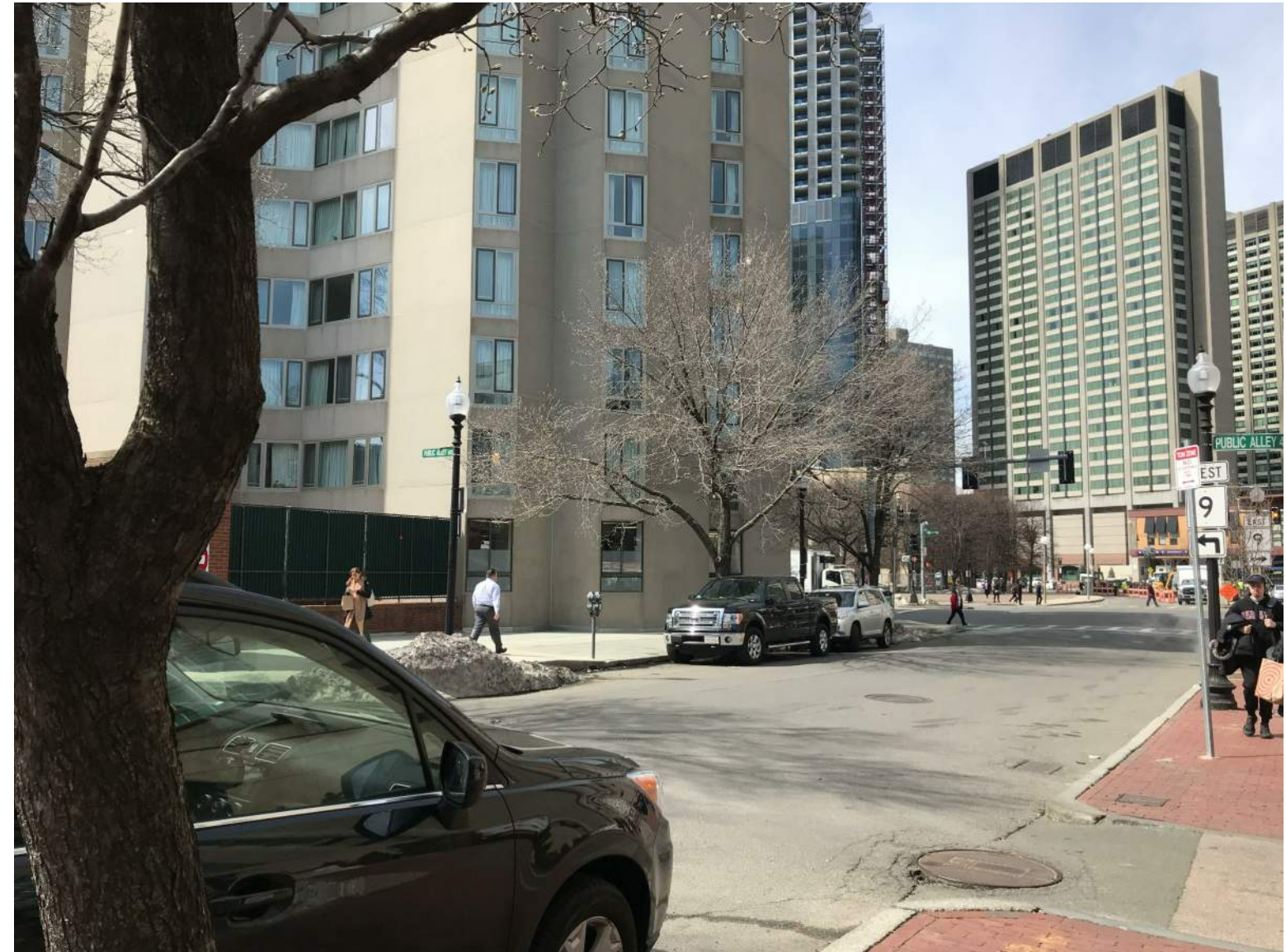
W NEWTON STREET FACING SOUTHEAST