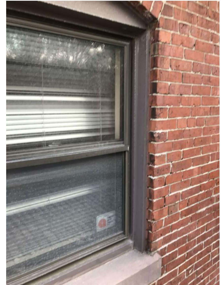
NON-HISTORIC REPLACEMENT WINDOWS AT ALLEY