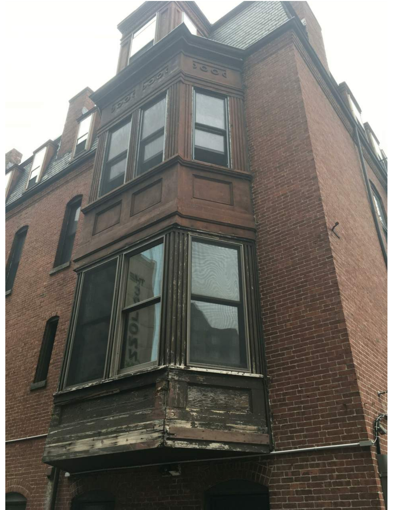
EXISTING ORIEL AT ALLEY (NORTH) FACADE