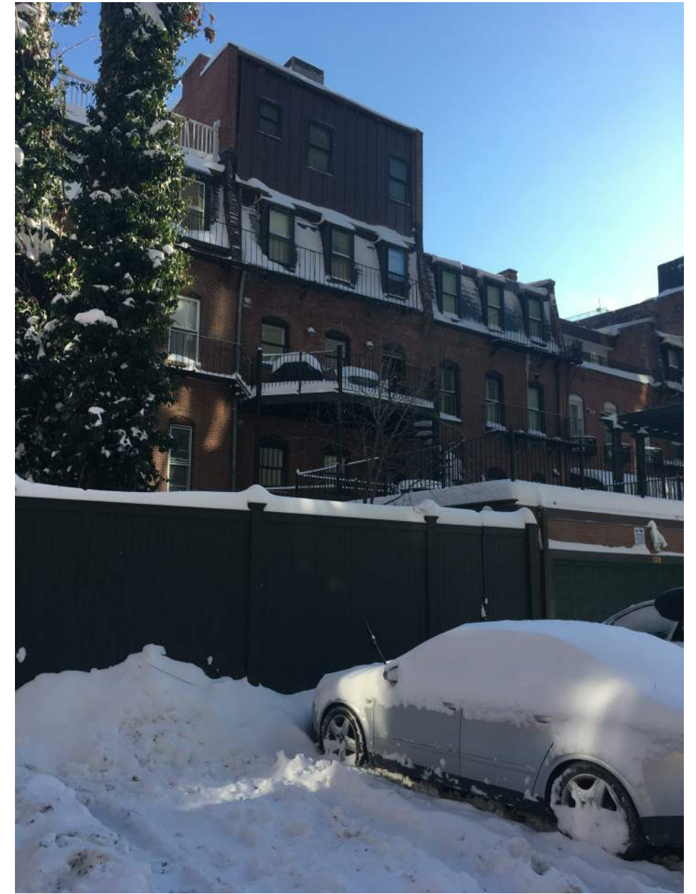
PUBLIC ALLEY 403