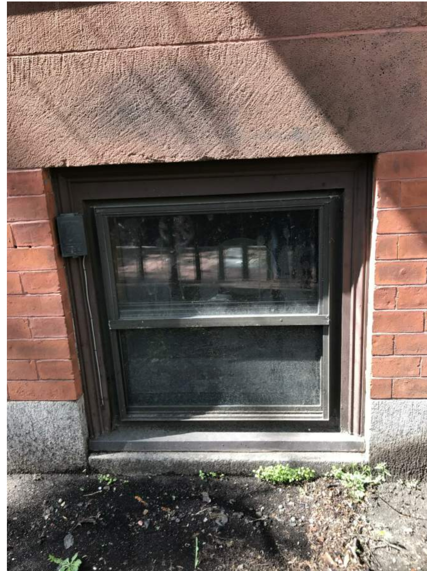
PARTIAL FRONT ELEVATION - NON-HISTORIC REPLACEMENT WINDOWS