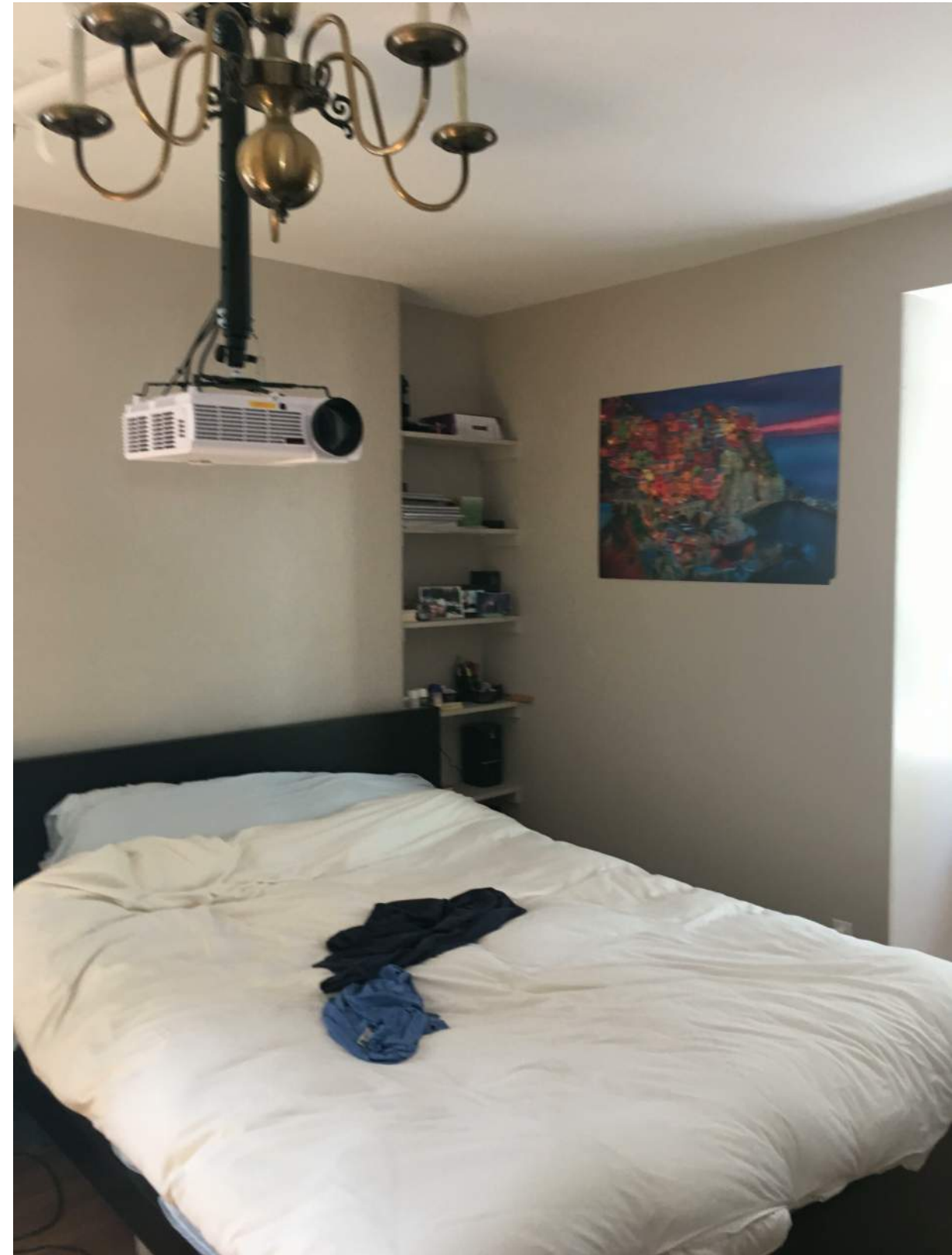
EXISTING CHIMNEY BREAST AT INTERIOR - THIRD FLOOR