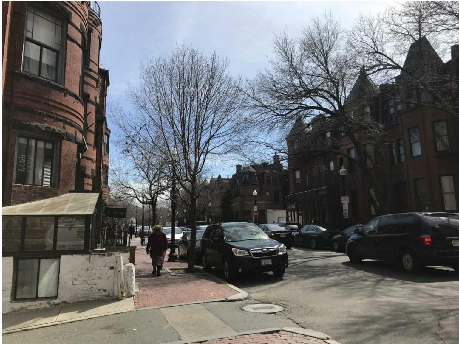
W NEWTON STREET FACING NORTHWEST