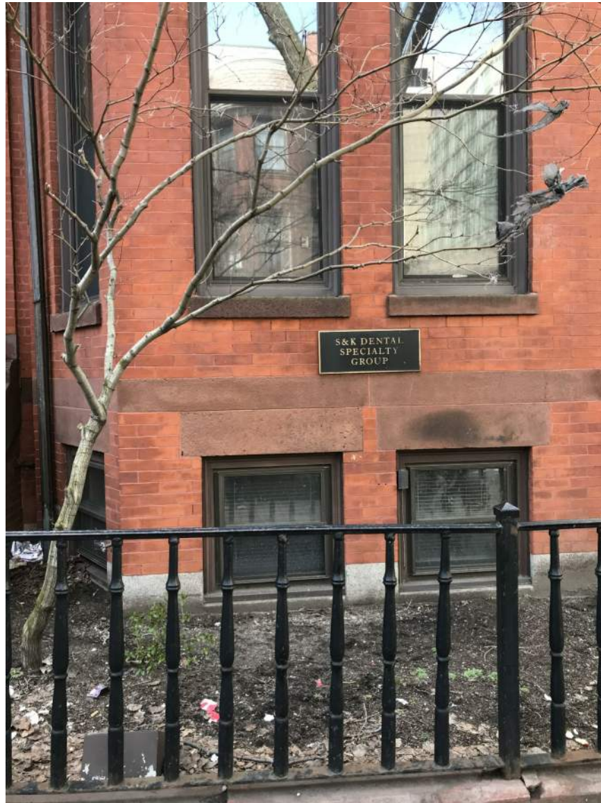
PARTIAL FRONT ELEVATION - NON-HISTORIC REPLACEMENT WINDOWS