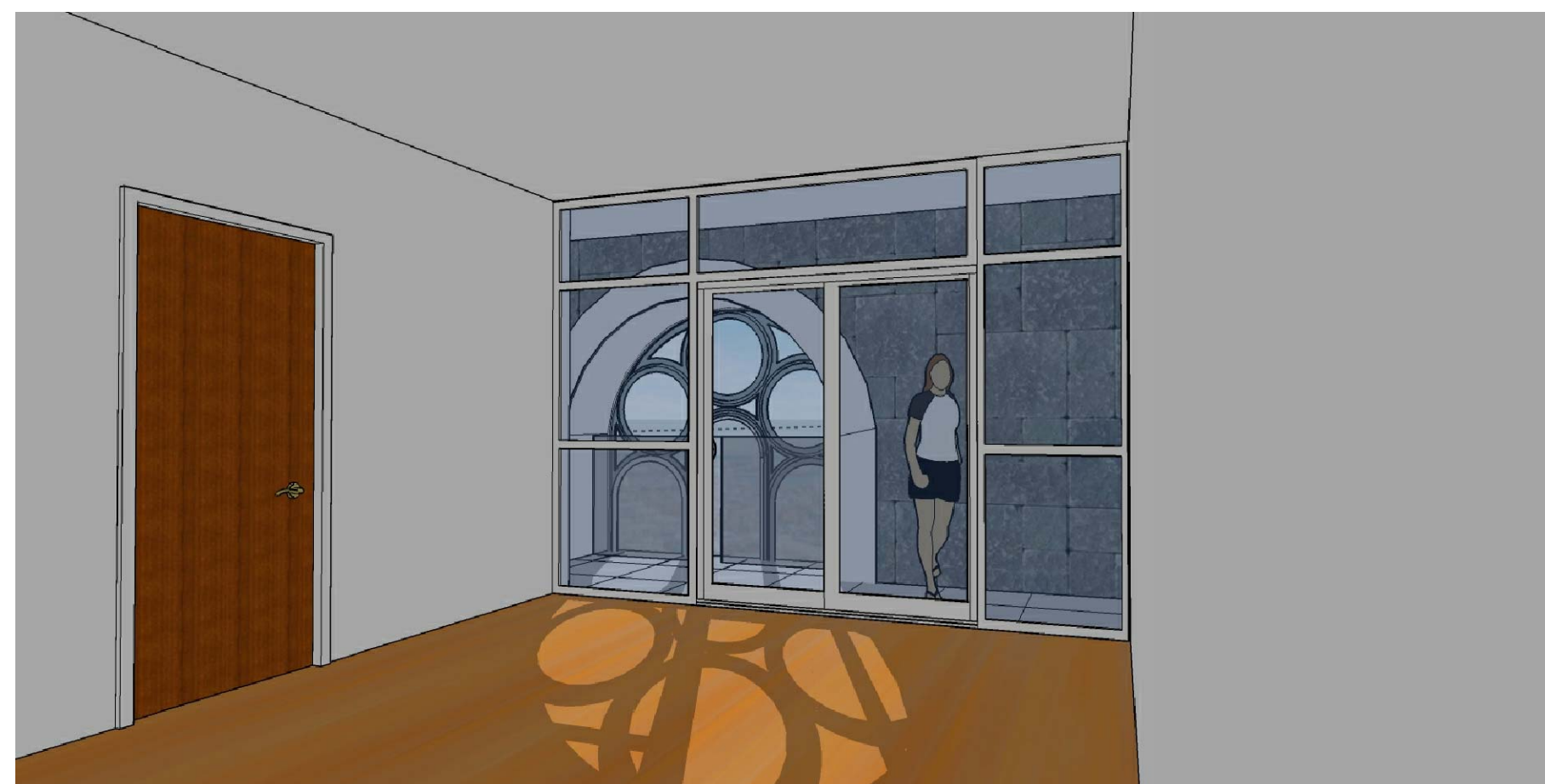
TYPICAL 4TH FLOOR UNIT