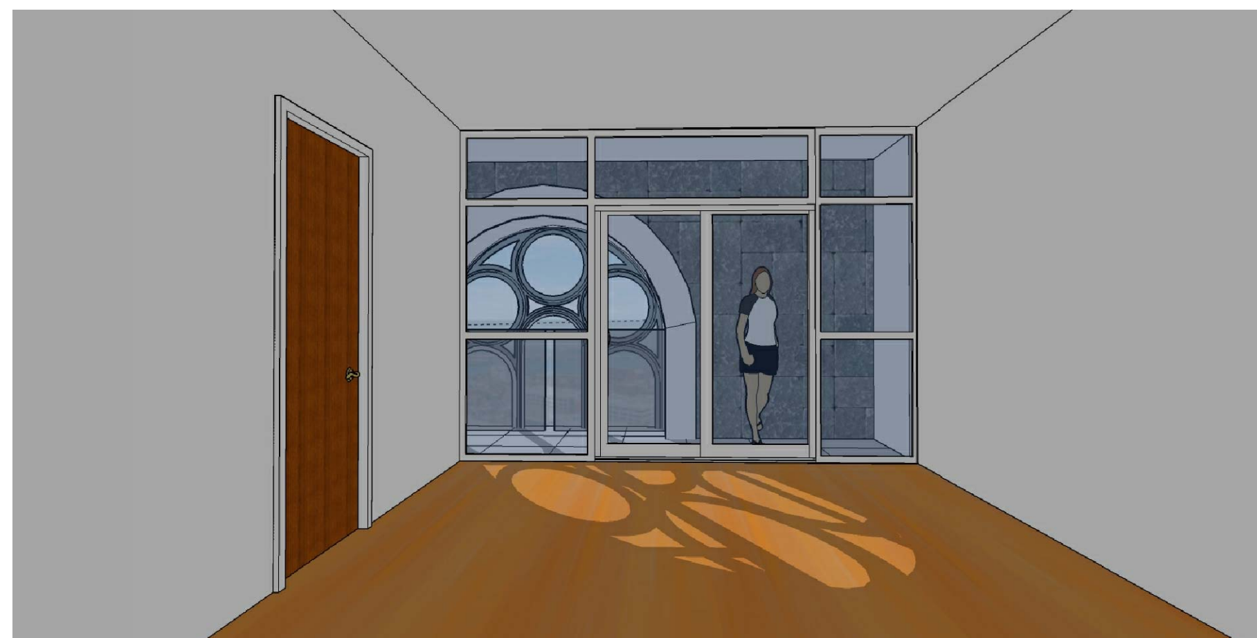
TYPICAL 4TH FLOOR UNIT