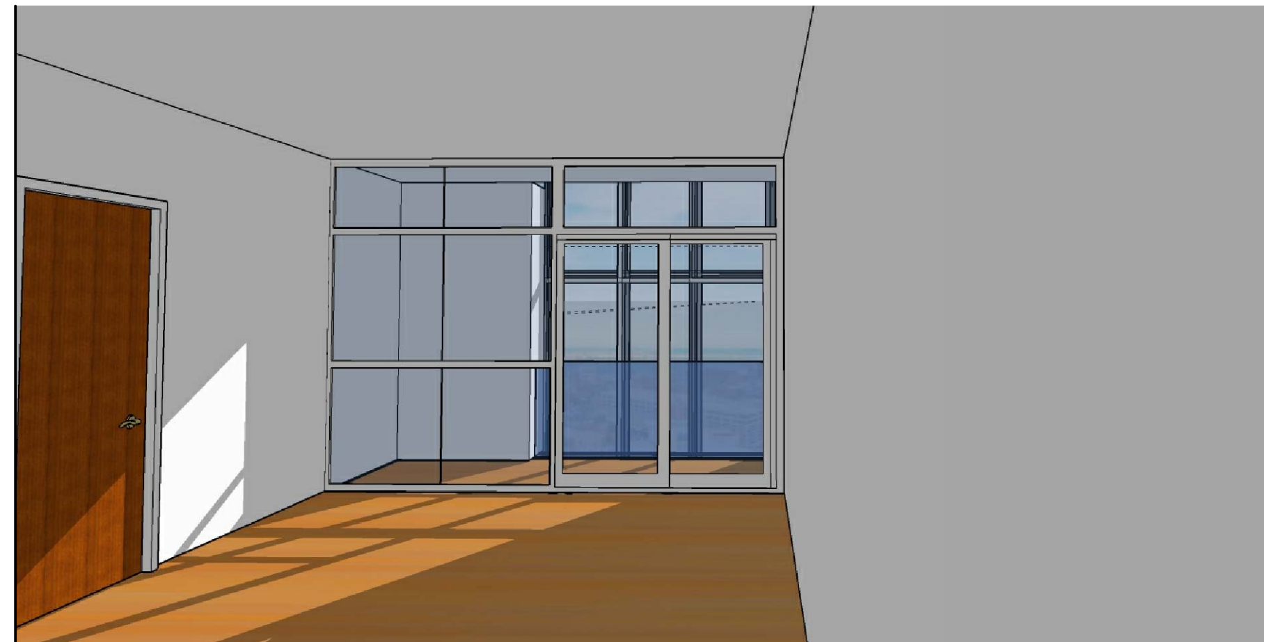
TYPICAL 2ND & 3RD FLOOR UNIT