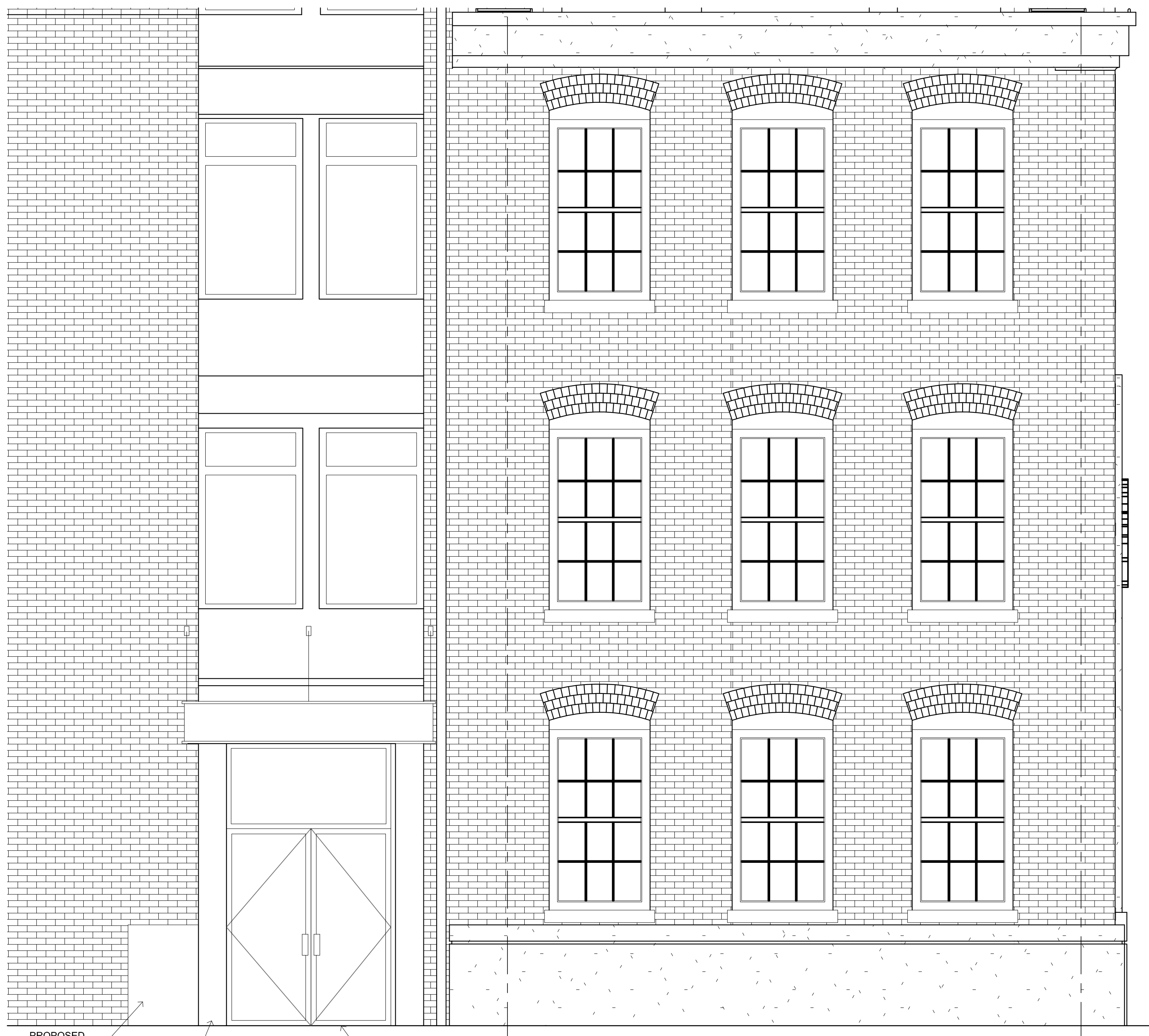
3 ELEVATION @ NEW ENTRY 3/8"=1'-0"

PROPOSED PLANTER INFILL EXIST MO TO ACCOMMODATE NEW DOOR ASSEMBLY NEW ENTRY DOOR W/ TRANSOM & AWNING ABOVE