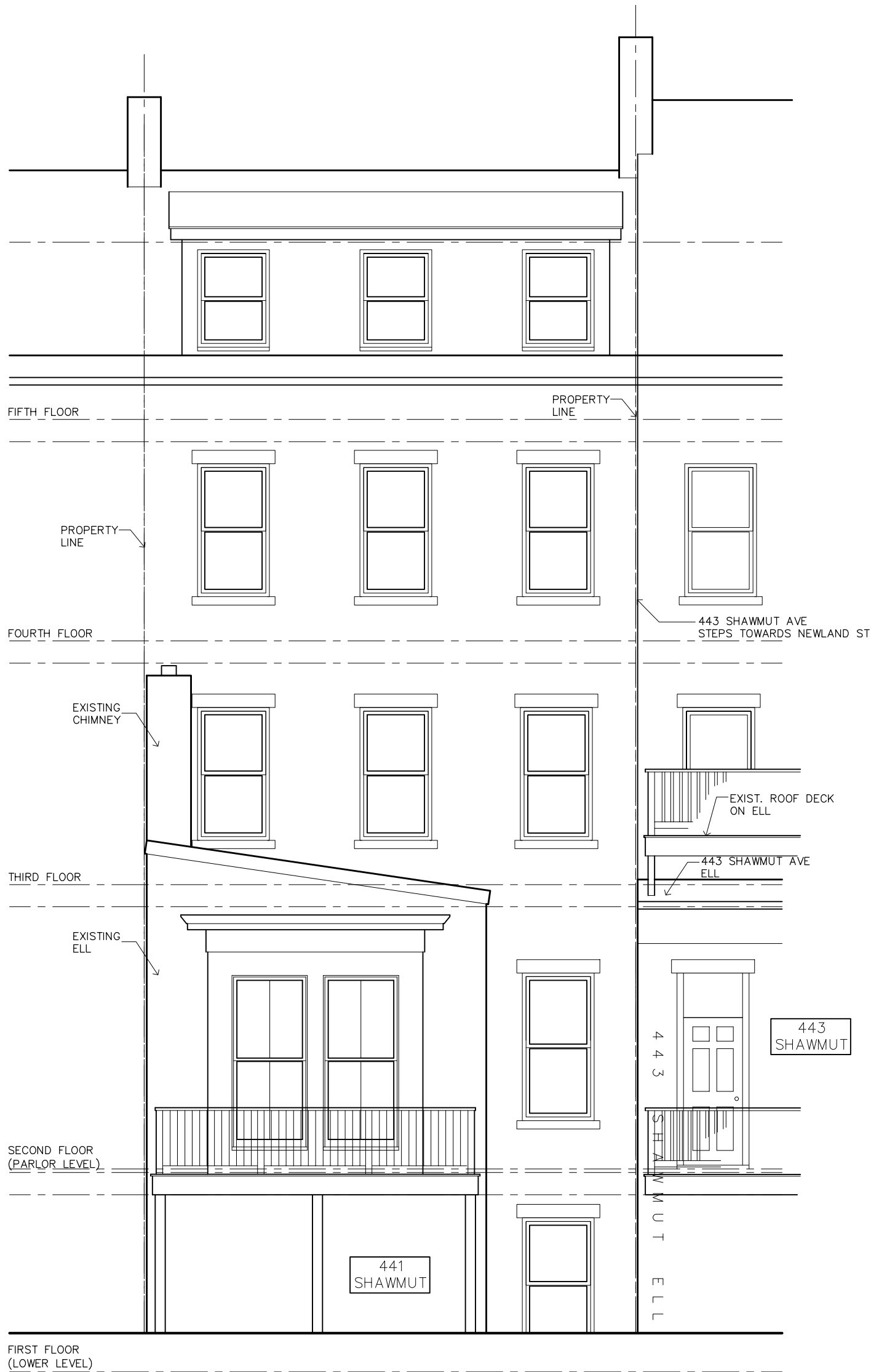
1 EXISTING REAR ELEVATION 3/16" = 1'-0"