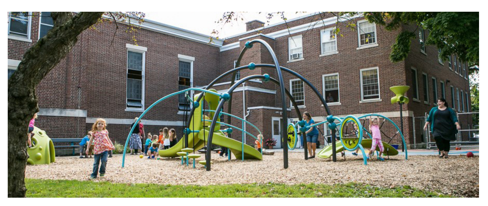
large/traditional play structure