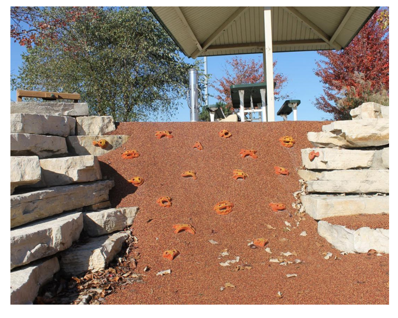
rubber slope/ hand holds