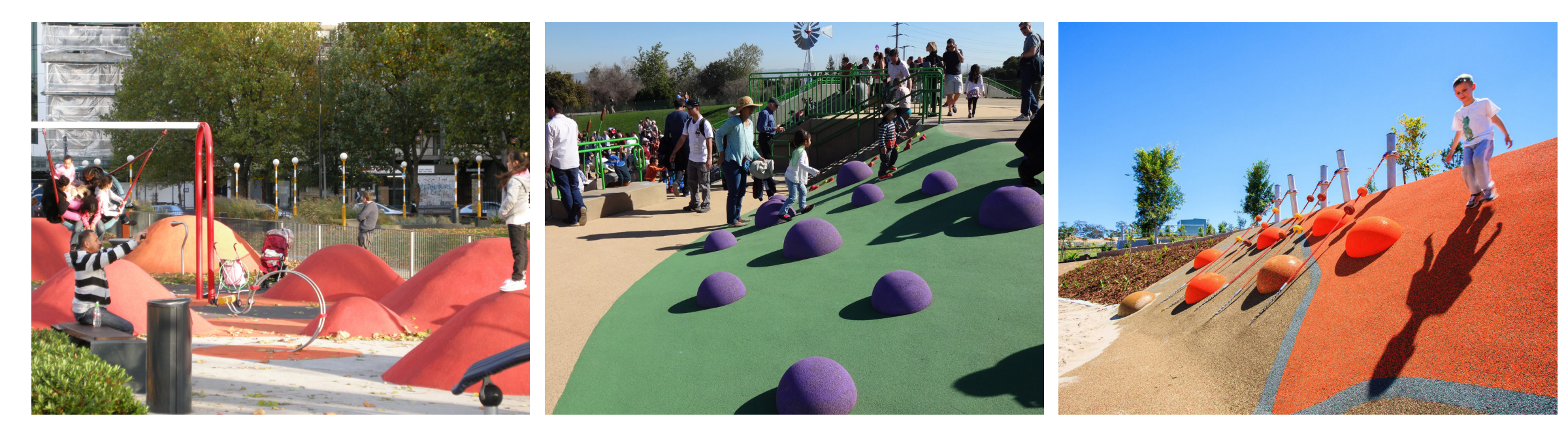
rubber bubbles / bubble mounds