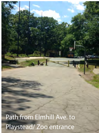
Path from Elmhill Ave. to Playstead/ Zoo entrance