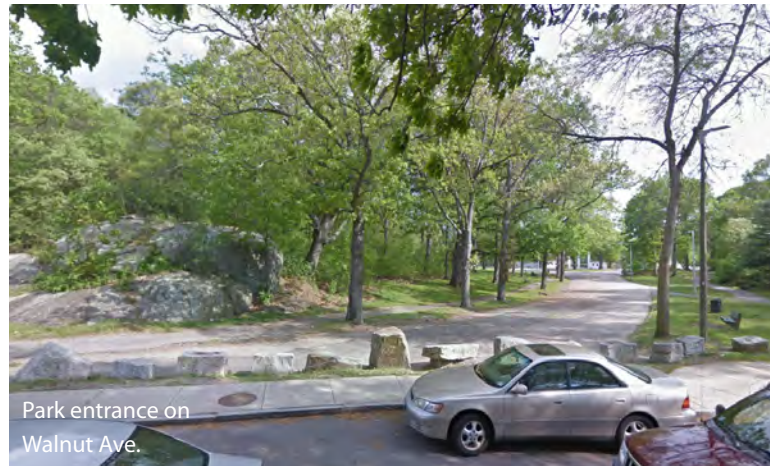
Park entrance on Walnut Ave.