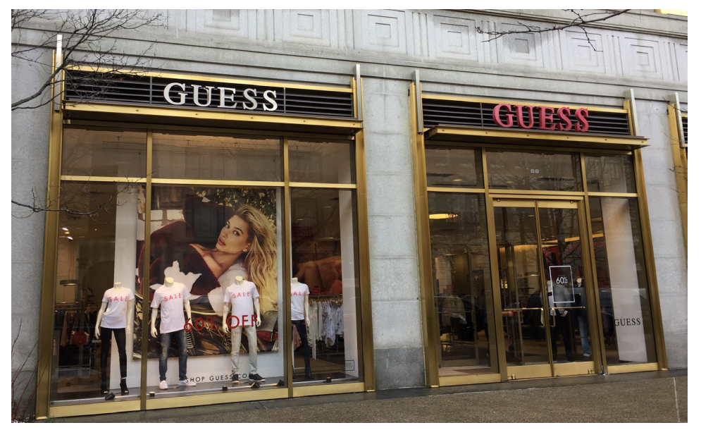
GUESS GUESS GUESS GUESS GUESS