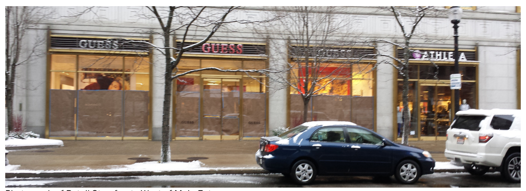
Photograph of Retail Storefronts West of Main Entry