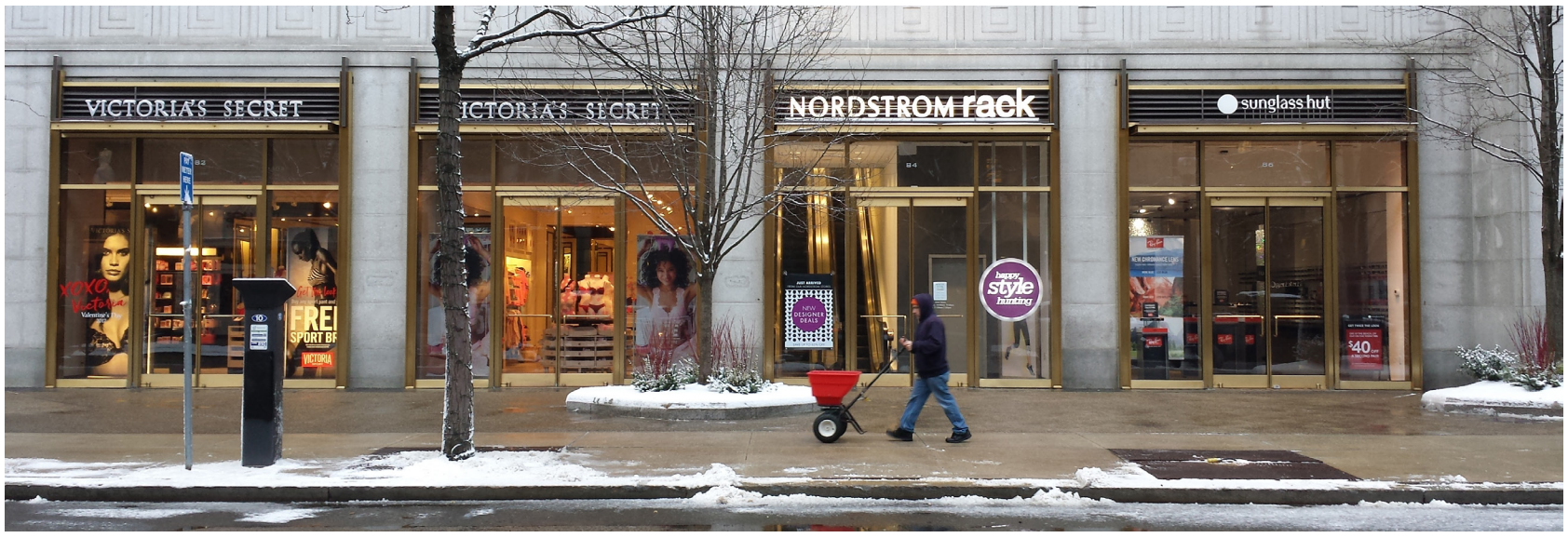
Photograph of Retail Storefronts East of Main Entry