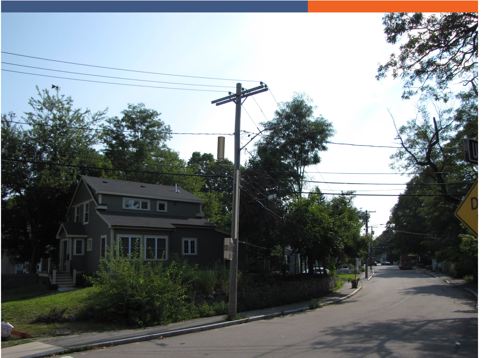
Proposed Conditions: Wood utility pole with equipment & side mounted antenna.