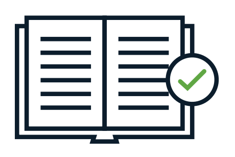
BOOKS Paperback and Telephone books