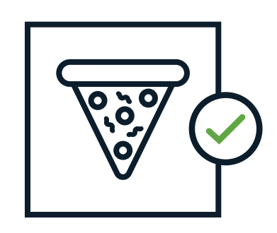
PIZZA BOXES Remove food, pizza savers (pizza tables) and liners