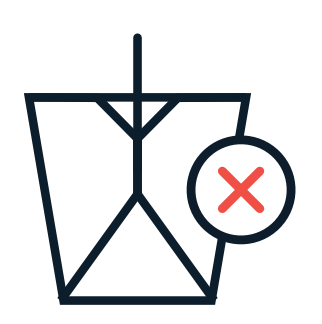
DRINK AND FOOD BOXES