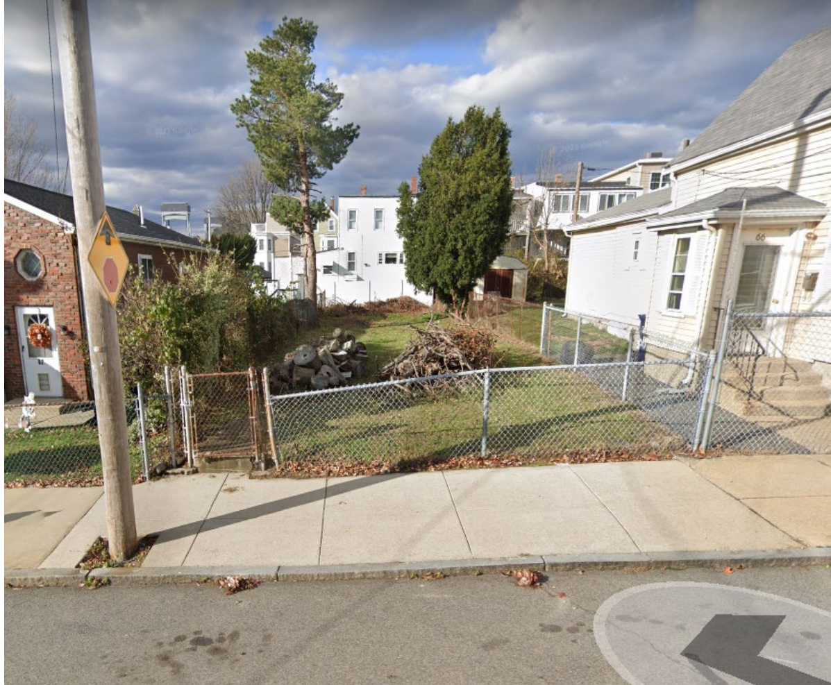
View from Homer Street