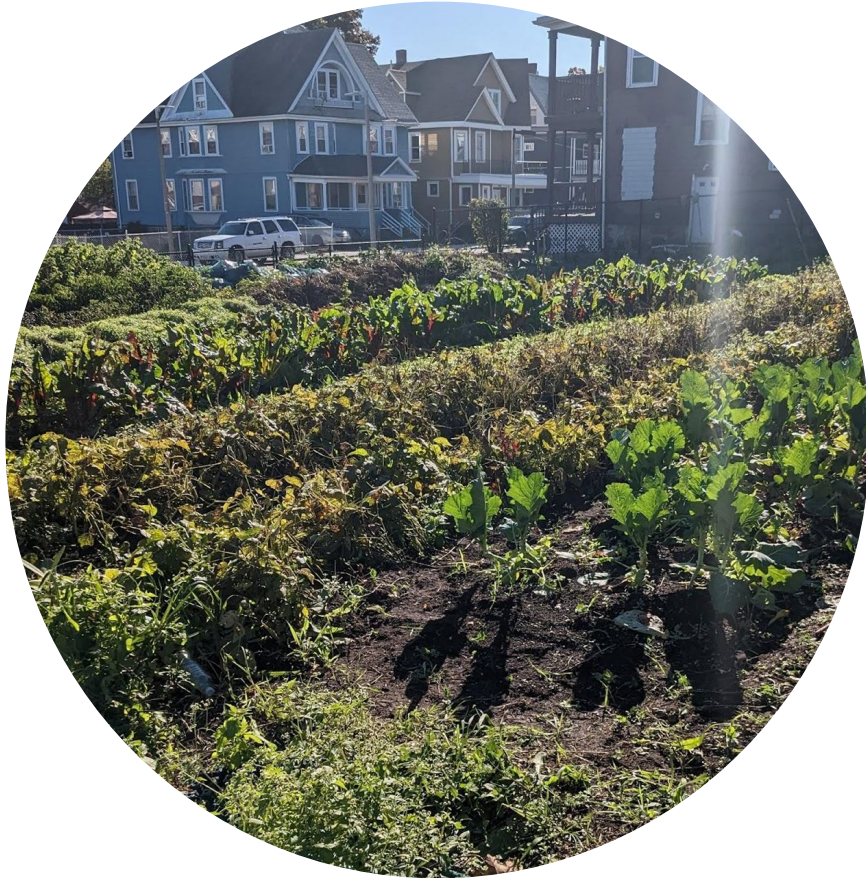
The Food Project - East Cottage Farm