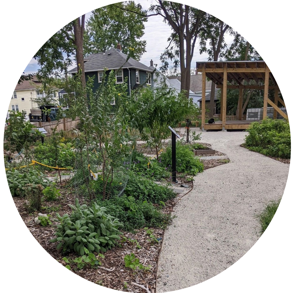
Edgewater Food Forest, Mattapan