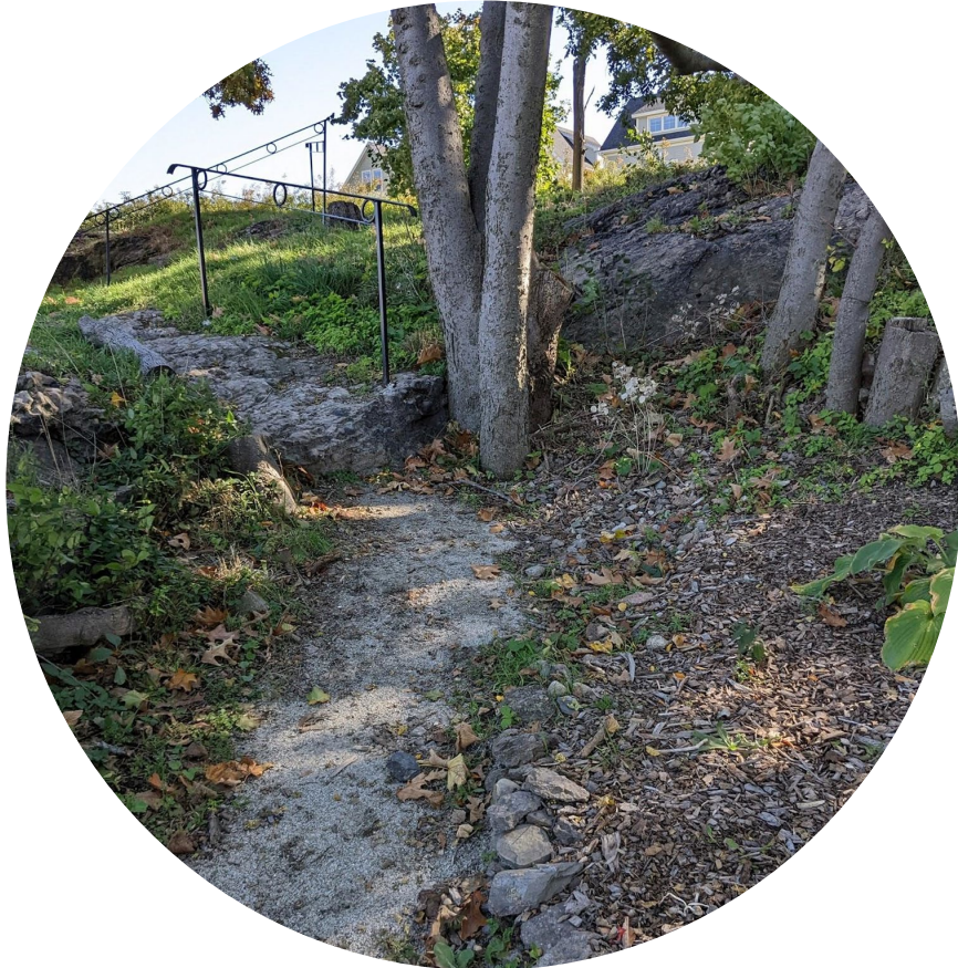
Savin Hill Wildlife Garden